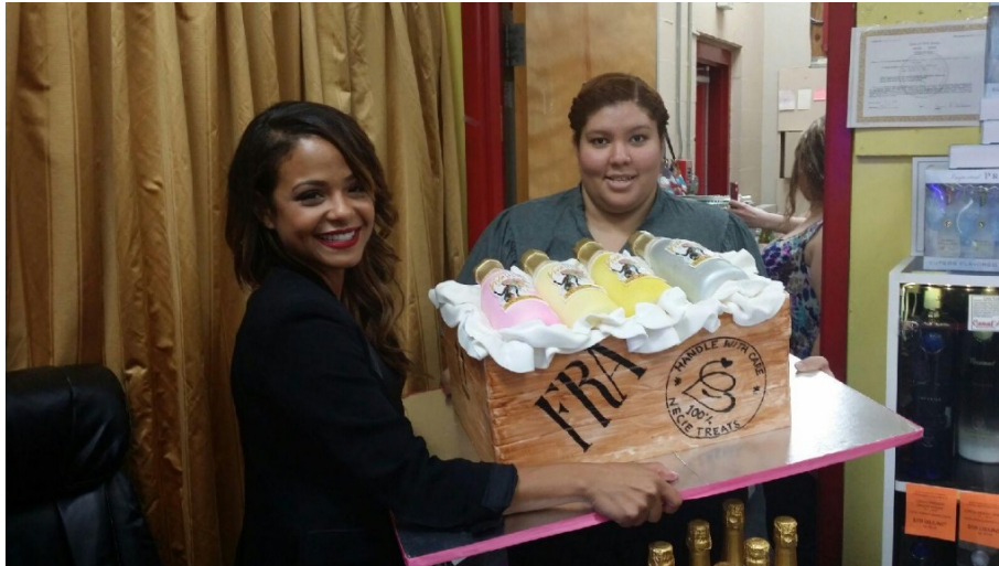
Christina Milian with Viva Diva Wines.

club bangers, a couple of ballads, R&B, and pop” in our celebrity interview.