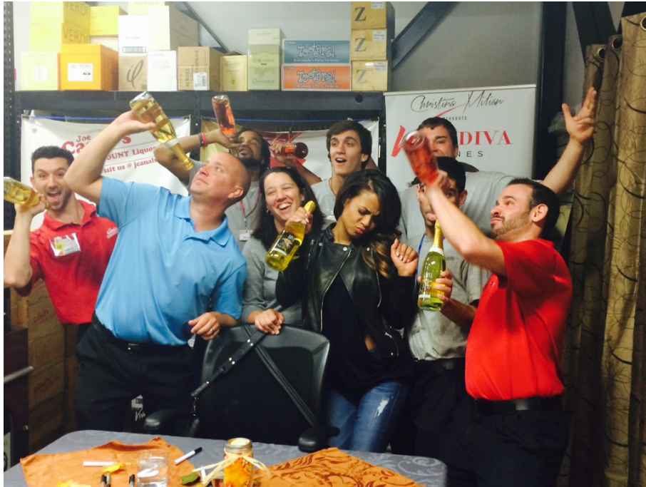
Christina Milian celebrating with Viva Diva Wines.

think we sometimes take things too seriously. Sometimes, you need to shout, dance, and scream out loud! You can be serious all day, or be a confident woman and just go have fun.”