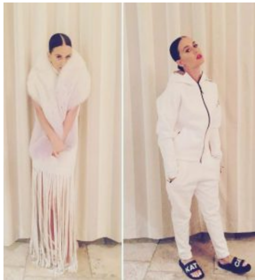
Kate Perry.

While Katy Perry keeps it cool and casual on the right side of this photo, on the left she moves from comfortable to killing it in an instant. While her simple white dress and fur wrap make her look like an innocent starlet from days gone by, the long tassels on the bottom of her skirt hint that a party girl just might be hiding behind that shy expression on her face.