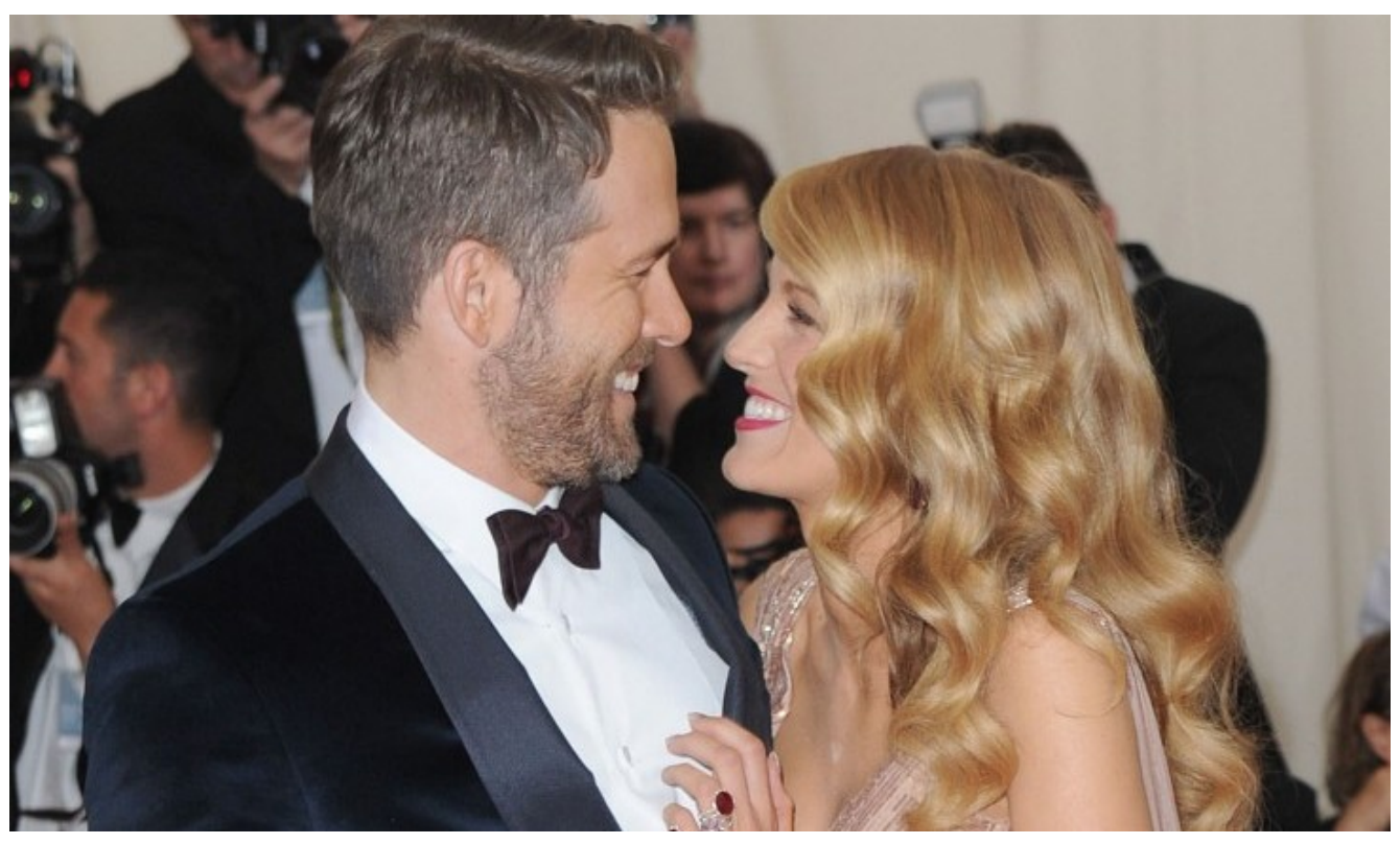
Page 1 of 20