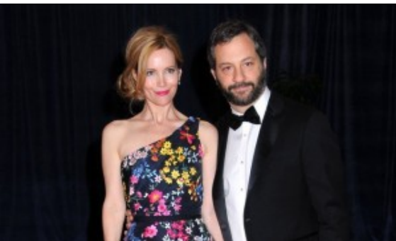
Leslie Mann and Judd Apatow.

5. Watch Oprah together: The funny duo Leslie Mann and Judd Apatow have worked together on many romantic comedies together and have been married for 20 years! The director shared with Vice.com that they both watch Oprah's SuperSoul Sunday and then apply lessons from the show to their marriage each week. Television shows that give you relationship advice can be helpful for you and your partner!