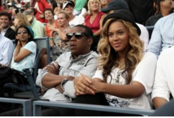
Jay-Z and Beyonce.

Related Link: Relationship Advice: Making Marriage Work Like Beyoncé