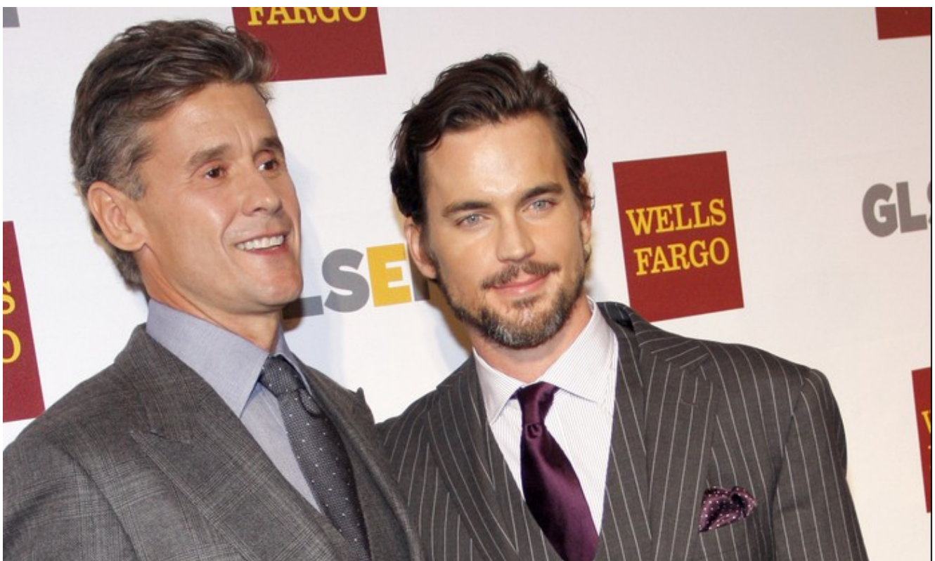
Simon Halls and Matt Bomer