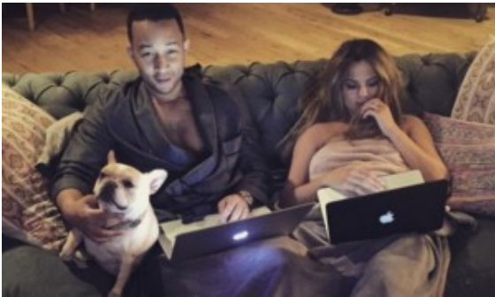
John Legend and Chrissy Teigen.

1. Take breaks from each other: Chrissy Teigen and John Legend may seem like a couple that is together 24/7, but they do spend time apart. According EOnline.com , the couple values trips away from each other because it allows them to miss being together and appreciate their relationship. Spending time apart really does make the heart grow fonder!