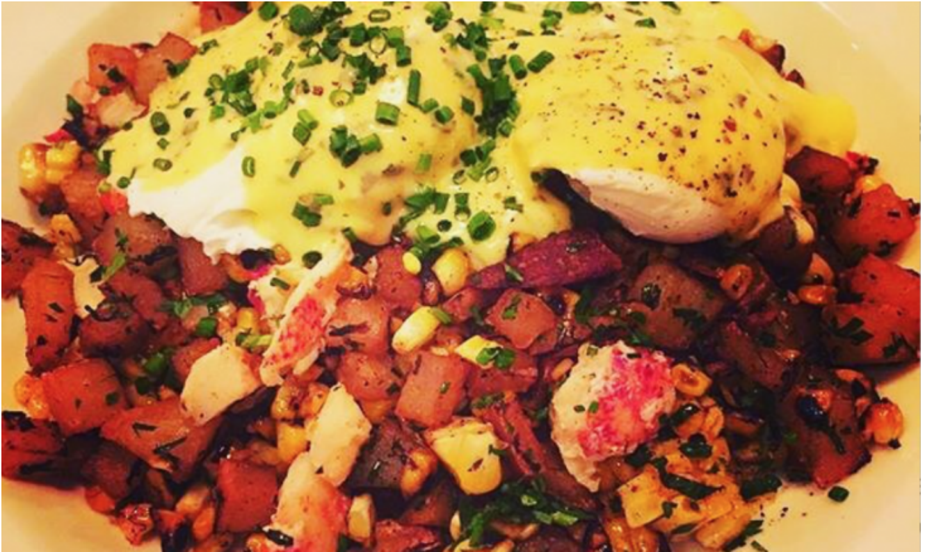
Rue 57 Lobster dish.

Rue 57 may look small and quaint from the outside, but it touts three stories once you walk inside and is decked out in lavish decorations making for a truly elegant experience. The decor will set the mood for dinner and makes a great location for date night . Don't want to eat lunch outside? That okay because they have a beautiful outdoor section where you can enjoy your brunch in the sun.