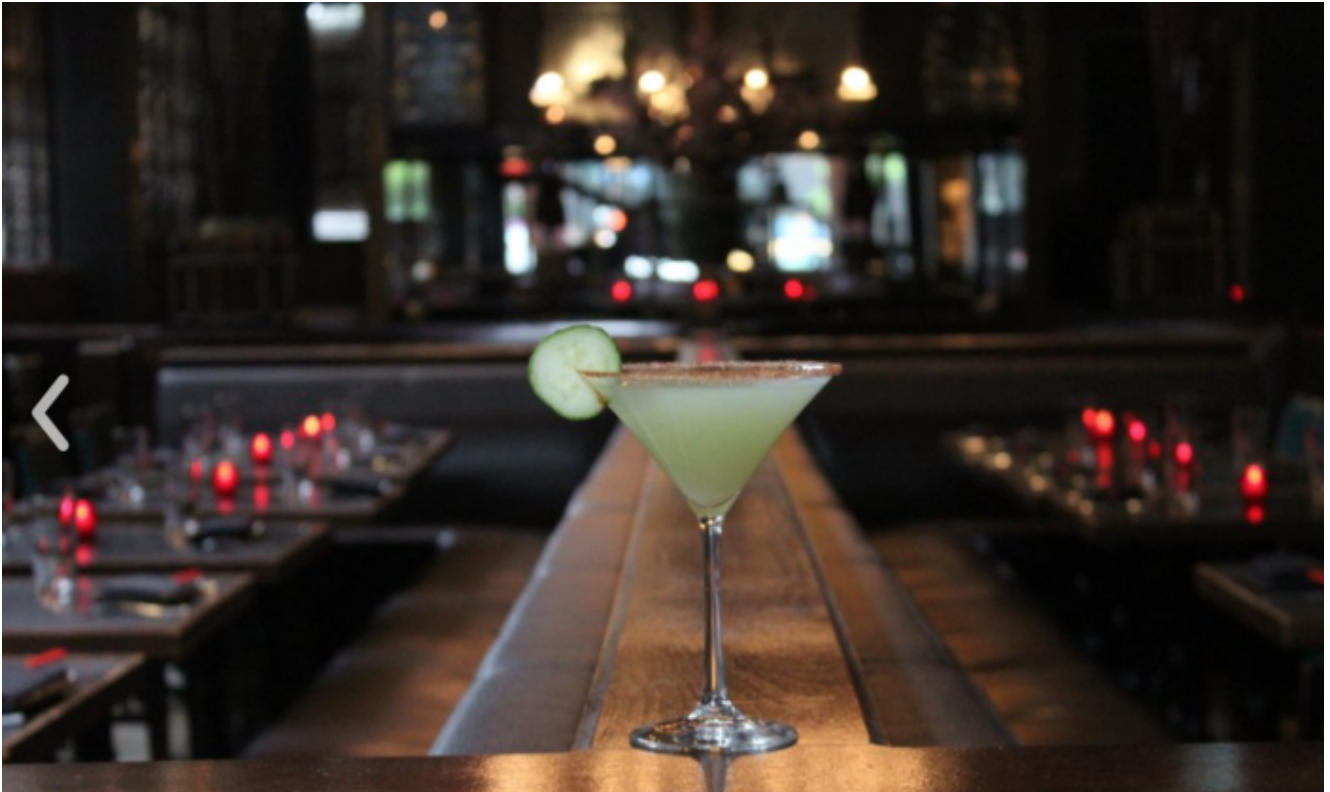
Rue 57 NYC Beautiful Dining Hall.

Not only does Rue 57 offer a beautiful environment with succulent food, but their bottomless brunches keep the customers coming back for more. Their menu is bound to meet your taste bud's desires ranging from burgers and steaks, to seafood and incredible sushi. All of this served by their friendly and attentive staff makes it one restaurant you will not want to miss the next time you're visiting New York City.