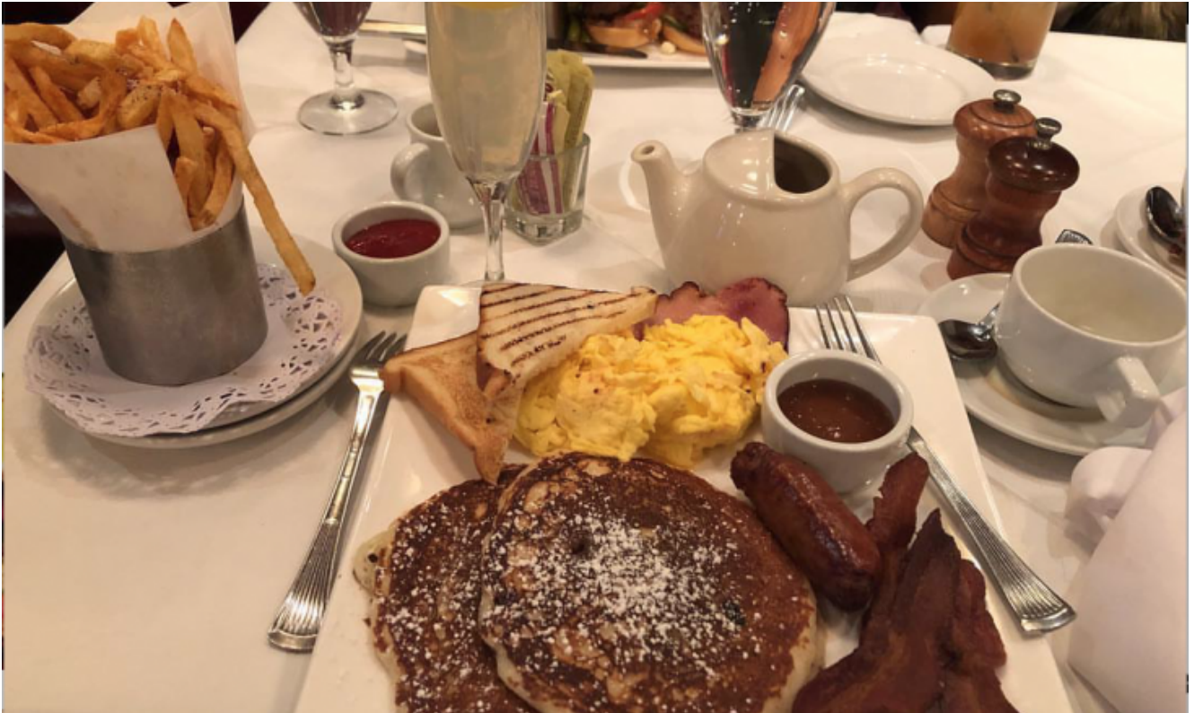
Rue 57 NYC Brunch.

Rue 57 in New York City is great for brunch, lunch, and dinner. Essentially, if you're in NYC and looking for a great atmosphere with stellar service and amazing food, look no further than Rue 57. You can find them on their website https://rue57.com/ , or through social media on Facebook and Instagram .