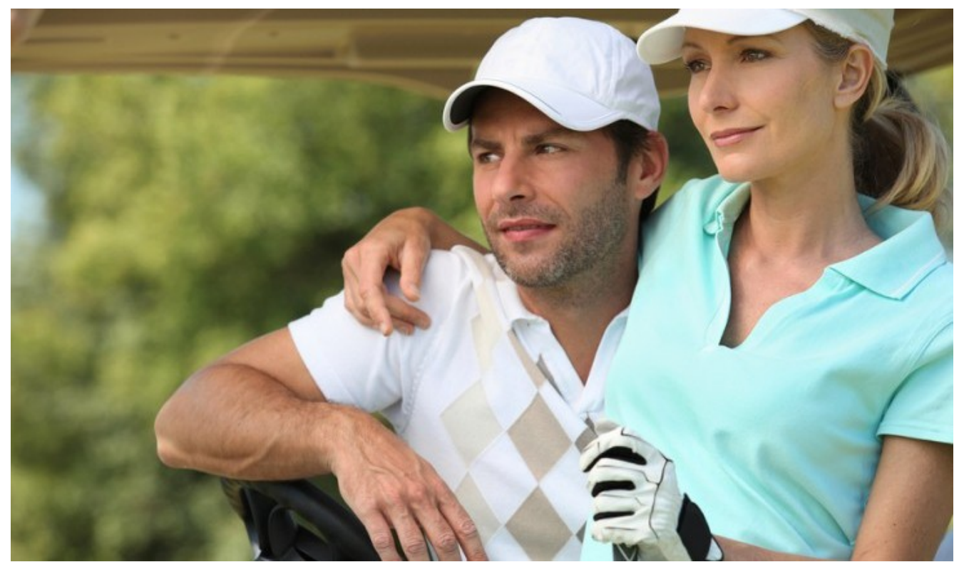
By <u>Melissa Lee</u>

Remember Sesame Street, Winnie the Pooh and Bugs Bunny? They were probably your favorite cartoons when you were younger, and still are today. But now that you're older and too busy, you might not have the time to watch them.