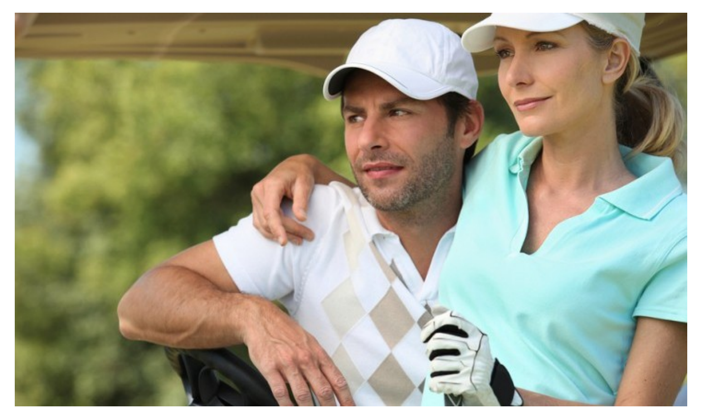
By Delaney Gilbride

There aren't going to be many more days of nice weather for lovers this year. The days are growing shorter and colder, but it's not too late to take advantage of a fine fall day for one last date.