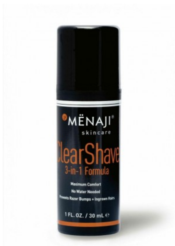
Mēnaji Clear Shave 3-in-1 Formula.

For 20% off of anything at LoveYourBling, use the coupon code: CP2014 . Happy shopping!