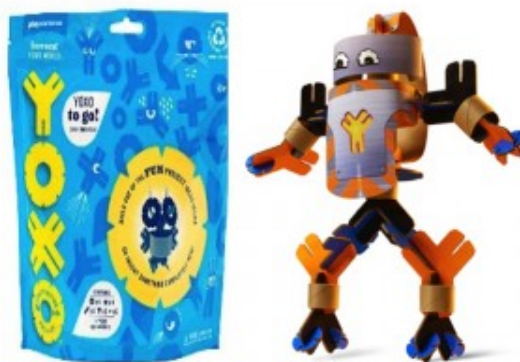
Play From Scratch, LLC: YOXO To Go and YOXObot Orig.

Their Clear Shave 3-in-1 Formula will let him shave anywhere, anytime, even without a sink. This product uses a revolutionary unique “dry shave” experience that allows him to get rid of his scruff in one simple step. The CAMO Stick Concealer helps to reduce dark circles and hide scars, bumps, and blemishes. With the holiday season here and so much traveling going on, they have a product to beat those jet-lagged eyes too. The 911 Eye Gel is perfect for any man struggling to look good during this busy time of year. These affordable products are sure to make that guy in your life feel like he can conquer the world!