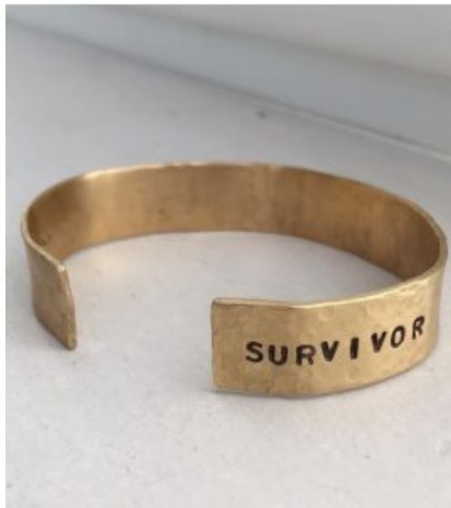
Isabelle Grace Jewelry.

With a great mission behind the company, each design supports breast cancer awareness and making women feel beautiful and strong. Isabella Grace bracelets are all about being unique and elegant, with a timeless and effortless look. Made by hand in the USA from recycled materials whenever possible. The bracelets are a symbol of the importance of living with hope and strength. With a sizable celebrity following, such as Katherine Heigl, Courtney Lopez, Alyson Hannigan, and Christina Milian, these bracelets are gorgeous for any woman to wear.