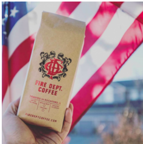
Fire Department Coffee.

Fire Department Coffee is coffee with an admirable mission and that's tasty for the consumer. Coming in a variety of blends and flavors, their original medium roast is one of the easiest drinking coffees you will ever have. If you like something bolder, their dark roast is made from organic beans and comes from fair trade farms. Their newest flavor: Bourbon-infused. It has the smoothness of Bourbon totally guilt-free. A portion of all sales are donated to military and fire-related charities. Military and first-responders receive 15% off their first order.