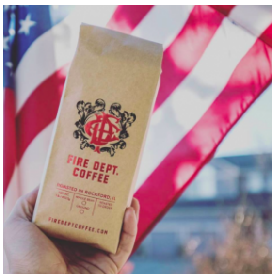
Fire Department Coffee.

Fire Department Coffee is coffee with an admirable mission and that's tasty for the consumer. Coming in a variety of blends and flavors, their original medium roast is one of the easiest drinking coffees you will ever have. If you like something bolder, their dark roast is made from organic beans and comes from fair trade farms. Their newest flavor: Bourbon-infused. It has the smoothness of Bourbon totally guilt-free. A portion of all sales are donated to military and fire-related charities. Military and first-responders receive 15% off their first order.