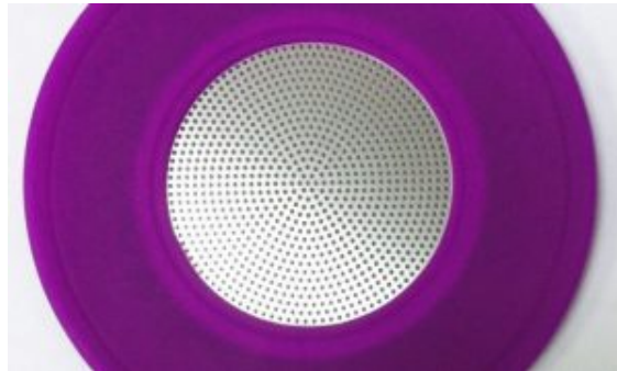
Drink Tops.

Drink tops are the best parenting tip we have for you! Avoid a crying toddler who spilled their drink, bugs getting into sweet-smelling juices, or the frustration of mixing up cups with these cute, friendly faced cup lids that come in fun colors! BPA-free silicone helps your mind rest easy that what you're giving your kid is not only good for your anxiety levels, but good for their health, too. With a single tap on the lid, Drink Tops will seal onto any glass up to four inches wide. They keep drinks cooler longer, are reusable, durable, and dishwasher safe.