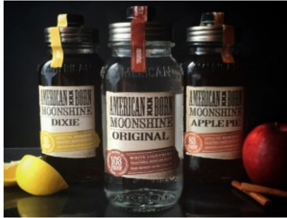
American Born Moonshine: Dixie, Original, and Apple Pie flavors.

American Born Moonshine: We know shopping for that special guy in your life can be nearly impossible. But fear no more, we have a gift that he's sure to love! After all, what man doesn't enjoy some good old-fashioned moonshine? Lucky for you, American Born Moonshine has released an Apple Pie flavor that is perfect for the holiday season. Even if American Born Moonshine isn't available in your state quite yet, you can still order it by printing a form found on their website and taking it to your local liquor dealer.