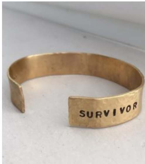
Isabelle Grace Jewelry.