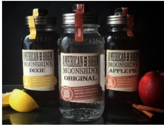
American Born Moonshine: Dixie, Original, and Apple Pie flavors.

American Born Moonshine: We know shopping for that special guy in your life can be nearly impossible. But fear no more, we have a gift that he's sure to love! After all, what man doesn't enjoy some good old-fashioned moonshine? Lucky for you, American Born Moonshine has released an Apple Pie flavor that is perfect for the holiday season. Even if American Born Moonshine isn't available in your state quite yet, you can still order it by printing a form found on their website and taking it to your local liquor dealer.