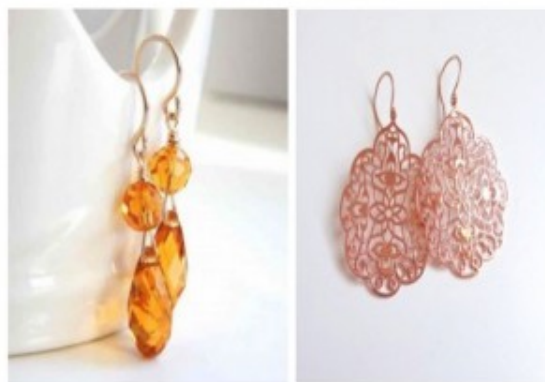
LoveYourBling: Topaz Teardrop Briolette earrings and Filigree Dangle earrings in rose gold.

LoveBook Online: This unique, personalized gift is sure to please that special someone (or someones!) in your life. LoveBook Online is a website that lets you create a custom gift book that lists all of the reasons you love someone. They even print it, bind it, and ship it for you! Not only is this sweet book sincere and heartfelt, but it's also super easy to make. There are a ton of fun pages with cute quotes like "I love cooking with you" or "I love going on adventures together." They also have humorous stick-figure pictures to go with each phrase. You can include an unlimited number of pages in your hardcover or softcover book. This unique gift idea starts at just $34.95 and lasts a lifetime. Any hopeless romantic is sure to fall in love with this precious idea!