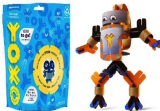
Play From Scratch, LLC: YOXO To Go and YOXObot Orig.

Their Clear Shave 3-in-1 Formula will let him shave anywhere, anytime, even without a sink. This product uses a revolutionary unique “dry shave” experience that allows him to get rid of his scruff in one simple step. The CAMO Stick Concealer helps to reduce dark circles and hide scars, bumps, and blemishes. With the holiday season here and so much traveling going on, they have a product to beat those jet-lagged eyes too. The 911 Eye Gel is perfect for any man struggling to look good during this busy time of year. These affordable products are sure to make that guy in your life feel like he can conquer the world!