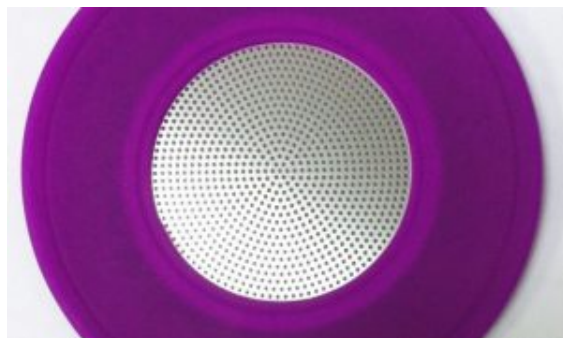
Drink Tops.

Drink tops are the best parenting tip we have for you! Avoid a crying toddler who spilled their drink, bugs getting into sweet-smelling juices, or the frustration of mixing up cups with these cute, friendly faced cup lids that come in fun colors! BPA-free silicone helps your mind rest easy that what you're giving your kid is not only good for your anxiety levels, but good for their health, too. With a single tap on the lid, Drink Tops will seal onto any glass up to four inches wide. They keep drinks cooler longer, are reusable, durable, and dishwasher safe.