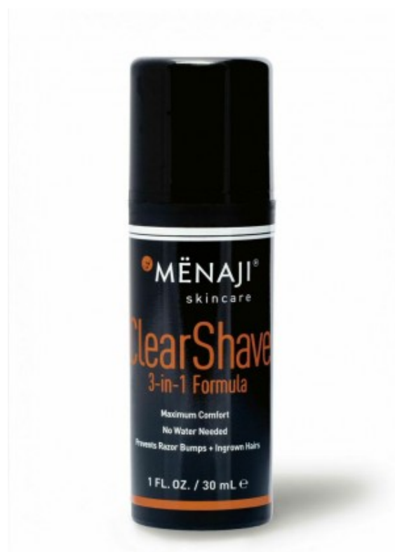
Mēnaji Clear Shave 3-in-1 Formula.

For 20% off of anything at LoveYourBling, use the coupon code: CP2014 . Happy shopping!