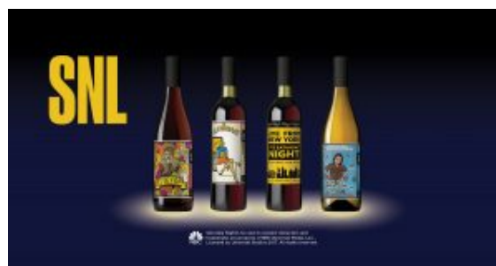
SNL Wine.