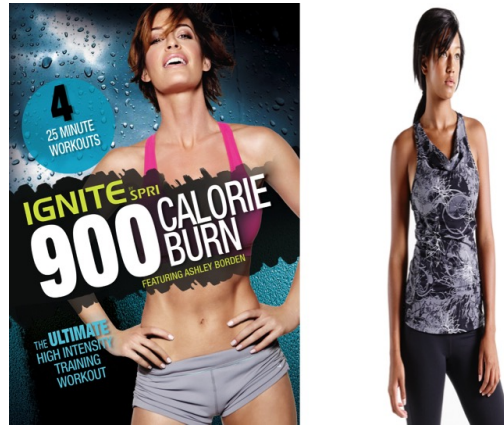
900 Calorie Burn DVD and the Petal Back Racer Tank from Gaiam.

Gaiam: Just in time for chilly days, Gaiam has released their latest DVDs and apparel line. With the hustle and bustle of the holiday season, it's often hard to fit in a workout. Thanks to the 900 Calorie Burn DVD with Ashley Borden, exercising each day just got so much easier. With four 25-minute routines, there's no excuse not to break a sweat! If you're looking for new workout gear, Gaiam's clothes are not only comfortable but lightweight and warm too. Their apparel is breathable and quick-drying with the softest fabric possible, making these items perfect for your winter workout. The Curve Leggings hug your curves and follow every movement of your body – an ideal choice for your daily yoga session. The Petal Back Racer Tank is flattering and has also been designed to stay in place with every bend and stretch. Even better, both of these items are reasonably priced for under $100.