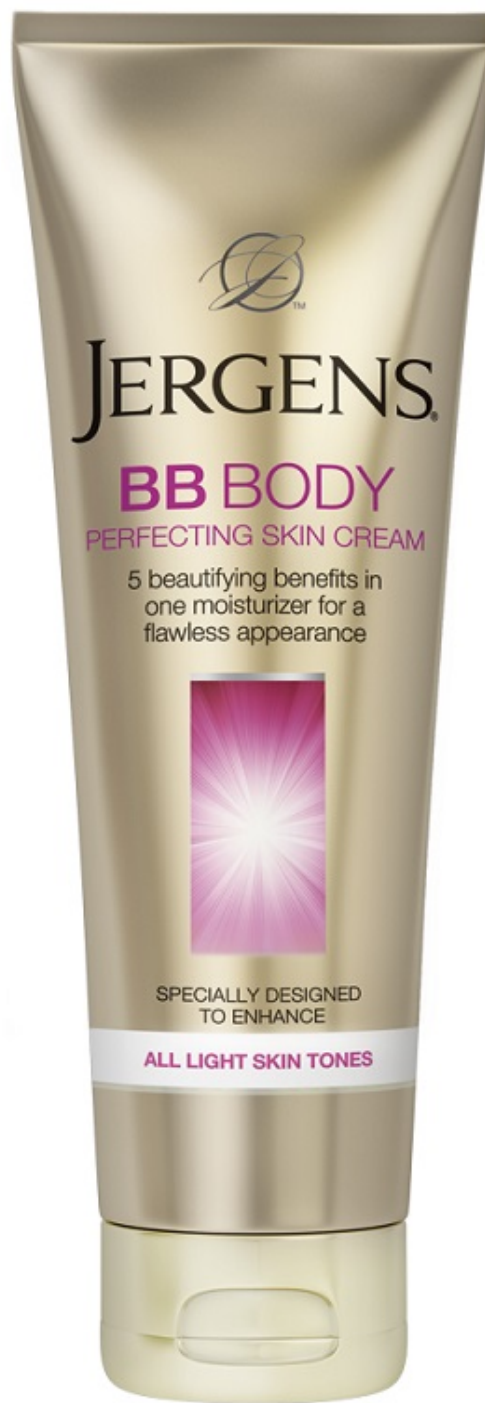
Jergens® BB Body Perfecting Skin Cream

Jergens® BB Body Perfecting Skin Cream will not only hydrate and illuminate your skin as soon as you put it on, but it will firm, even, and correct it after only five days of use. Plus, it dries quickly, so there's no need to adjust your usual morning routine to avoid staining your clothes. Better yet, this BB cream goes on sheer and adjusts to your skin tone, so you won't look like you just tried to rub pudding on