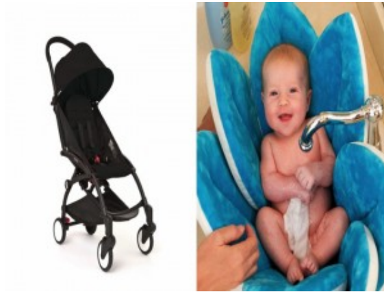
Pish Posh Baby: BabyZen YoYo Stroller and the Blooming Baby Bath.

Pish Posh Baby: If you're looking for something for new parents, Pish Posh Baby is your one-stop-shop for revolutionary baby and kid products. They offer items like the BabyZen YoYo stroller, which is incredibly compact, lightweight, and versatile. This fashionable stroller, which comes in a variety of color combinations, is perfect for everyday use and holiday traveling. Both new parents and their little ones won't be able to resist this holiday gift!