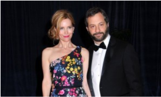
Leslie Mann and Judd Apatow.

5. Watch Oprah together: The funny duo Leslie Mann and Judd Apatow have worked together on many romantic comedies together and have been married for 20 years! The director shared with Vice.com that they both watch Oprah's SuperSoul Sunday and then apply lessons from the show to their marriage each week. Television shows that give you relationship advice can be helpful for you and your partner!