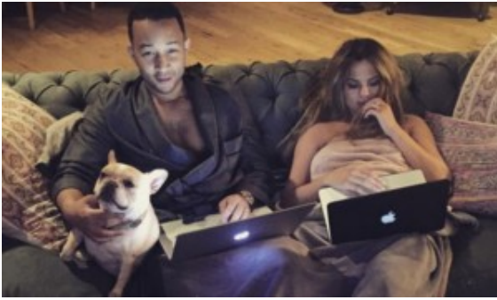
John Legend and Chrissy Teigen.

Related Link: Celebrity Couple: 10 Reasons Chrissy Teigen and John Legend are Relationship Goals