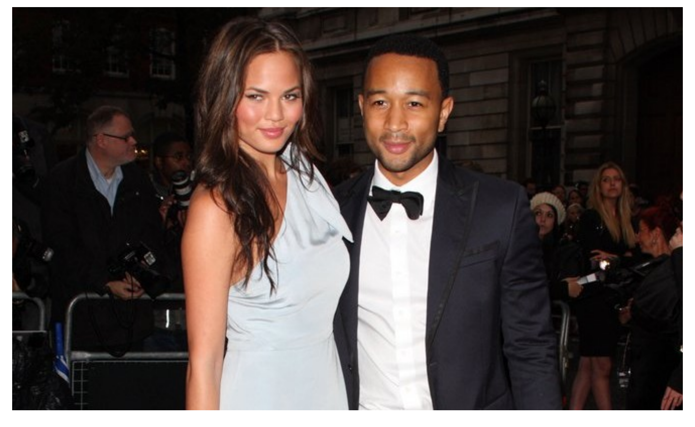
Page 1 of 20