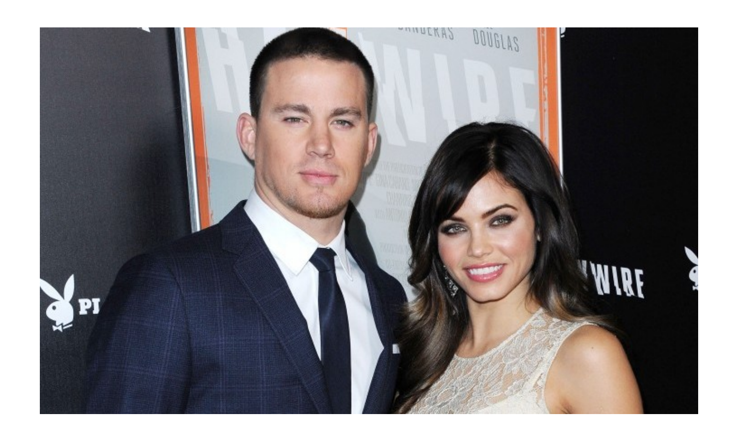
Page 1 of 10