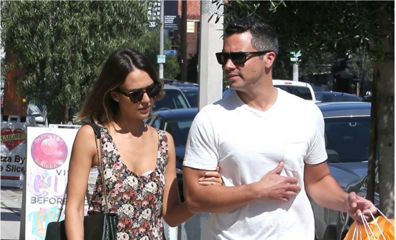
Jessica Alba and Cash Warren