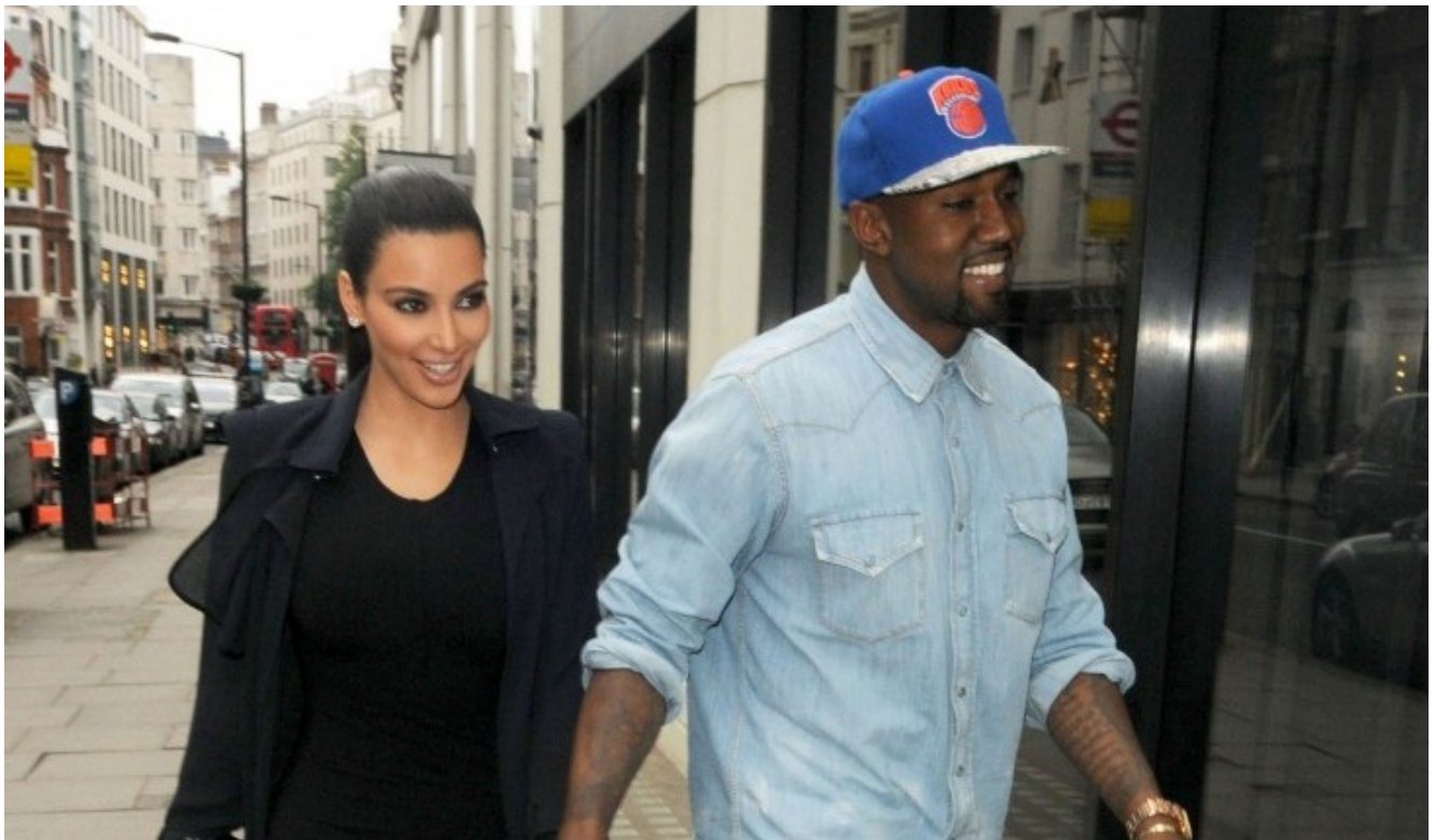
Kim Kardashian West and Kanye West