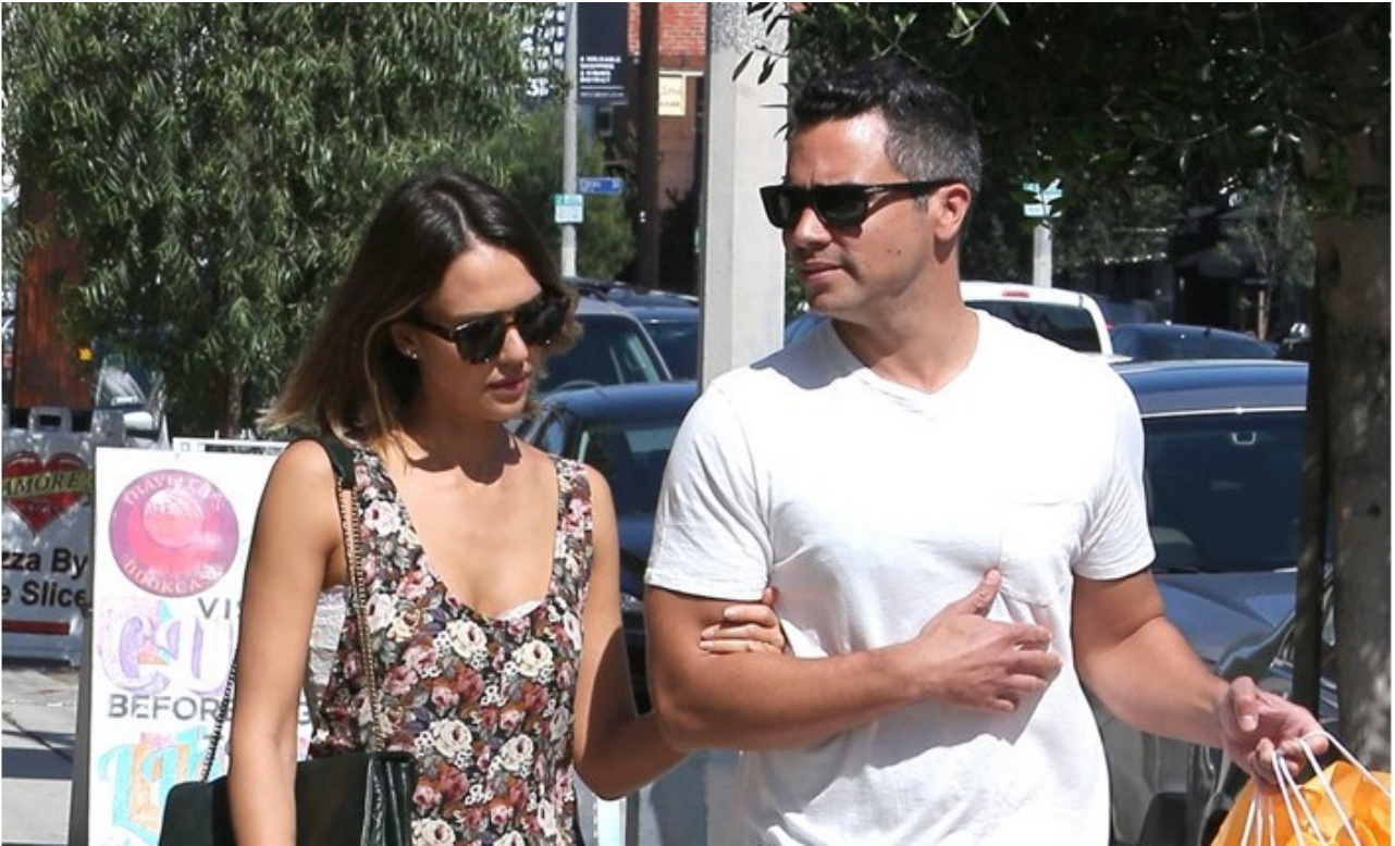
Jessica Alba and Cash Warren