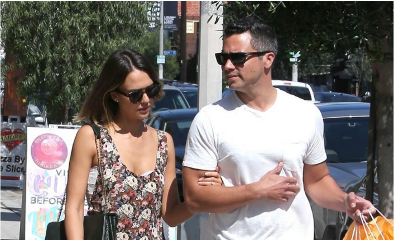
Jessica Alba and Cash Warren