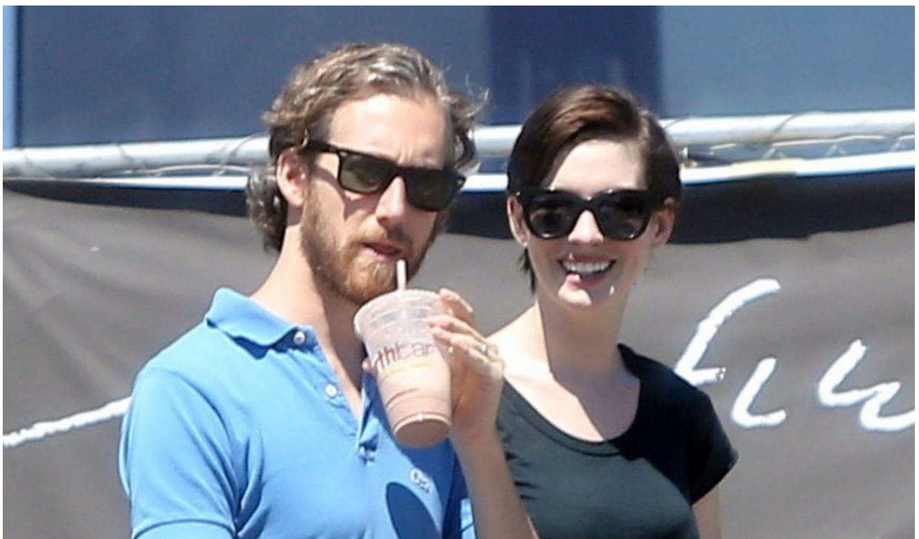
Adam Shulman and Anne Hathaway

This famous couple enjoyed a nice summer getaway in sunny Spain! The pair spent time on a yacht, soaking up the sun and playing in the water together.