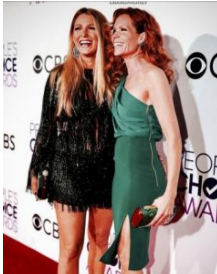
Blake and Robyn Lively.

Blake Lively flashes a winning smile and sparkles in her little black tasseled dress as she and her sister, Robyn Lively, enjoy a fun girl's night out on the red carpet. With her strappy heels and big statement earrings, this look comes off as a great combination of classic and au courant .