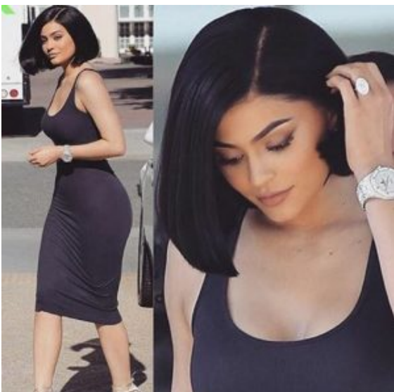
Kylie Jenner wears mauve eyeshadow.

4. An Exceptional Eyeshadow: Reality star Kylie Jenner steps out in a simple black summer dress and some gorgeously subtle mauve eyeshadow that perfectly compliments her golden summer-ready skin. While Kylie keeps it casual and relaxed in these photos, her sweet smile shows she knows how runway-ready her choice of eyeshadow makes her look.