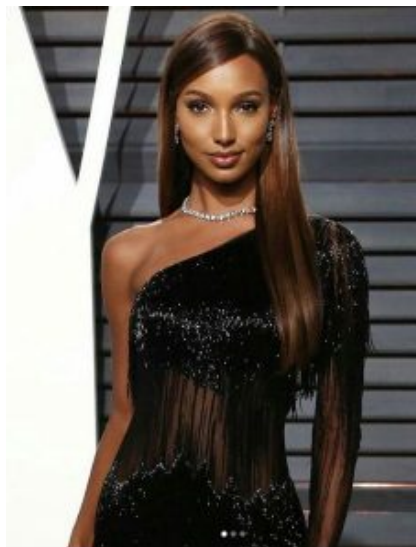
Jasmine Tookes.

Victoria Secret model Jasmine Tookes poses at the Vanity Fair