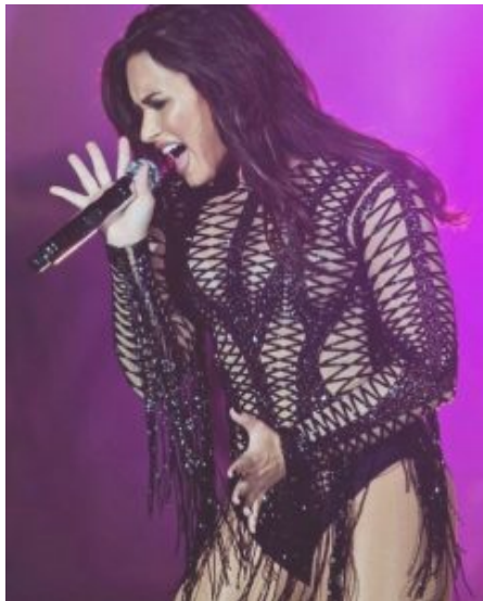
Demi Lovato.

Demi Lovato belts one of her hit songs in Dubai during her recent concert tour while wearing her own interpretation of this celebrity look, a black and beige fringed leotard. The crisscrossed pattern and sparkly black tassels make this a one piece that's definitely worth a second look.