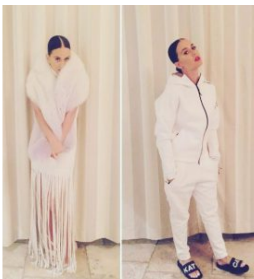
Kate Perry.

While Katy Perry keeps it cool and casual on the right side of this photo, on the left she moves from comfortable to killing it in an instant. While her simple white dress and fur wrap make her look like an innocent starlet from days gone by, the long tassels on the bottom of her skirt hint that a party girl just might be hiding behind that shy expression on her face.