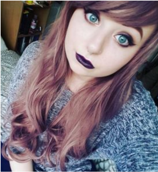
Mauve hair.

Related Link: Beauty Tips: 5 Hair Trends for 2017