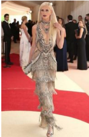
Poppy Delevingne.

Poppy Delevingne stuns in this iridescent dress that takes tassels to a whole new level. With its gorgeous silver sheen, layers of fringe, and sparkling jewel accents, this is definitely a dress to turn heads, and if her confident strut in this picture is any indication, she seems she knows it, too!