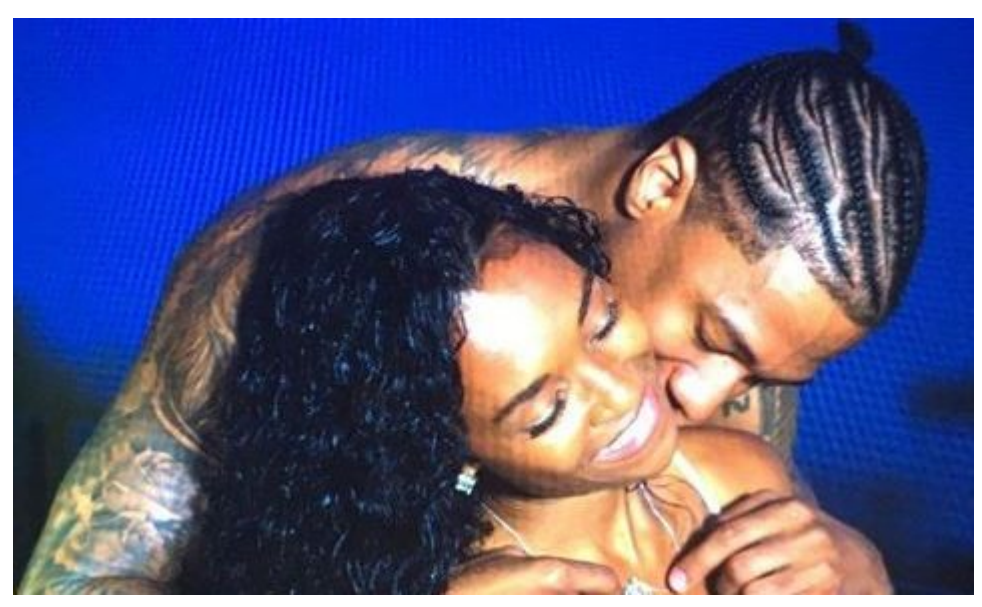
By <u>Nicole Caico</u>