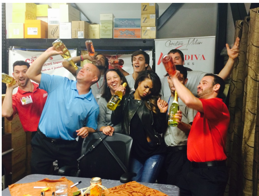
Christina Milian celebrating with Viva Diva Wines.

The talented entrepreneur is particularly proud of her new line of wines. “A Viva Diva is a confident woman who loves to live the life,” she says of the ladies who enjoy her wine. “I think we sometimes take things too seriously. Sometimes, you need to shout, dance, and scream out loud! You can be serious all day, or be a confident woman and just go have fun.”