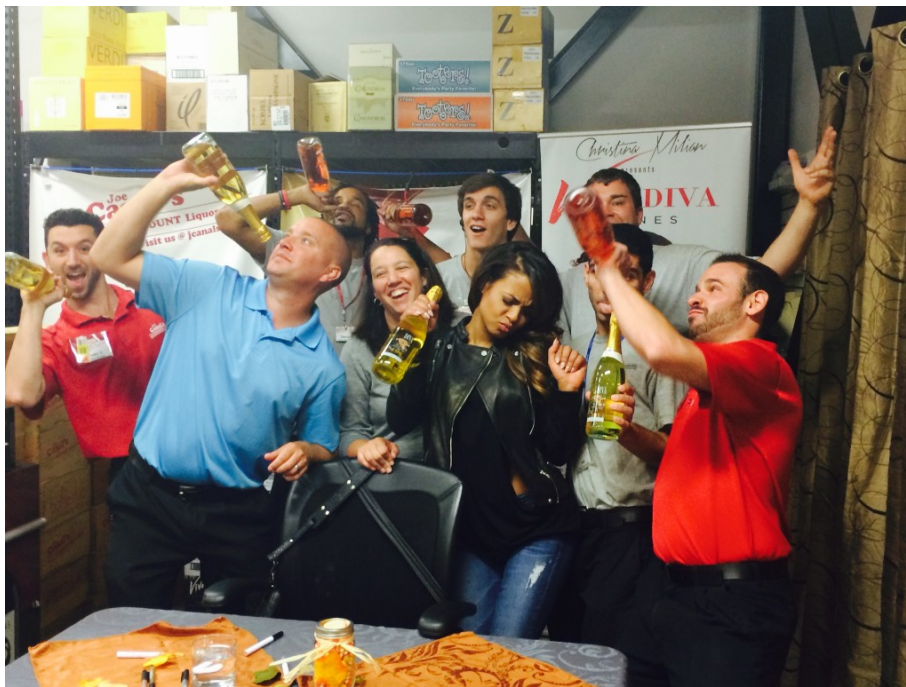
Christina Milian celebrating with Viva Diva Wines.

The talented entrepreneur is particularly proud of her new line of wines. “A Viva Diva is a confident woman who loves to live the life,” she says of the ladies who enjoy her wine. “I think we sometimes take things too seriously. Sometimes, you need to shout, dance, and scream out loud! You can be serious all day, or be a confident woman and just go have fun.”