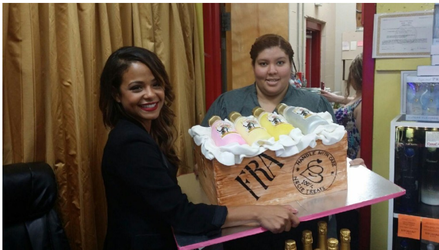
Christina Milian with Viva Diva Wines.

Longtime fans are excited to get a better glimpse at her day-to-day life with her new reality TV show, set to premiere in 2015. When asked if viewers are going to be able to get a peek at her love life, she confesses, “Right now, I’m just really focused on my music. I think that’s the focus of everything. And when a relationship and love come along, it will strike, and we will see if the cameras are there!” She also hinted that she would love to have Nicki Minaj and Drake on her upcoming album, which she describes as “a little mix of fun club bangers, a couple of ballads, R&B, and pop” in our celebrity interview.