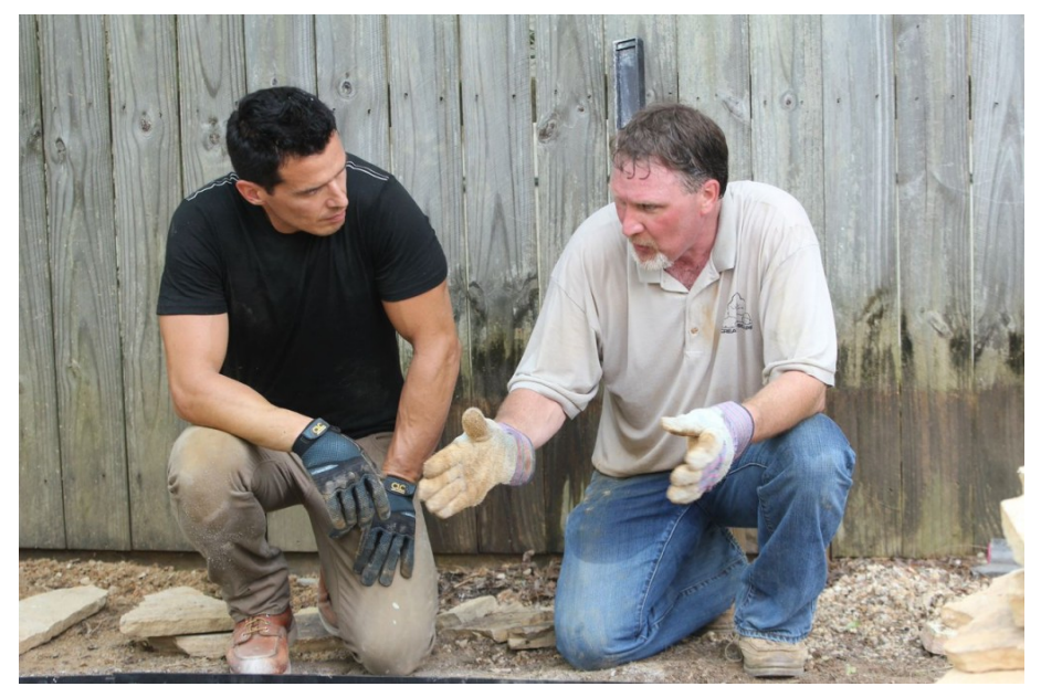
Antonio Sabato Jr. filming for 'Fix It or Finish It.'