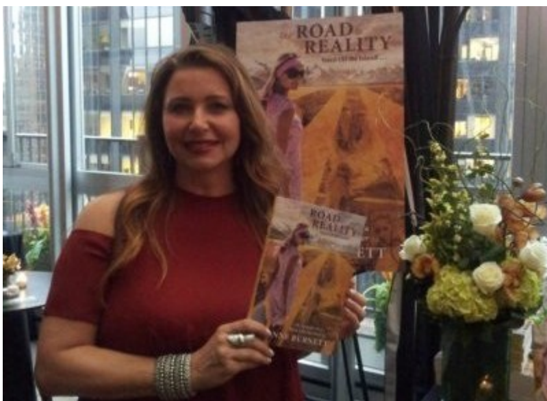
New York's Fashion Week