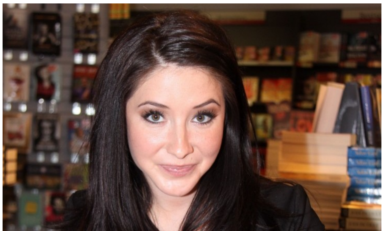
By Maggie Manfredi

Whether you are a first-time reader or a frequent peruser of us here at Cupid's Pulse, we want to wish you a holiday season full of joy, peace, and, of course, love! What better way to celebrate than by looking back at some of our favorite celebrity couples who got engaged over the holidays? Check it