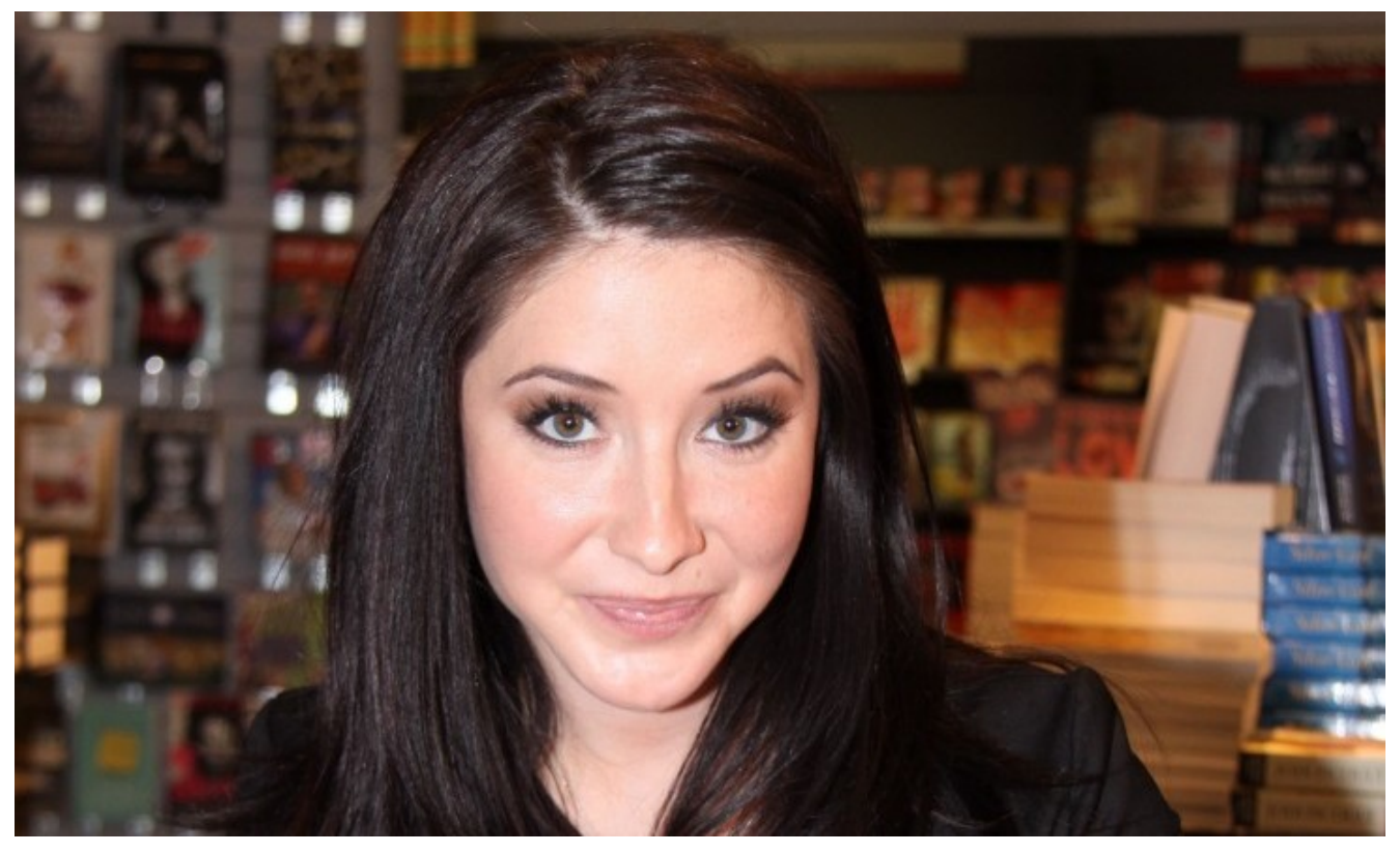
By Louisa Gonzales