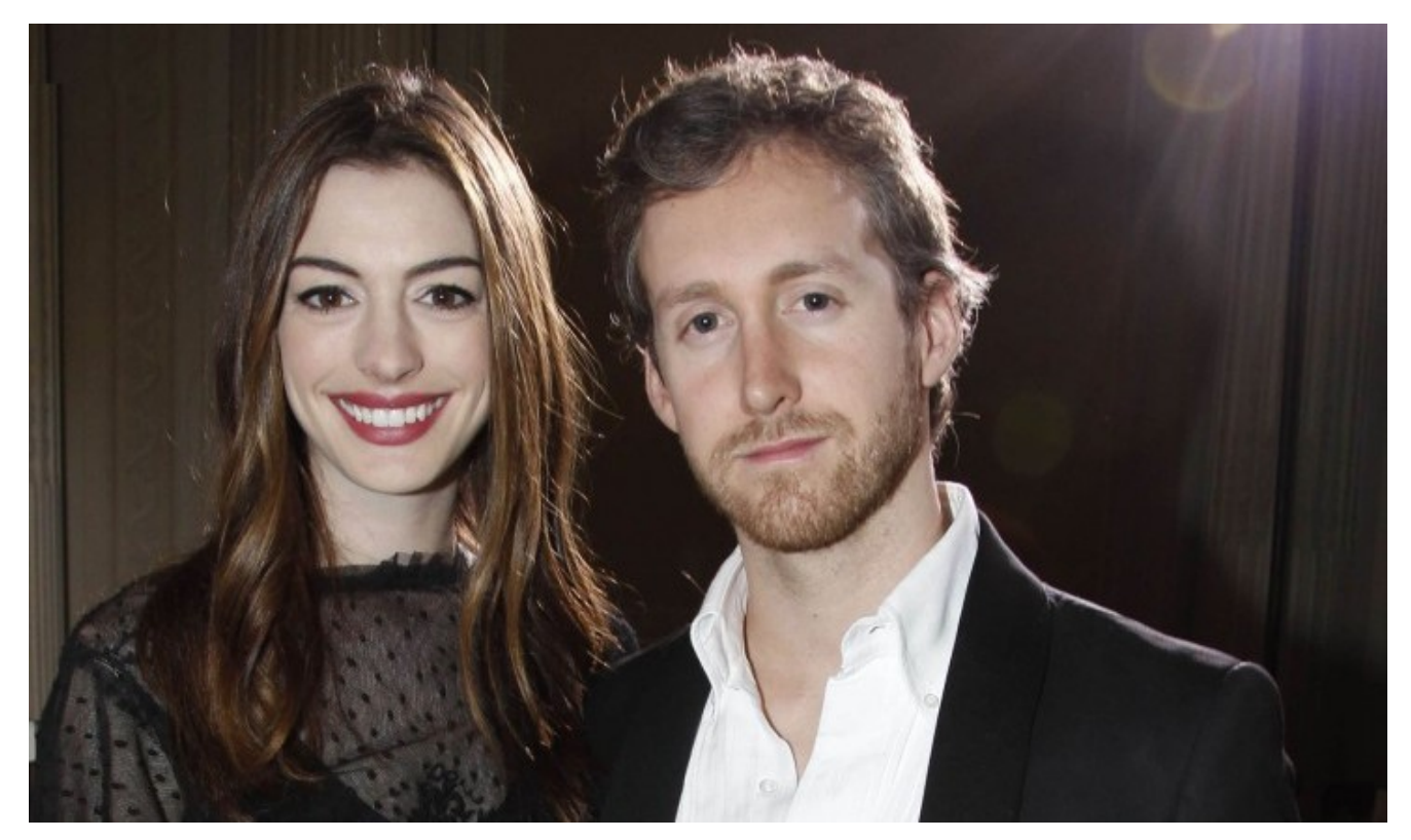
This post is sponsored by Platinum Guild International USA.