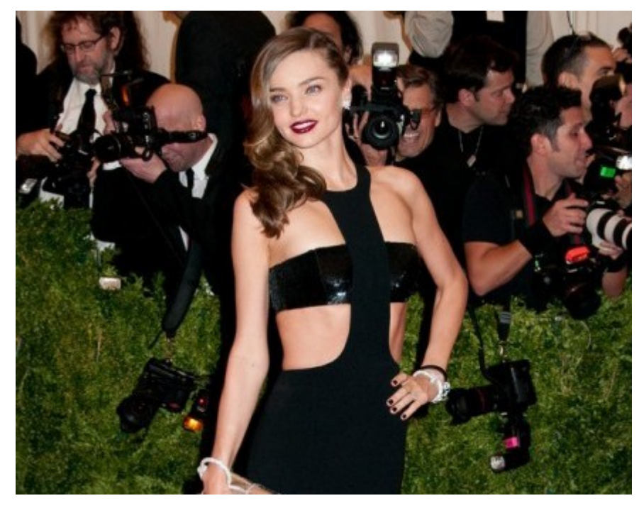
By April Littleton

Many celebrities are known for their numerous, infamous marriages to other stars who are in the spotlight. Cupid has come up with a list of the top five celebrities who've had the most marriages. Check it out here: