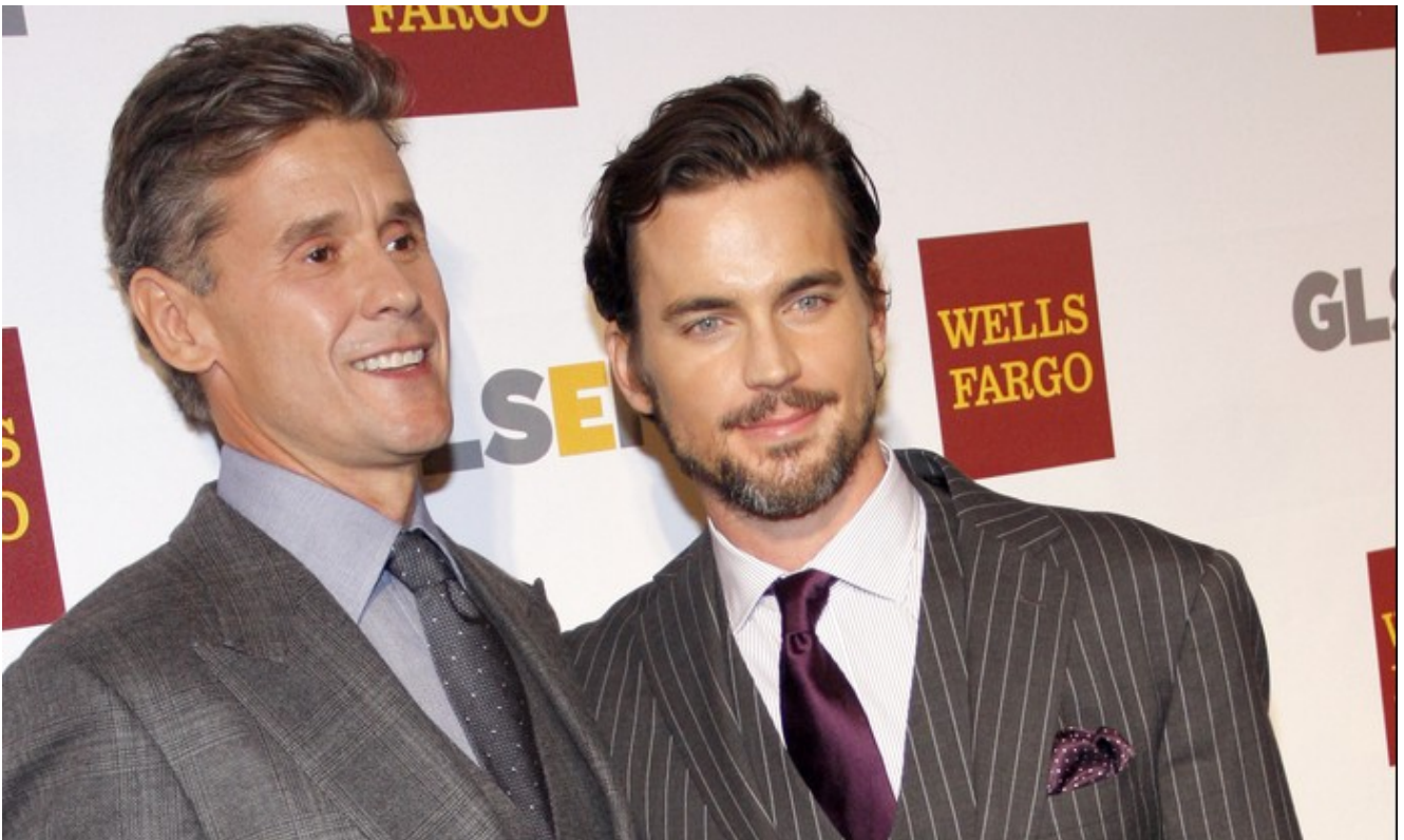
Simon Baker and Matt Bomer

The 'Magic Mike' star married Baker in 2011, a year before the