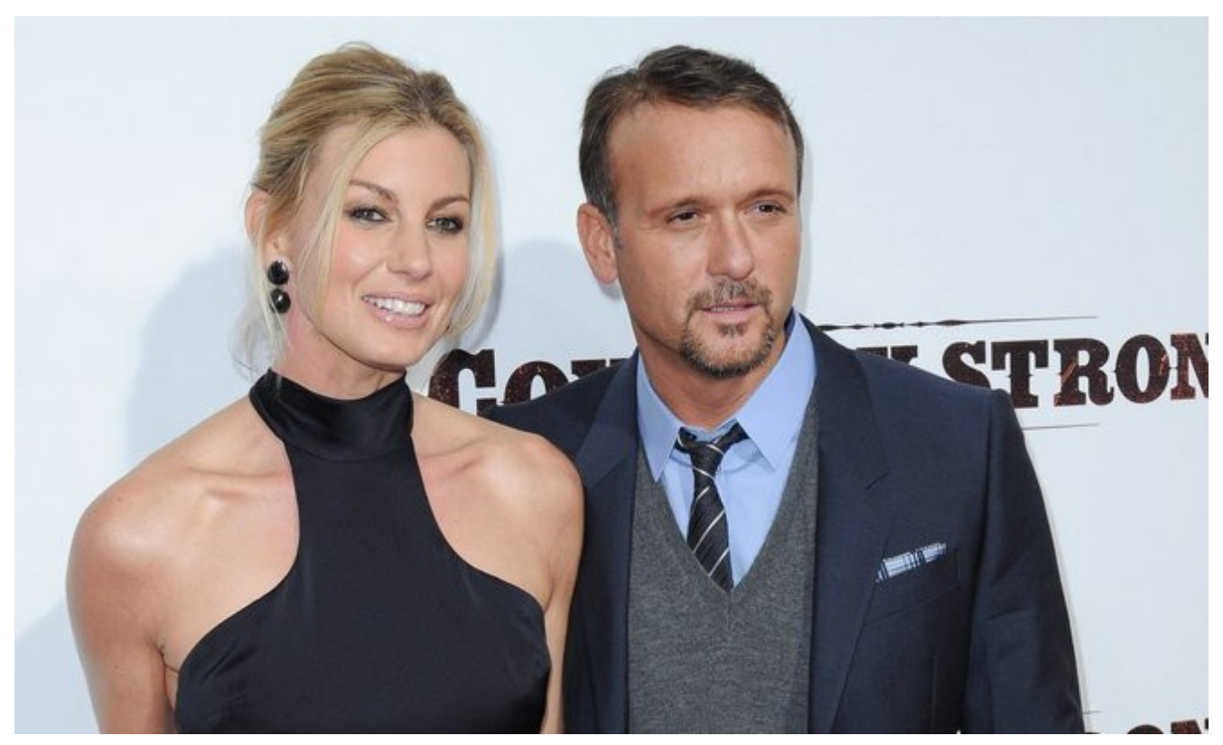
By Kelly Seal

When someone leaves us broken-hearted, our natural reaction is to find love again as quickly as possible. Unfortunately, healing a broken heart takes time and patience. It's necessary to spend some time alone so you can build your own strength and move on to a happier, healthier relationship in the future.