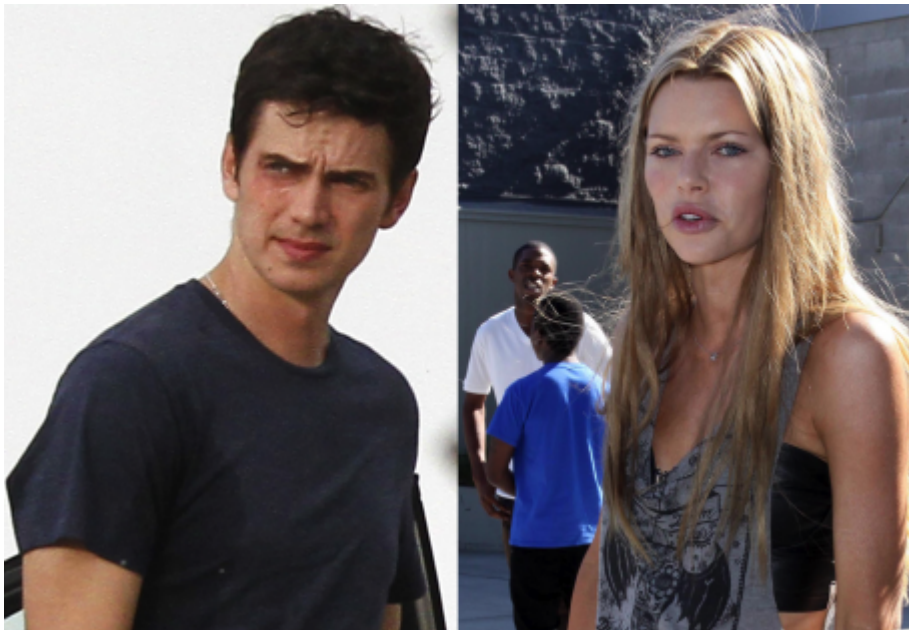
Bristol Palin and