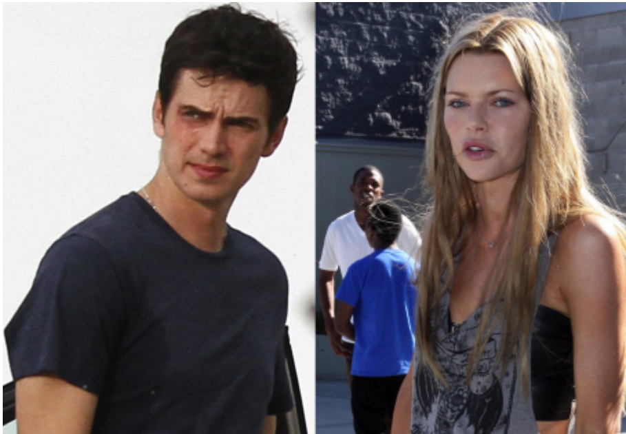
Actor Zac Efron

spent a guy's night out at a local strip club in New York City, People reported last week. The High School Musical star told Jimmy Kimmel that the experience didn't live up to his expectations. "So I envisioned myself on a nice couch, stunna shades, with like T-Pain and Usher, you know, making it rain money," he said on the show. "And it just wasn't like that." But don't worry: before heading out, the 22-year-old called girlfriend Vanessa Hudgens to ask for permission.