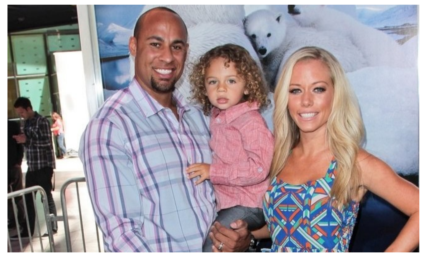
By Kerri Sheehan

Snow falls in thick, icy blankets; winter attire adorns every shop window; and a sip of steaming hot chocolate instantly warms you up. All of this can only mean one thing: The holiday season is upon us! CupidsPulse.com has gathered some of our favorite articles from our partners this week to make your winter the best it can be.