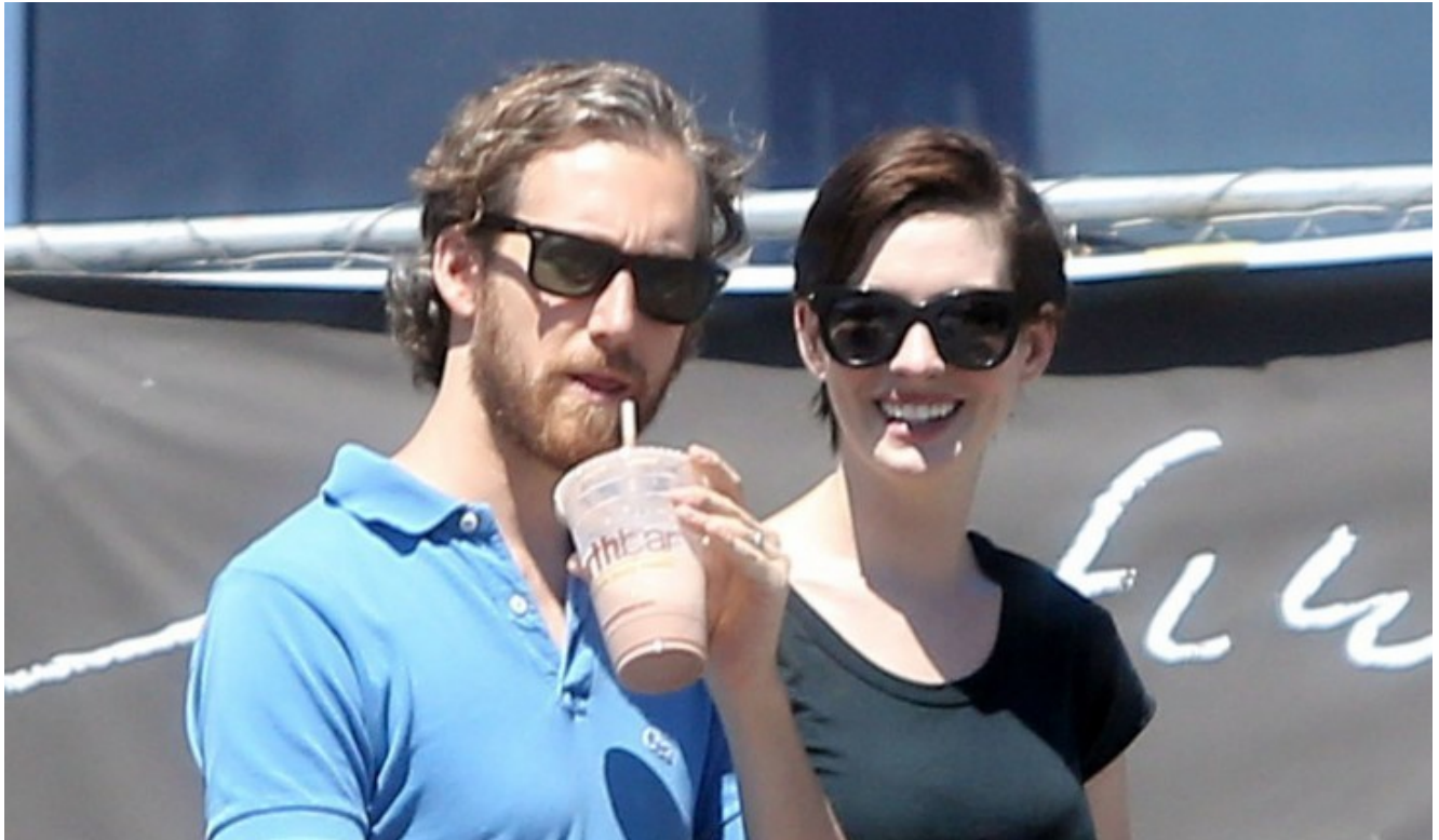
Adam Shulman and Anne Hathaway

This famous couple enjoyed a nice summer getaway in sunny Spain! The pair spent time on a yacht, soaking up the sun and playing in the water together.