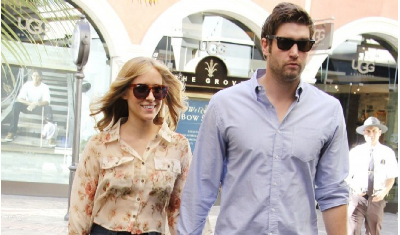
Kristin Cavallari and Jay Cutler

In 2014, the Bears quarterback signed a seven-year contract that guarantees him 50 million dollars. Given his wife's many projects, including a popular line of shoes with Chinese Laundry and an upcoming book, it's easy to see why this celebrity couple made our list!