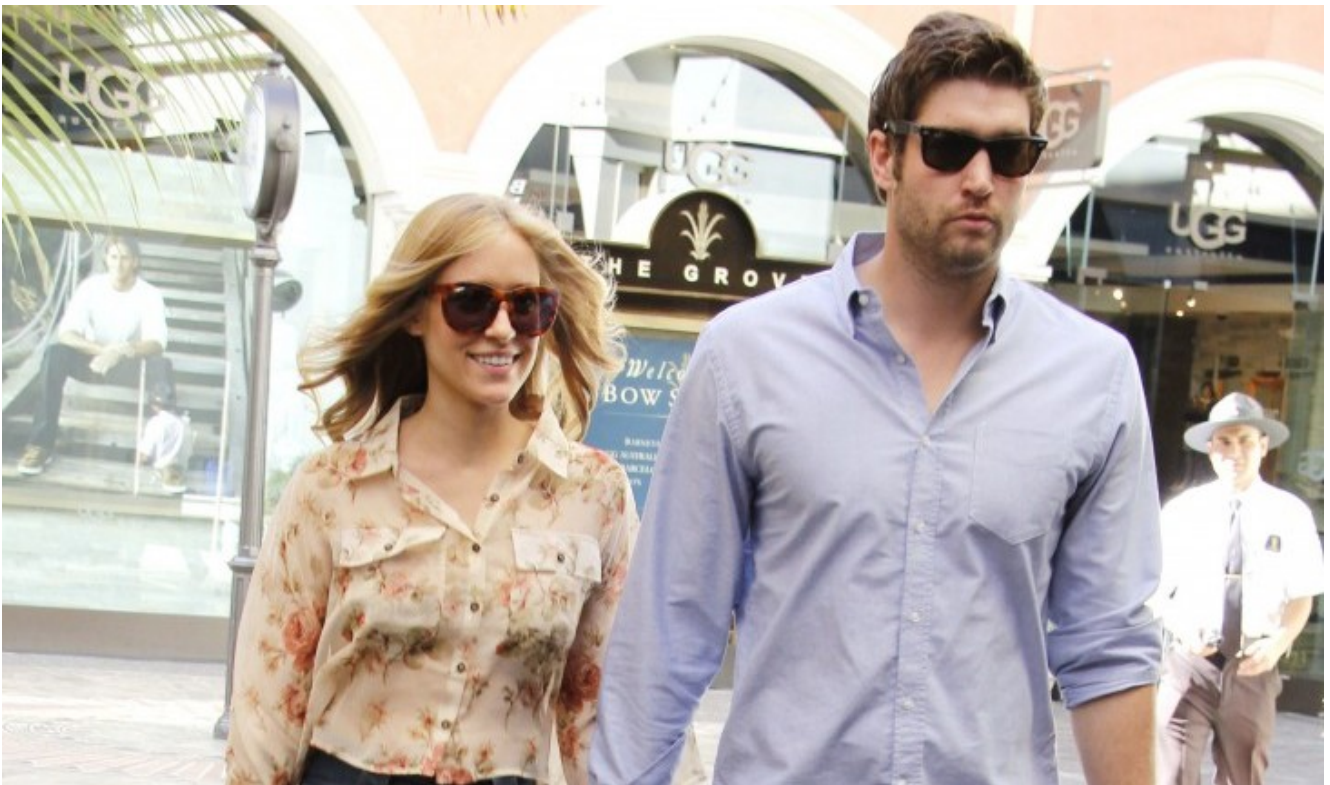
Kristin Cavallari and Jay Cutler

In 2014, the Bears quarterback signed a seven-year contract that guarantees him 50 million dollars. Given his wife's many projects, including a popular line of shoes with Chinese Laundry and an upcoming book, it's easy to see why this celebrity couple made our list!