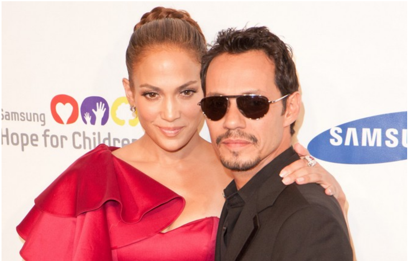
Jennifer Lopez and Marc Anthony

Although they're no longer together, the two singers co-parent and do business together. These celebrity exes didn't let their break-up get in the way of their children or career.