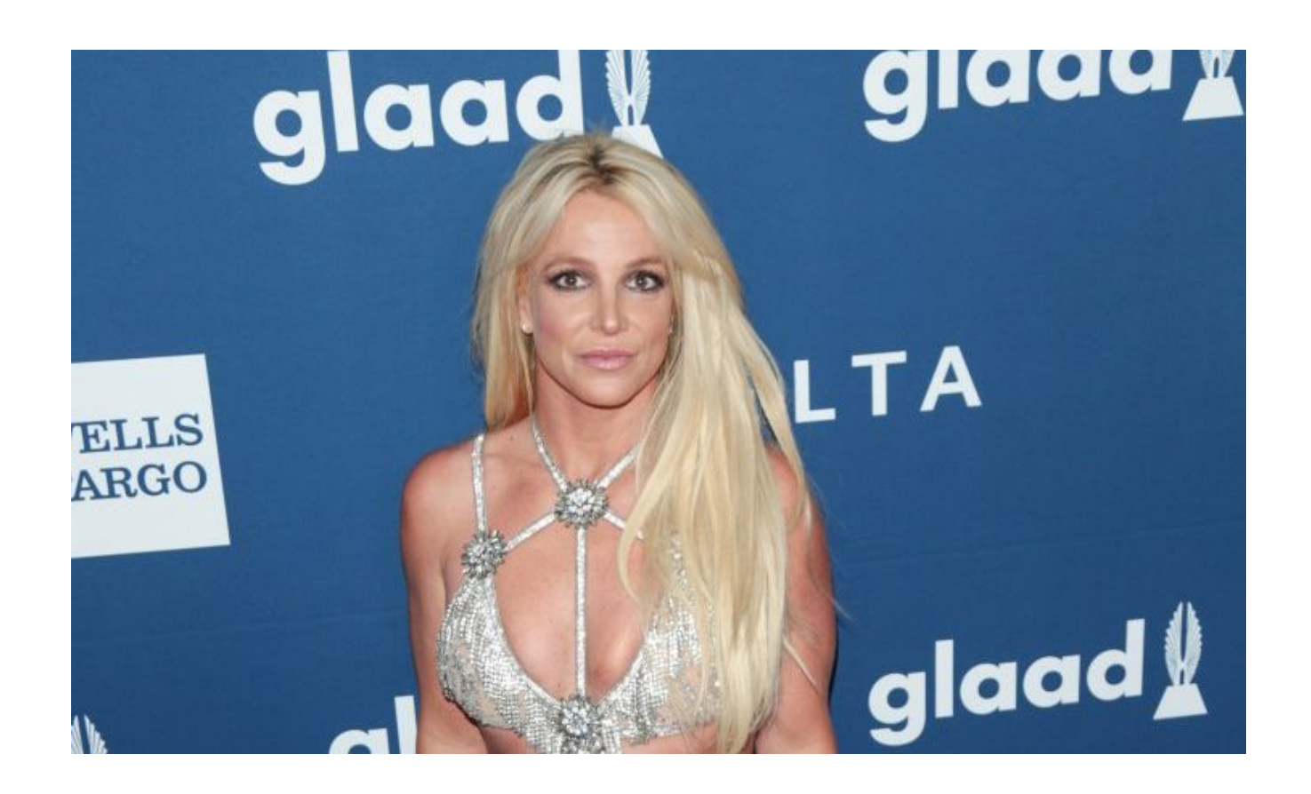
Page 1 of 19