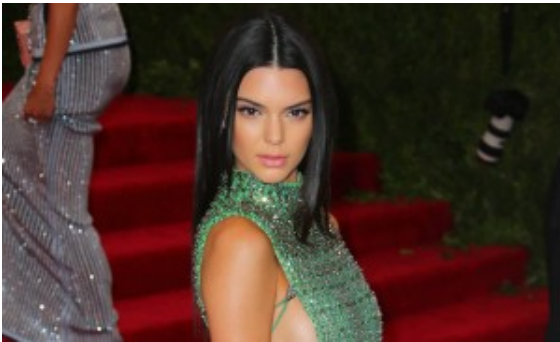
Kendall Jenner.

Related Link: New Celebrity Couple: Kendall Jenner & Harry Styles Reunite at Party