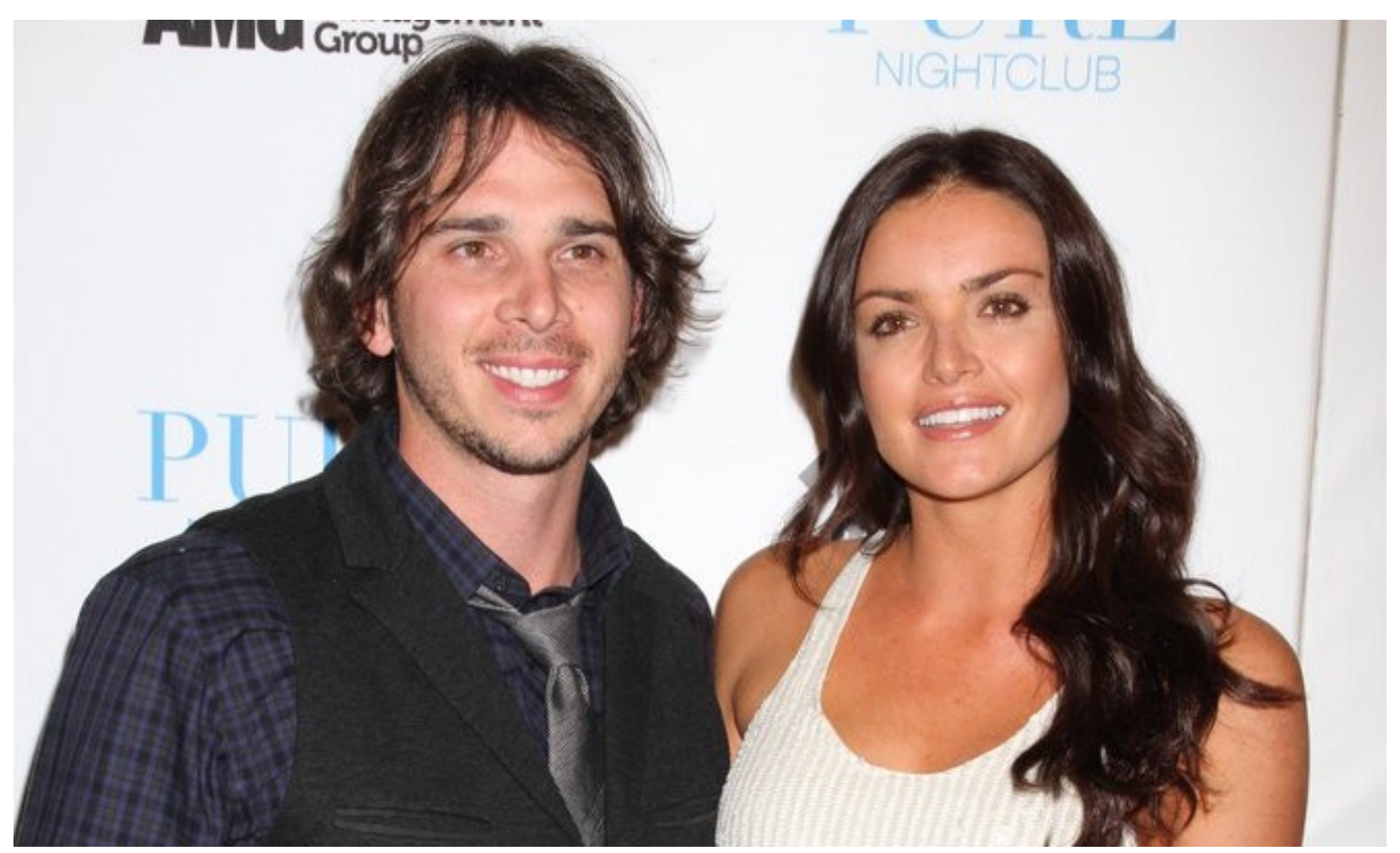
By Nic Baird