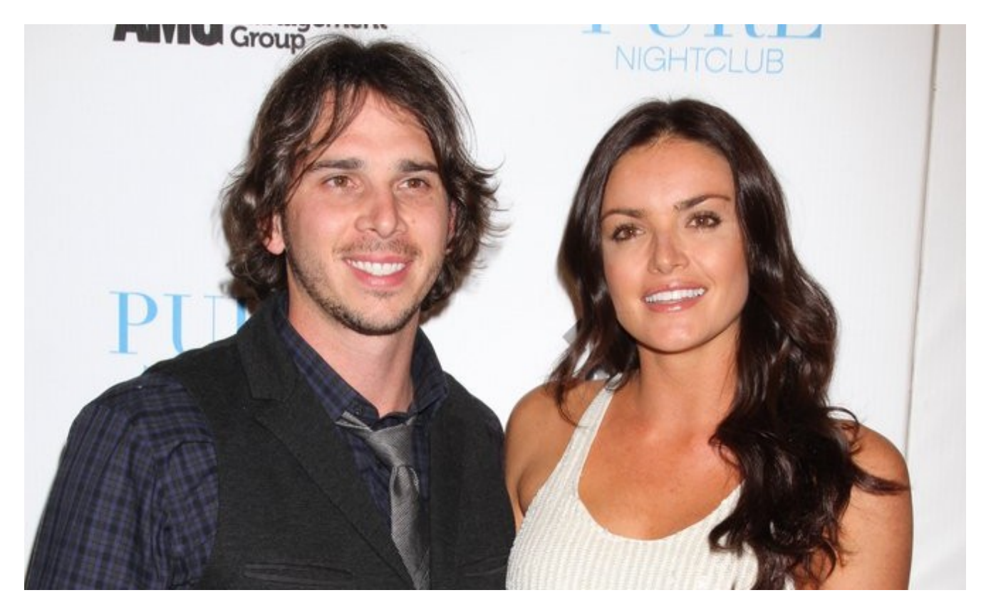
By Lori May

Benjamin Flajnik, also known as "Bachelor Ben," is the latest contestant on The Bachelor to go looking for love. With the season drawing closer to the final episode and live special, more and more fans of the series are perplexed by who Benjamin Flajnik is—and what is he really looking for in a Lady Love?