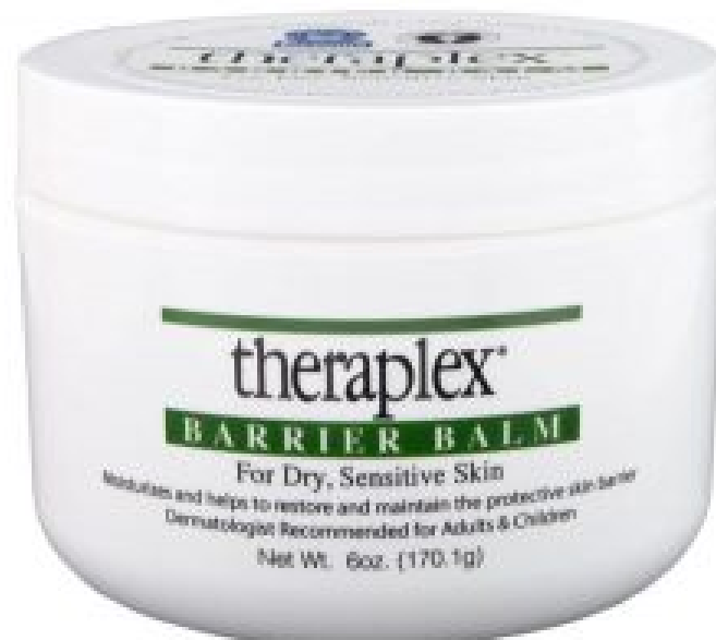
Theraplex Barrier Balm

Theraplex® isn't just for those with overly dry skin. It is for anyone looking for a gentle formula to apply to their skin when trying to keep it hydrated and moisturized, which is so important during summer. These products are guaranteed to leave you glowing on your next date night !