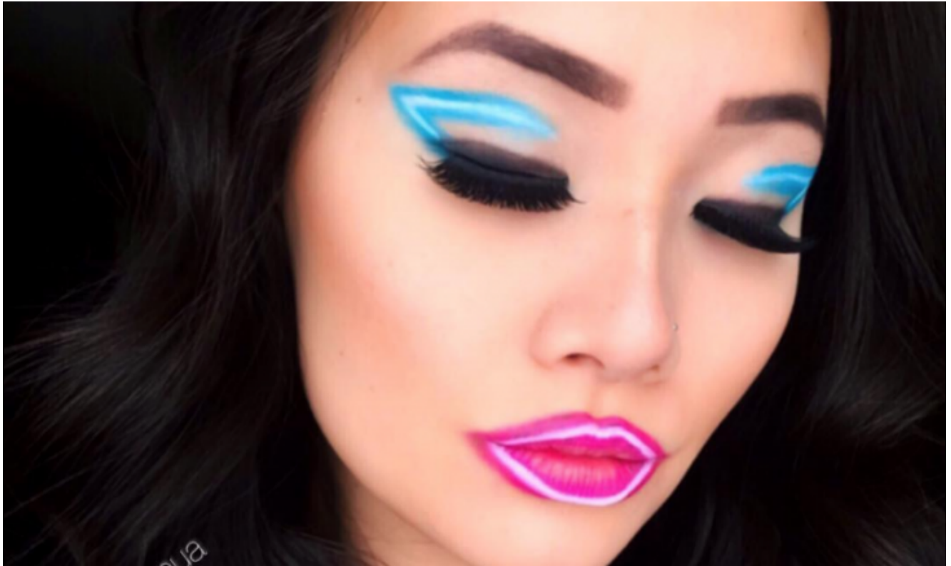
Neon Blue Eyeliner.

Neon Green Eyeliner: For this look, start off by using green eyeshadow to create a background effect for your neon green eyeliner. Then, trace over the shadow with a white eyeliner pencil, creating a wing shape from the inner corner of your eye to the outer corner. Finally, using your neon green eyeliner, trace over that line.