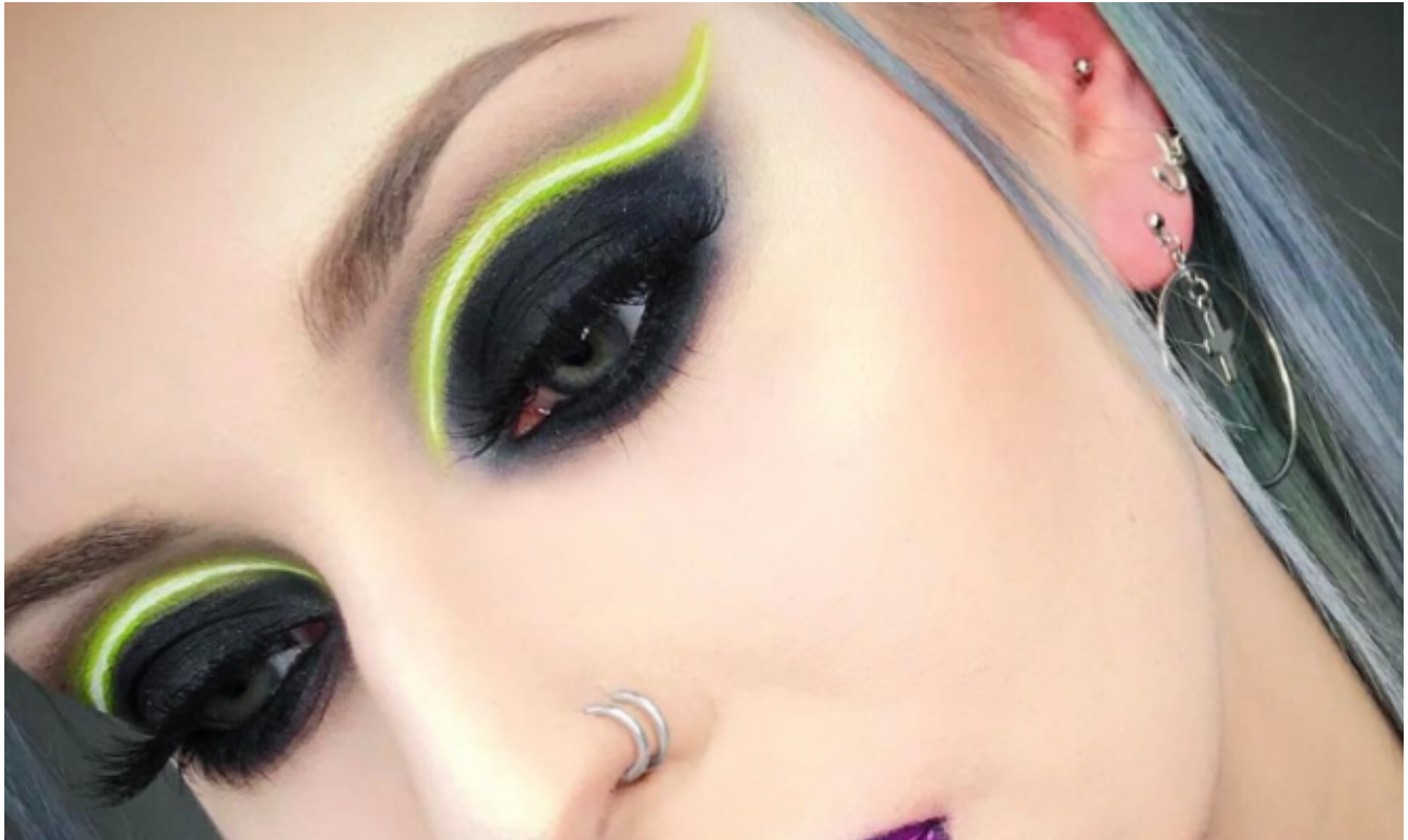
Electric Neon Eyeliner.

Neon Blue Eyeliner: This look, while seemingly complex, is very simple. Grab yourself a thick, white pencil and draw a wing starting in the outer corner of your eye and trace it into your crease. Then, using a pencil brush, trace the outside edges of the thick line you've created with neon blue eyeshadow – make sure to leave the center of the line white, to achieve the electric-effect.