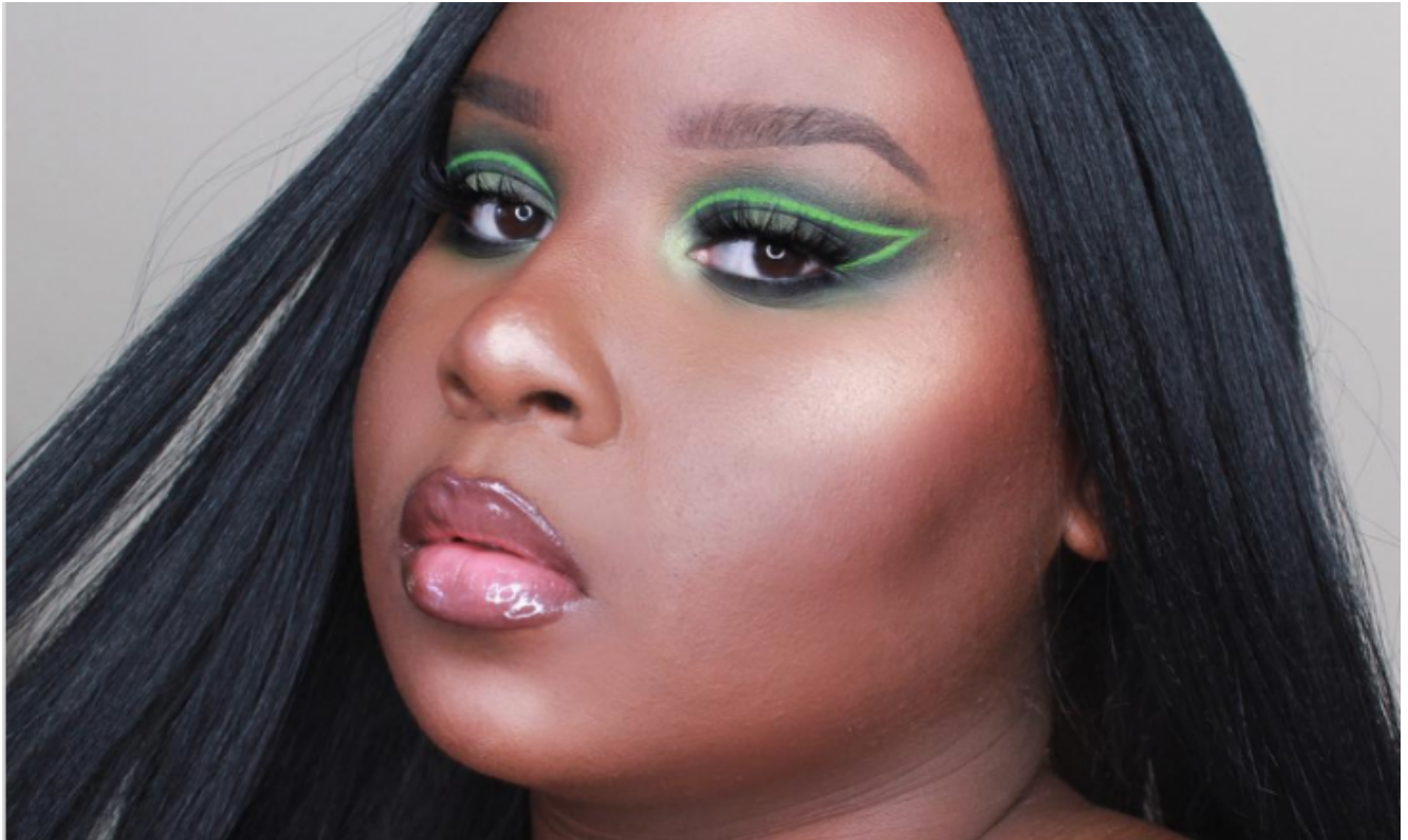
Neon Green Eyeliner.

Pink Neon Eyeliner: This candy pink eyeliner look is one of our all time favorites. Be sure to start off with a light base then draw your neon pink eyeliner above your lash line and continue your wing up into the crease. To really help it stand out, smoke out lower lash line by applying a darker shadow using a pencil brush.