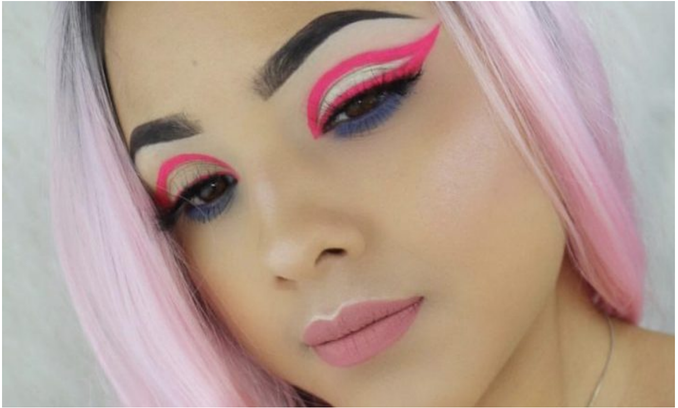
Neon Pink Eyeliner.

Have any more neon eyeliner inspirations that you'd like to share? Comment below.