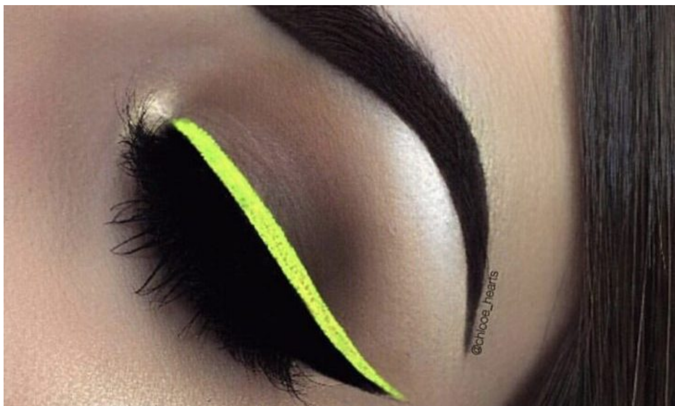
Neon Yellow Eyeliner.

Neon Yellow Eyeliner: This look may seem like it's very difficult to achieve, but if you have the right products, you'll nail it. Start off with a light smoky eye, trace on some white eyeliner, then top it off with neon yellow eyeliner to make it pop.