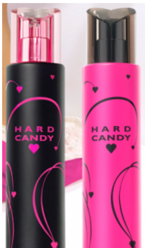
Hard Candy Perfumes.

Exclusively available at Walmart, Hard Candy perfumes are the perfect budget-friendly beauty product to make you feel confident going out on the town. Available in Pink and Black scents featuring a blend of fresh fruits and elegant musks, these perfumes were inspired by the confident, edgy, and flirtatious Hard Candy girl herself. With top notes of fruit, middle floral notes, and lower, sweeter flavors, these