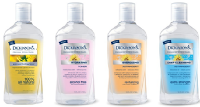
Dickinson's Toner.

With the first ingredient listed being 100% natural witch hazel, you know what you're putting on your face is great for your skin. Witch hazel is a natural remedy that removes oil and impurities without drying your skin out. Dickinson's toner is a gentle way to remove makeup, free of soaps, dyes, parabens, or sulfates. Fighting winter skin blues starts with your skincare routine, so find products that are healthy for your face.