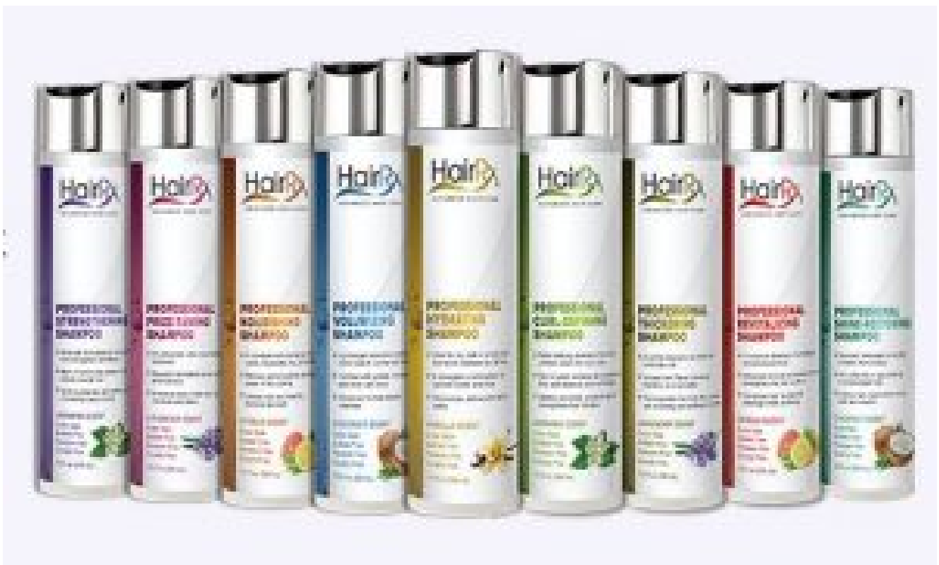
HairRX products.

Joe Segel, CEO of ProfilePro LLC and QVC, has launched a new hair-care product line specifically for women thirty and over. Available for customization, users can answer questions based on their hair's needs, hair goals, and lather and scent preferences to pair them with the best shampoo and conditioner