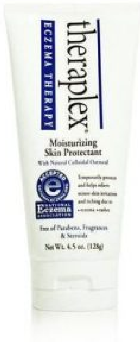
Theraplex Eczema Therapy

Theraplex® Eczema Therapy Moisturizer is a non-greasy moisturizing skin protectant with natural colloidal oatmeal to temporarily protect and help relieve minor skin irritants and itching due to eczema and rashes. This enriched formula helps to relieve and soothe dry skin, offering hours of protection and moisture leaving skin feeling soft and smooth. $18.00