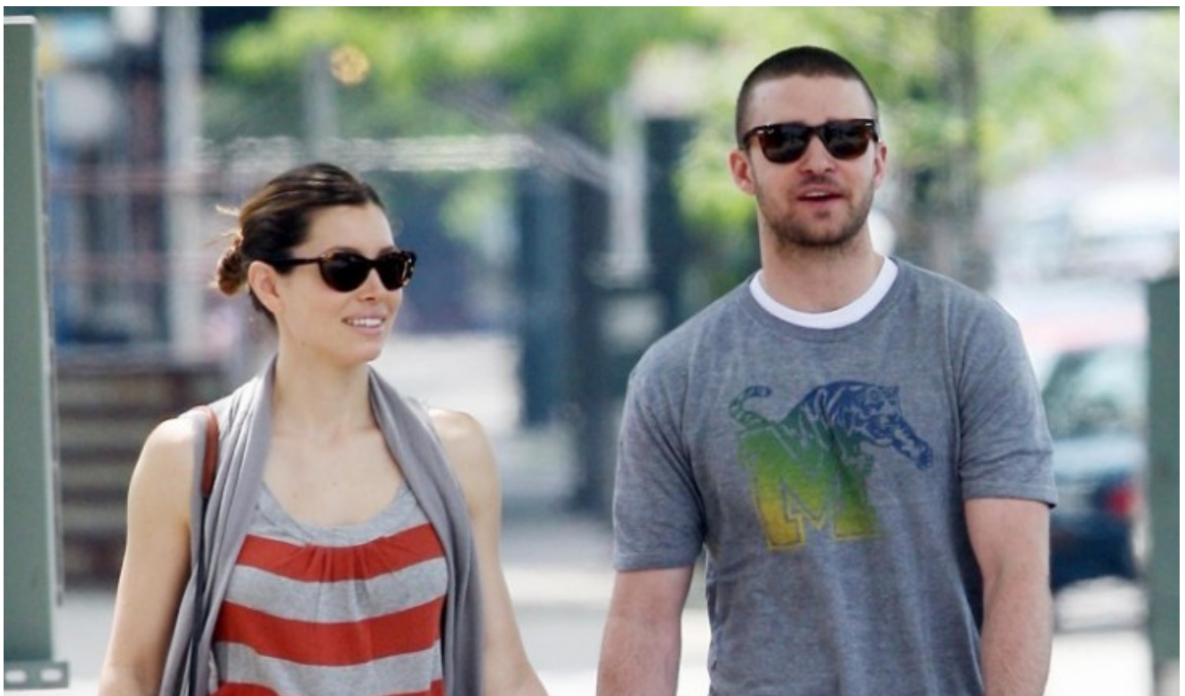
Jessica Biel and Justin Timberlake

The duo that sweats together, stays together! This famous couple seems to believe this truth, as they are often seen jogging together.