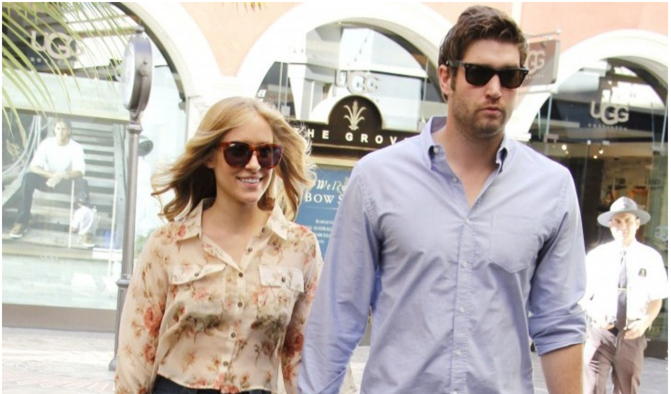
Kristin Cavallari and Jay Cutler

In 2014, the Bears quarterback signed a seven-year contract that guarantees him 50 million dollars. Given his wife's many projects, including a popular line of shoes with Chinese Laundry and an upcoming book, it's easy to see why this celebrity couple made our list!