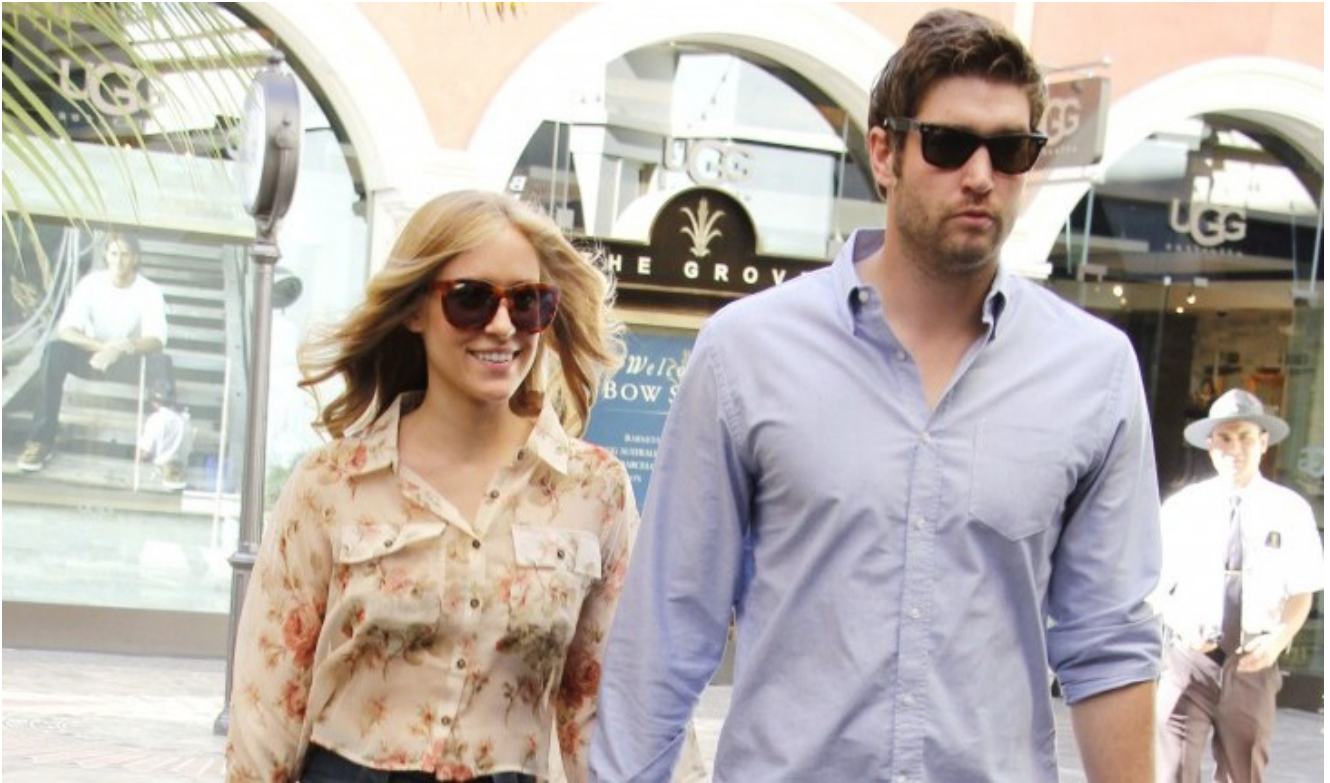
Kristin Cavallari and Jay Cutler

In 2014, the Bears quarterback signed a seven-year contract that guarantees him 50 million dollars. Given his wife's many projects, including a popular line of shoes with Chinese Laundry and an upcoming book, it's easy to see why this celebrity couple made our list!