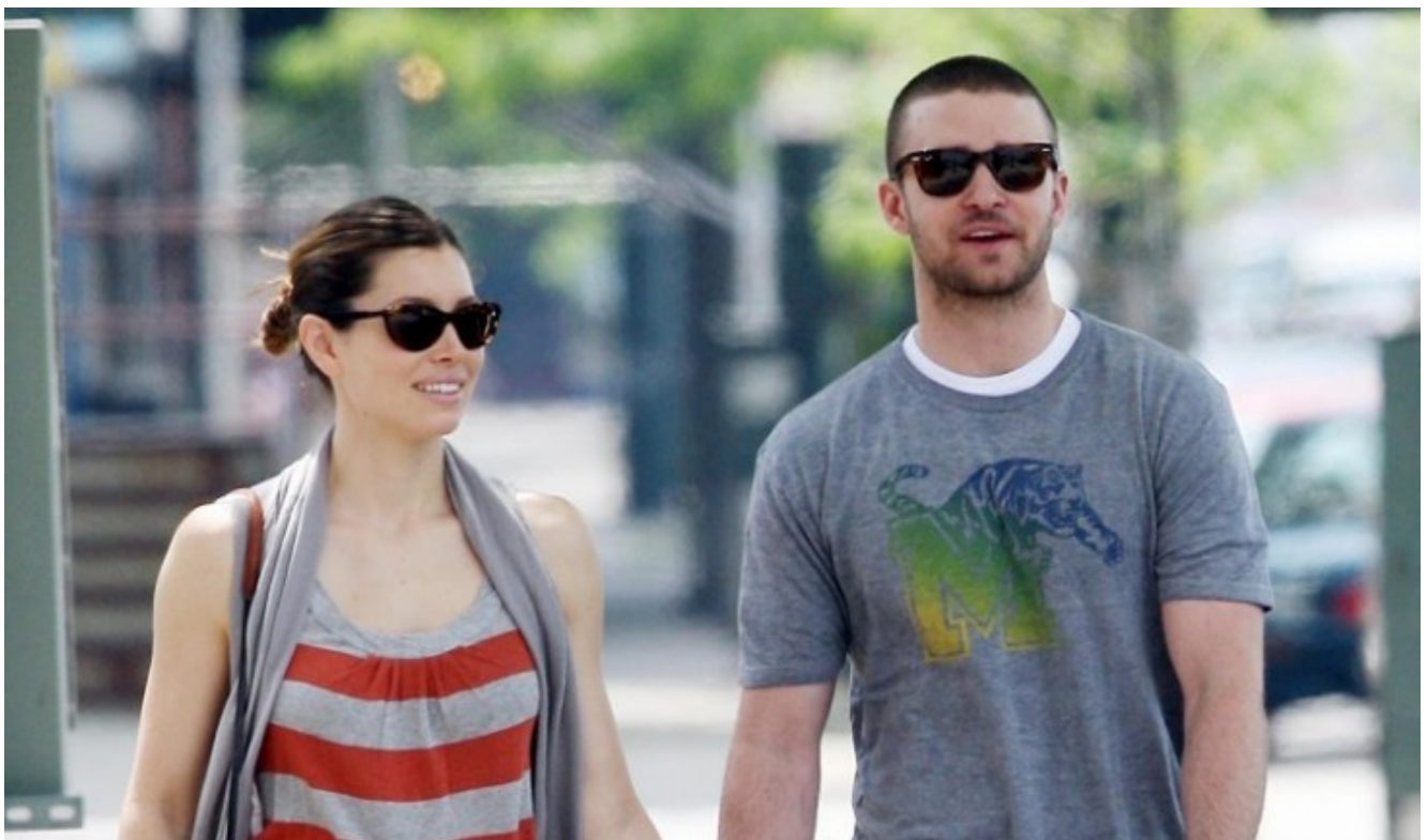
Jessica Biel and Justin Timberlake

The duo that sweats together, stays together! This famous couple seems to believe this truth, as they are often seen jogging together.