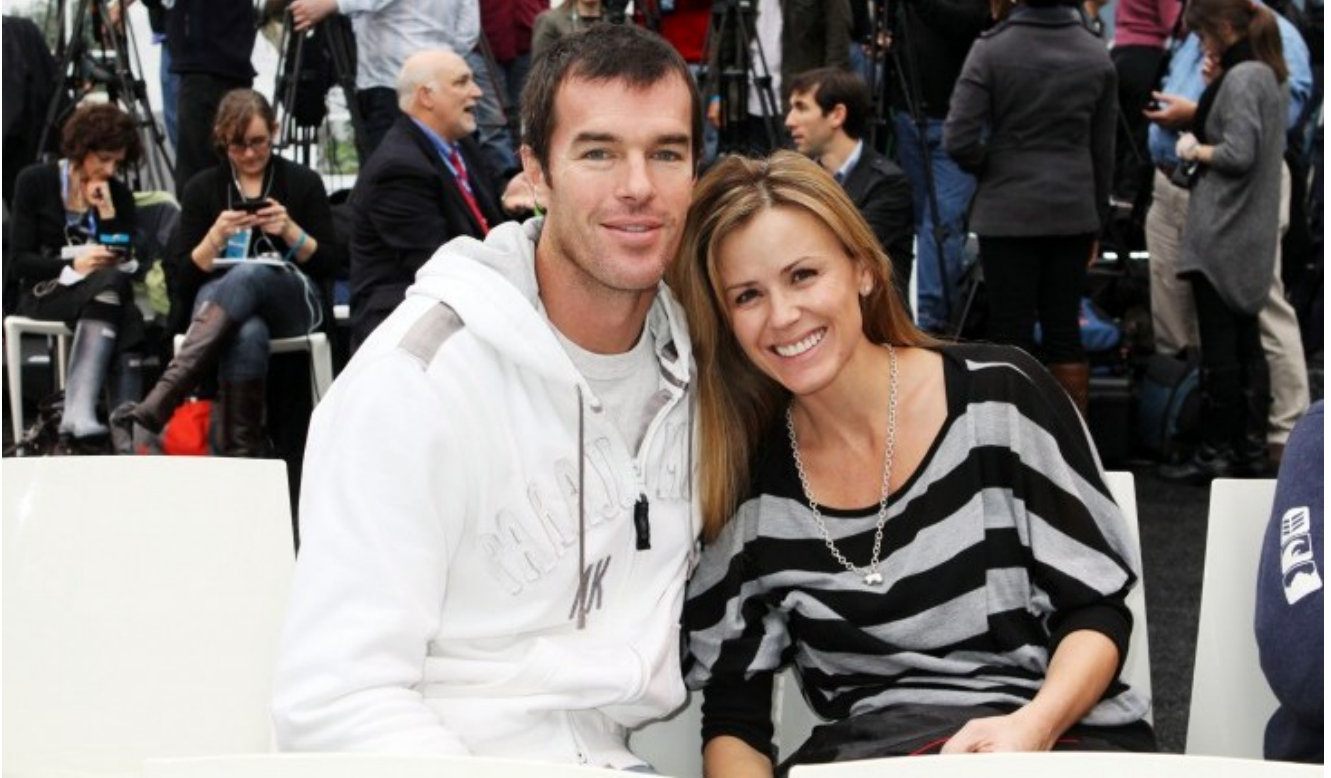
Season 1: Ryan Sutter and Trista (Rehn) Sutter

Trista Rehn was the runner-up during season 1 of 'The Bachelor.' She went on to be the first 'Bachelorette' and found love with firefighter Ryan Sutter. The celebrity couple were married in December 2003. They have two kids and live in Eagle County, Colorado.