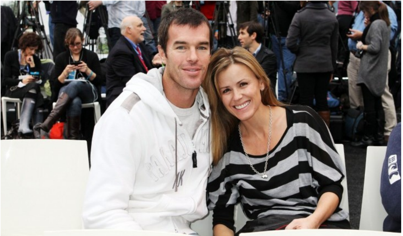
Season 1: Ryan Sutter and Trista (Rehn) Sutter

Trista Rehn was the runner-up during season 1 of 'The Bachelor.' She went on to be the first 'Bachelorette' and found love with firefighter Ryan Sutter. The celebrity couple were married in December 2003. They have two kids and live in Eagle County, Colorado.