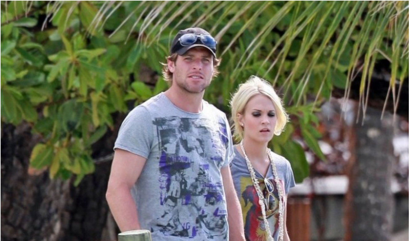
Mike Fisher and Carrie Underwood

The Nashville Predators hockey player and country singer got married in Georgia in July 2010, and then they hopped on a plane to celebrate their honeymoon in Tahiti. The celebrity couple spent their time soaking up the sun on this beautiful island in French Polynesia.