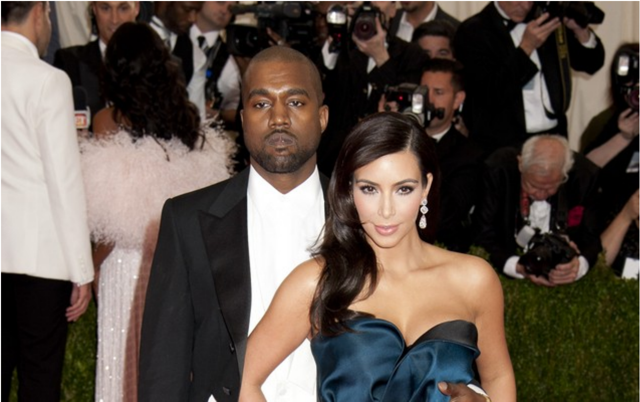
Kanye West and Kim Kardashian

This celebrity couple is known for being extremely fashionable. It's no surprise that the Wests, who were seen at the Grammys participating in some serious PDA, looked photo ready in their designer duds.