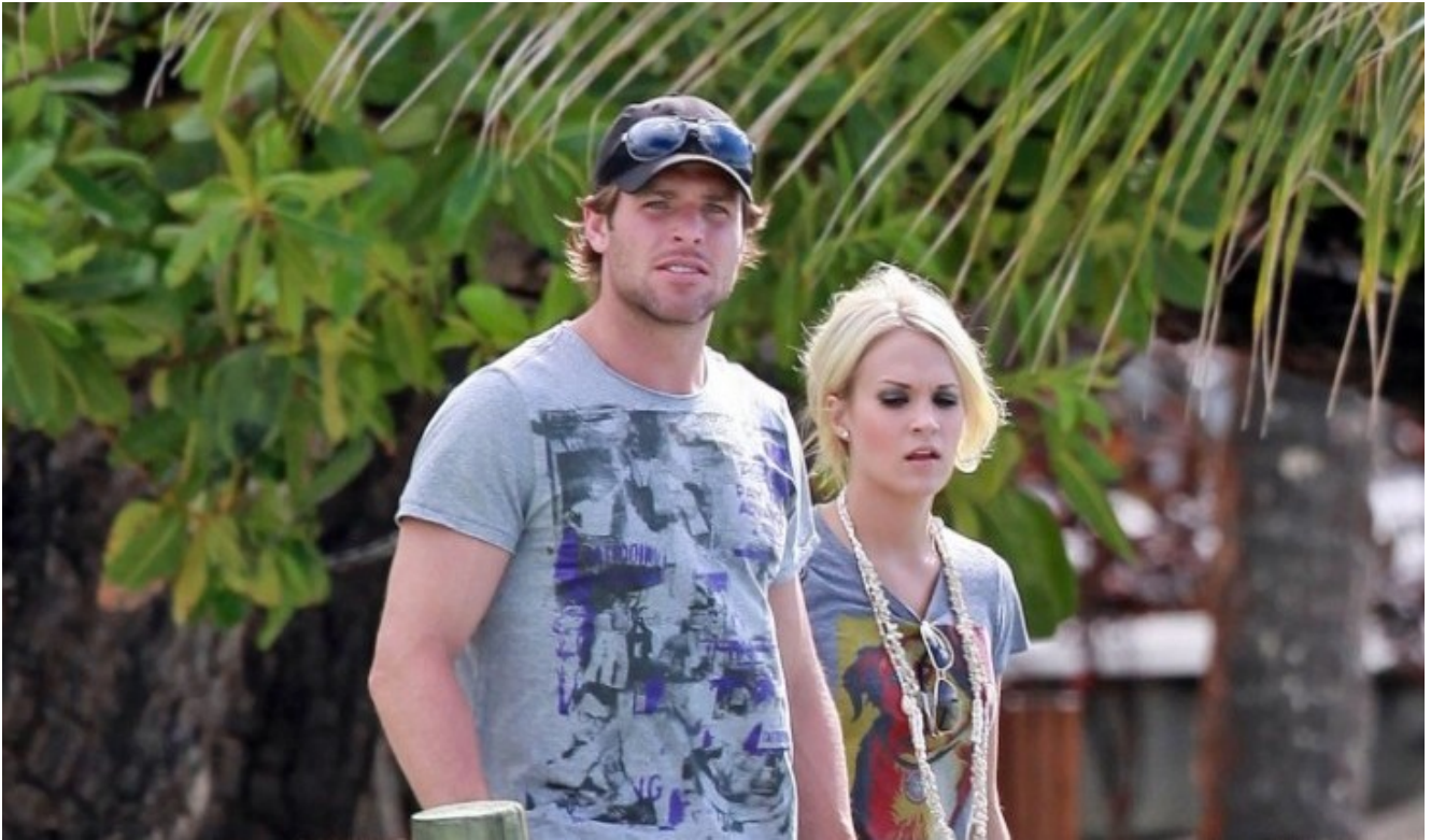
Mike Fisher and Carrie Underwood

The Nashville Predators hockey player and country singer got married in Georgia in July 2010, and then they hopped on a plane to celebrate their honeymoon in Tahiti. The celebrity couple spent their time soaking up the sun on this beautiful island in French Polynesia.