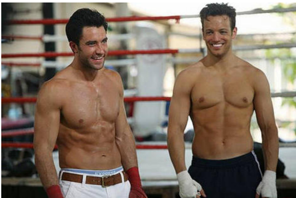
The two things