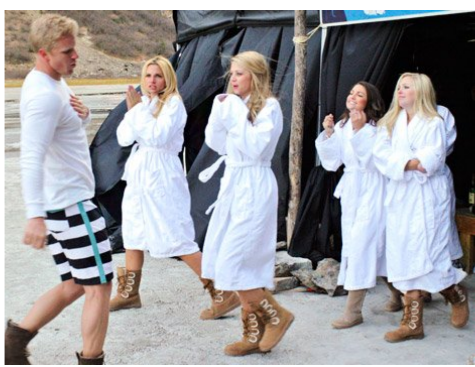
By Jared Sais