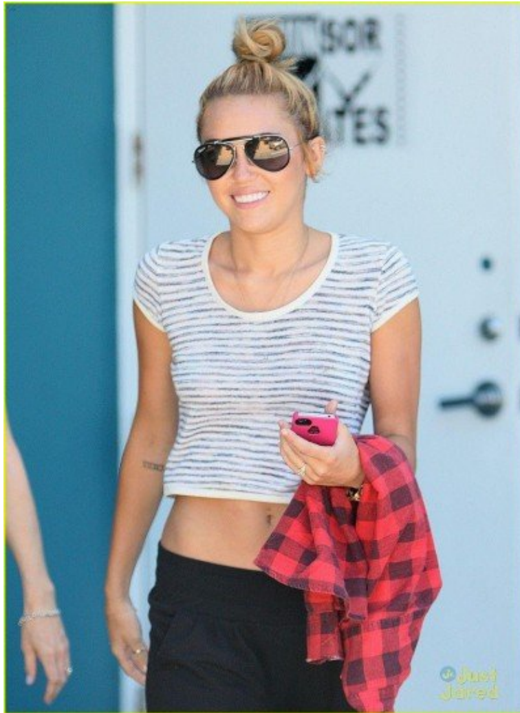
Miley Cyrus with Boostcase.