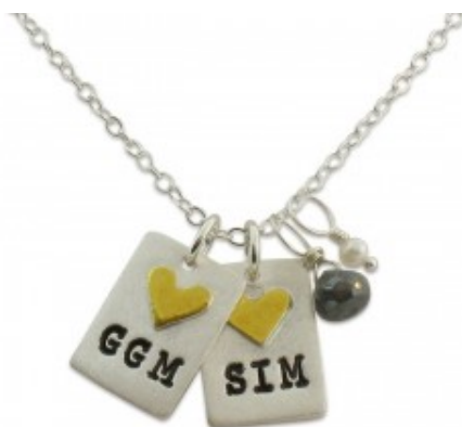
Little Love Necklace.

Lucky for you, Isabelle Grace Jewelry is giving away a Little Love Necklace to one CupidsPulse.com reader! You can personalize it with up to three characters, making it a romantic addition to your next night out on the town.