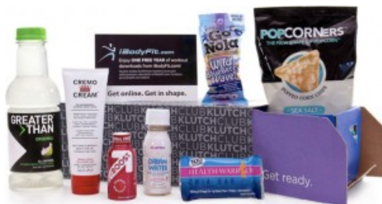
The Men's September KLUTCHClub Box.