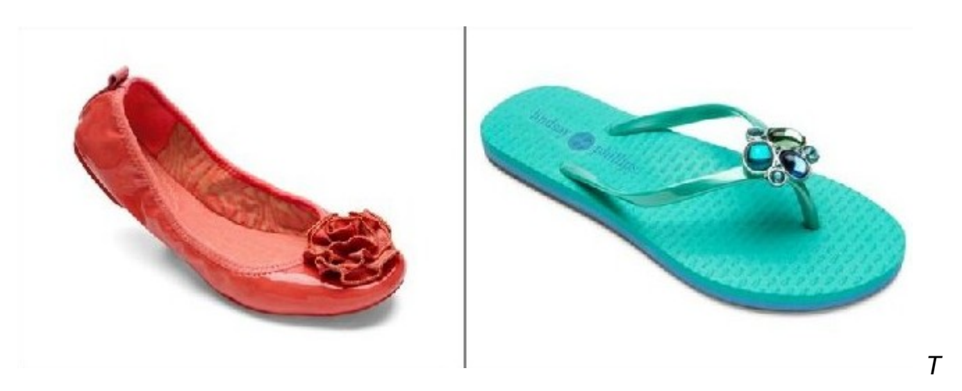
his post is sponsored by Tsubo Boots.