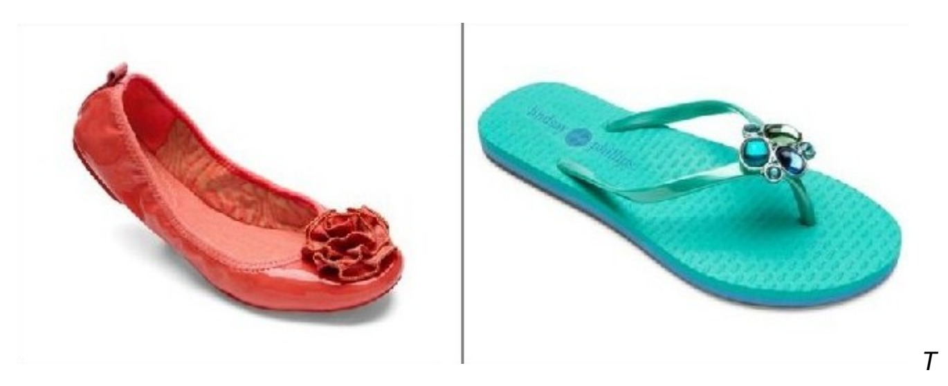
his post has been sponsored by SHOLDIT.