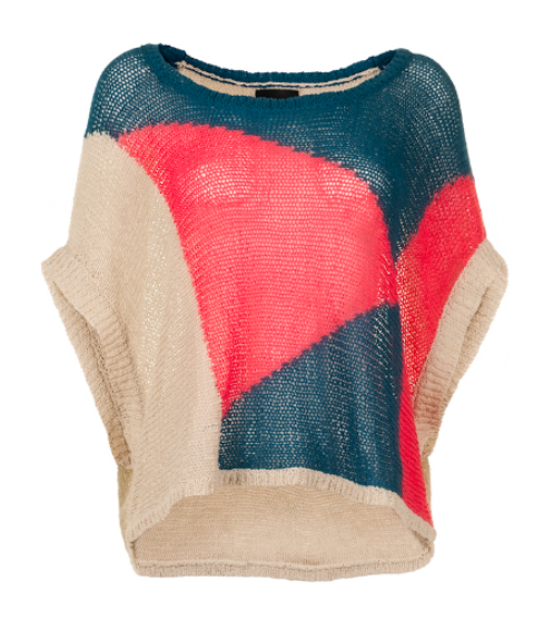
Quantum Sweater.

Why not take some fashion advice from a few sensible and stylish celebrities and wear outfits that easily transition from work to play? Hilary Duff, Mila Kunis and Bridgit Mendler want clothing that is both simple and luxurious. The Quantum Sweater at www.MadisonLosAngeles.com, made by Line Knitwear, does just the trick, updating your wardrobe and keeping you in style. This sweater is soft, light and comfortable. It's so fashionable that not even a necklace or bracelet is needed to accessorize it. What's really great is that this colorblocking top also changes with the seasons taking you from spring to summer and even into fall!