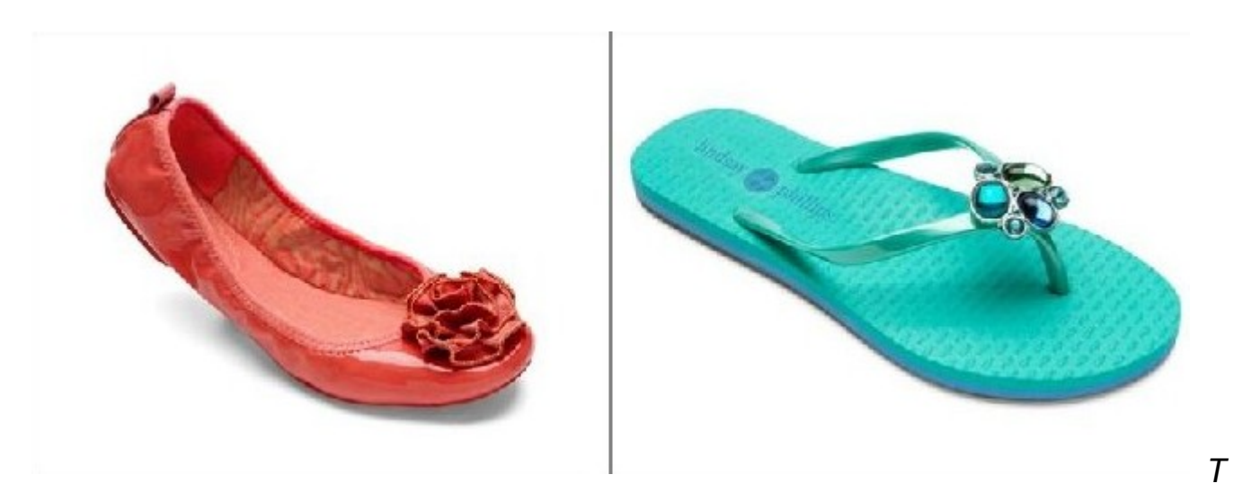
his post is sponsored by No nonsense.

No nonsense tights and leggings are the perfect addition to your wardrobe and allow you to change up any look with a pop of color. Paired with dresses, sweaters and blouses, these affordable products are a wintertime must-have that keep you warm and comfortable without compromising style. Conveniently available at food, drug and mass retail stores, No nonsense products can help you get the celebrity look you desire.