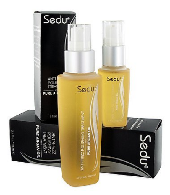
Sedu Anti-Frizz Polishing Treatment with Moroccan Argan Oil

One thing is certain: Folica knows your hair is your most important accessory. That's why in November and December they're offering a special promotion where everyone wins up to $50 to spend on hair styling products at Folica.com. Just think of all the fantastic hair care products you need to keep you looking your best. A few favorites are the Sedu Revolution Clipless Curling Iron to give you fabulous curls every time and the Sedu Anti-Frizz Polishing Treatment with Moroccan Argan Oil for shine and softness. Folica.com has virtually everything you need to create and maintain gorgeous locks. With over 60,000 great hair products, more than 300 beloved brands and over 70,000 customer ratings and reviews, Folica.com is your one-stop shop to recreate today's hottest hairstyles.