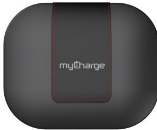
PowerGear Sound.

Have you ever been at the gym, your muscles pumping to a great rhythm and then your bluetooth headphones die? It's a real buzzkill to your workout. PowerGear has designed a case that both protects and charges your headphones! It's compatible with both of PowerGear's headphones and regular earbuds. With 1400mAh battery capacity, it adds 14 times extra battery to your headphones.