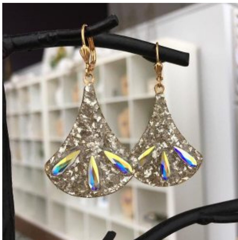
Isabelle Grace Drop earrings.

Another great design by Isabelle Grace! These drop earrings are hand-crafted with crushed German glass and Swarovski teardrop stones for an elegant and retro look. The design comes from Isabelle Grace's Gypsy Glam look that encourages a fearless sense of self and the courage to live life as an adventure. What better gift to give to your children as they