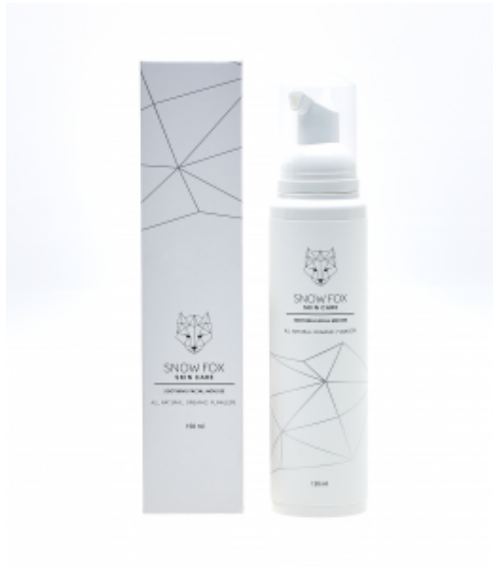
Snow Skin Care: Mousse

2. Step two, Arctic Breeze Detox Mask, is made with 100% organic cotton.