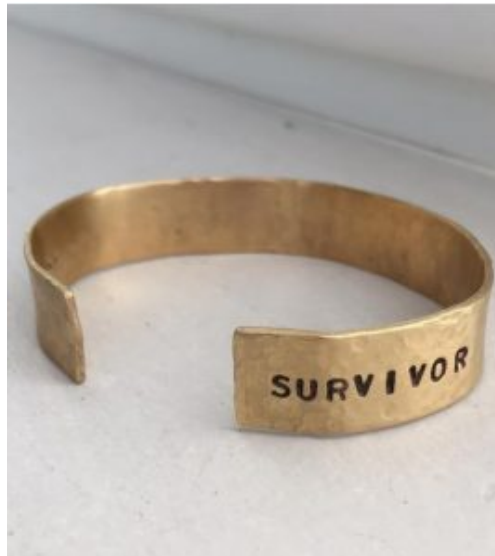
Isabelle Grace Jewelry.