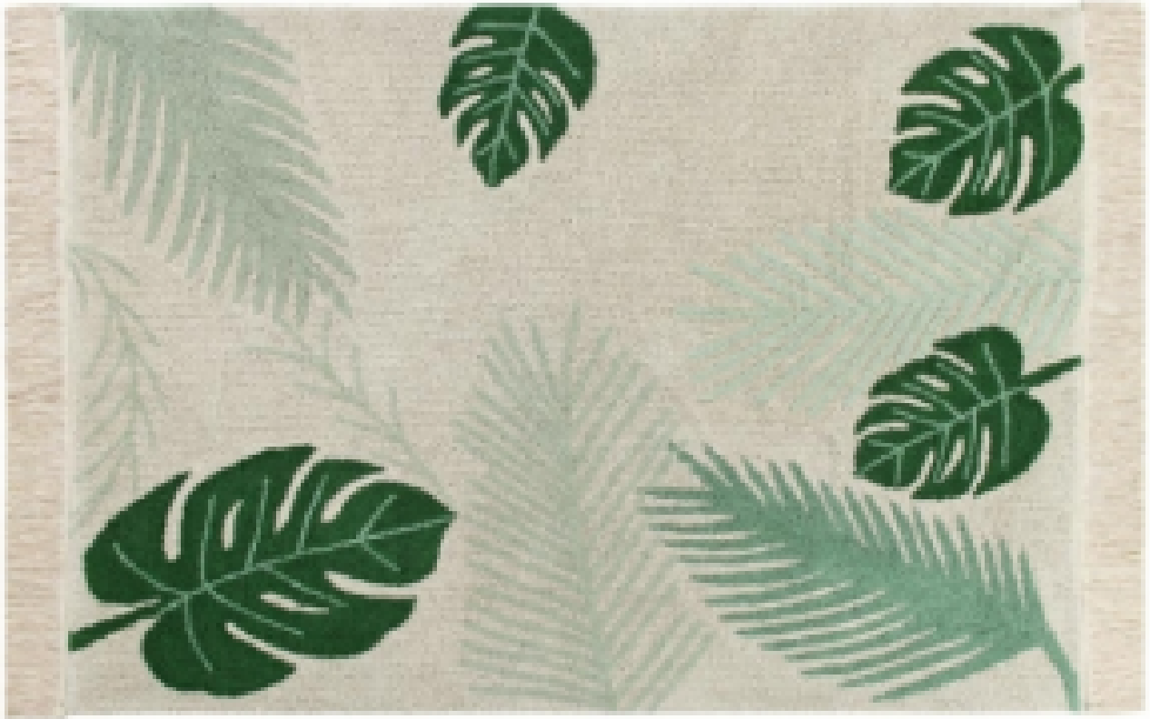
Tropical Green Rug.

Related Link: Product Review: Find Out Why Celebrity Babies Love Lorena Canals Rugs