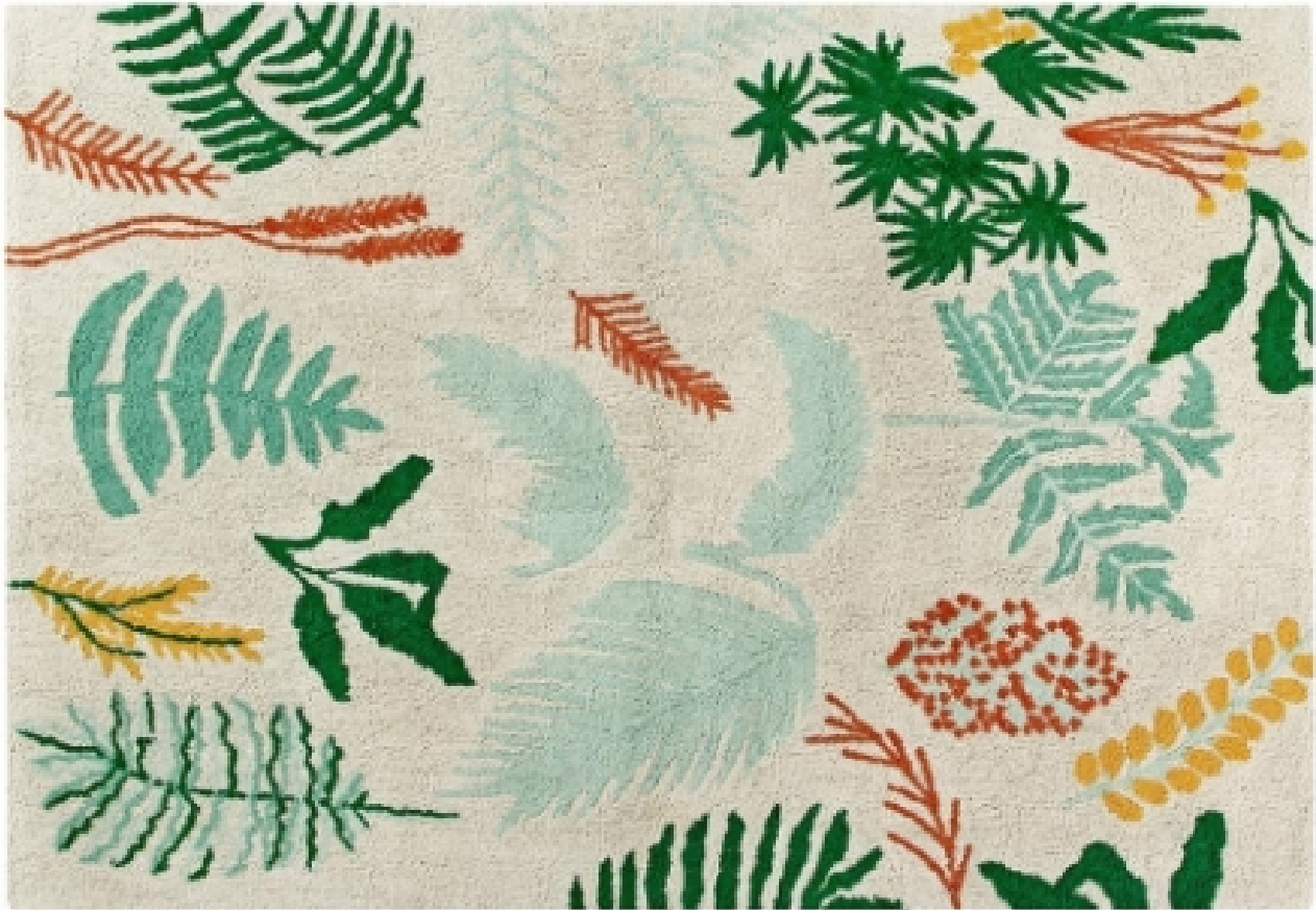
Botanic Plants Rug.

Tropical Green: Try out Lorena Canals's Tropical Green rug in your apartment space. This rug will also be a great gift for a child going off to college or for a bridal shower. Its versatility can go with any room decor!