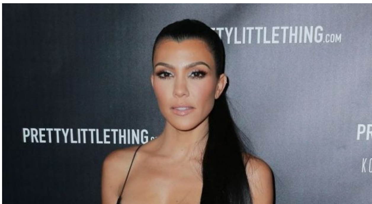
Kourtney Kardashian.

If you are wondering what “plant-based skincare” means and if it really makes a difference, Snow Fox products make sure to notate that their formula includes no parabens, silicones, SLS, palm oil/palm oil derivatives, DEA, MEA or PEG, phthalates, formaldehyde, petrochemicals, phenoxyethanol, mineral oil, sulphates, artificial colors/dyes, artificial fragrances, synthetic preservatives, or animal origin ingredients.