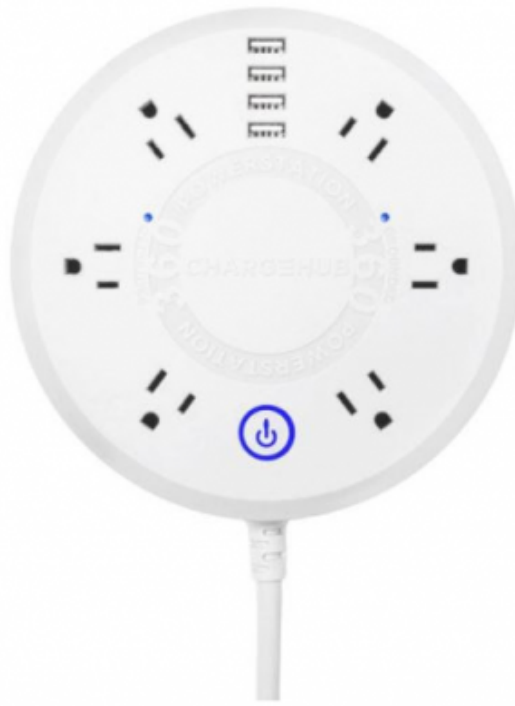
ChargeHub Powerstation 360.

No more fighting with the family to see who gets to use the outlet! With this power station, 10 devices can charge at the same time. The port has six adapter outlets, as well as four USB ports. The USB ports have SmartSpeed® Technology, which means the device will charge much faster than a normal port. The station can be simply placed on the floor, or even mounted on the wall. For only $60, this product is a steal!