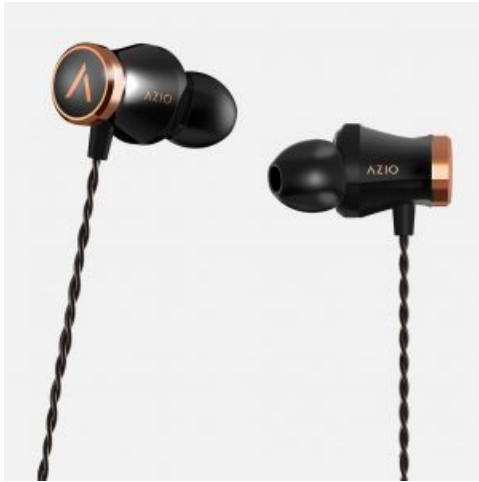
AZIO HEARA headphones

Anyone who runs knows that headphones are a necessity! AZIO HEARA headphones are the new must-haves in the world of running. The headphones are tuned hybrid drive with a structured hi-resolution earphone. The dynamic woofer provides a rich bass and precise mids, while the ceramic tweeter creates a clear high-range harmonic. The earbuds are also known as gaming earbuds that were designed to match up with the AZIO retro classic gaming keyboard. AZIO HEARA headphones are JAS hi-res certified to give you a studio-grade sound reproduction of every detail and wide frequency range. Just imagine running with that kind of sound reverberating in your ears.