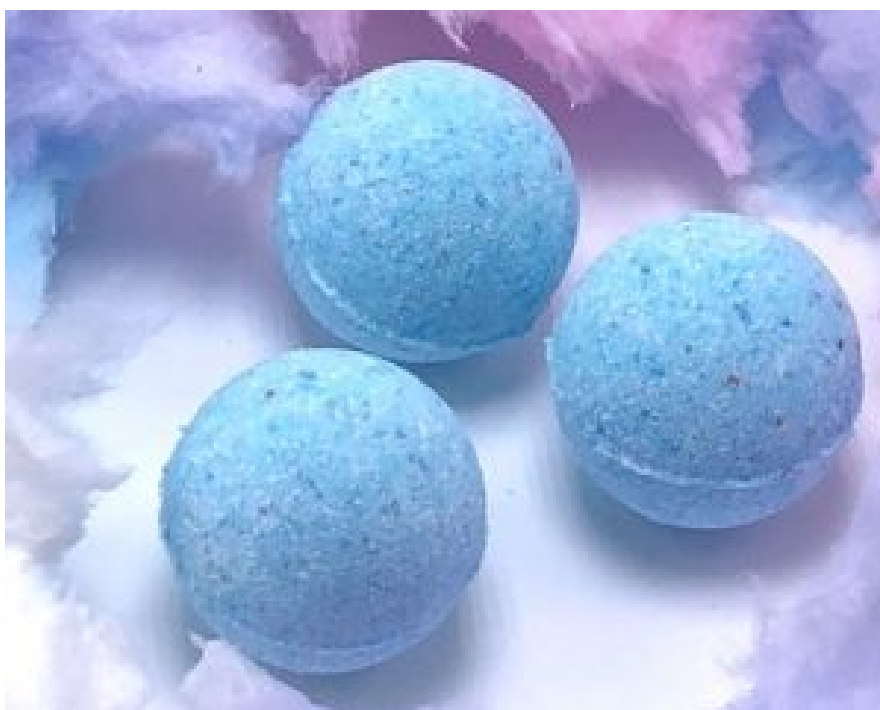
My Drink Bomb.

For your drinking fancies, My Drink Bomb has a delightful drink bomb for every palette. Just like bath bombs, drink bombs fizz into your drink for an extra explosion of flavor. Made from all natural ingredients, organic herbs, and the occasional 24K gold, these bombs are nonalcoholic and great for any person and any age. With low sugar, sugar-free, and gluten-free options, anybody can drop one of these drink bombs into a glass of water, soda, or alcohol for an extra fun punch.