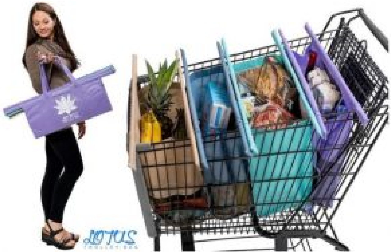
Lotus Trolley Bag.

Get ready to up your grocery shopping game. This product comes as a set of four and easily lines up in the shopping cart. The re-usable, environmentally friendly bags are easy to use, hold up to 70 pounds, save time at checkout, and have special compartments for cold and fragile items. These bags should definitely be on your wish list.