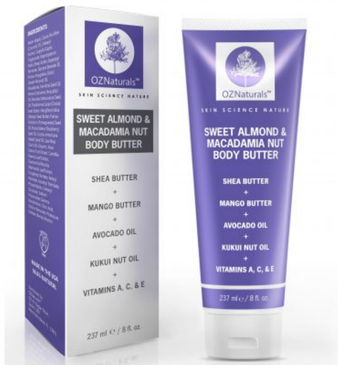
OZNaturals Sweet Almond and Macadamia Nut Body Butter

acids all found in Sweet Almond oil. OZNaturals' goal is to give you beautiful skin.