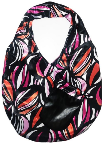
Retro Vegan Leather, $85

Additionally, they have a Bridal & Sparkly Line which offers eight different styles at $45 each, as well as a Pet-Themed Line, which offers four styles that hold all of your pet supplies for $85 each.