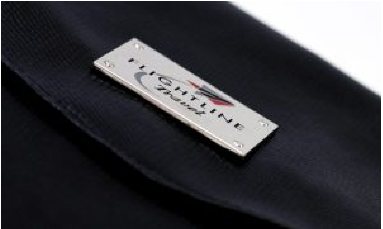
Flightline Travel Tote.

The perfect clutch for your travel essentials, the Flightline Travel Tote has thought of your every need. With side pockets especially designed to hold your passport, legal ID's, and phone, you can easily access all of your essential documents while going through security; no extra time digging through your purse needed. A patent-pending o-ring designed zipper creates the unique ability to still open the clutch while it is placed inside a seat back pocket. The tote easily detaches from other Flightline bags to make trips to the bathroom quick, and all bags come with a small strap so that you can hang your tote anywhere. Though sleek in design, the tote is big enough to hold a small tablet, expanding as wide as a thick magazine. You can customize your tote in either classic black or a deep purple, both made of vegan leather.