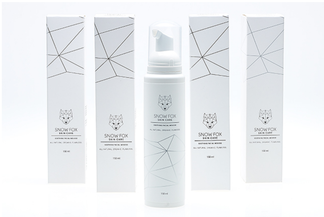
Snow Fox Day & Night Defense Multi Cream