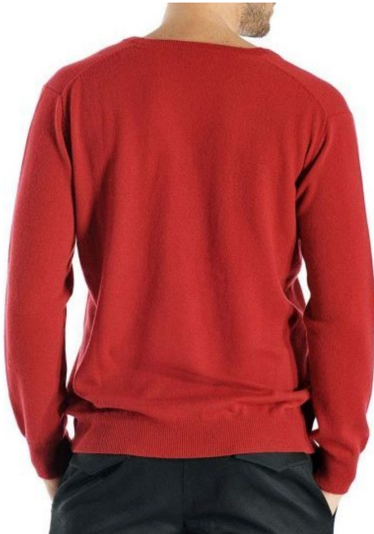
Men's V-Neck Cashmere Sweater.

Made from A-grade, 3 ply pure cashmere, there is nothing more luxurious for your man than this v-neck sweater. What better way to give a man self-confidence and make him feel appreciated than by giving him a sweater of such high-quality? Available in six colors, from a dapper black to a dusk blue, there is nothing sexier for a man to wear on a date than this