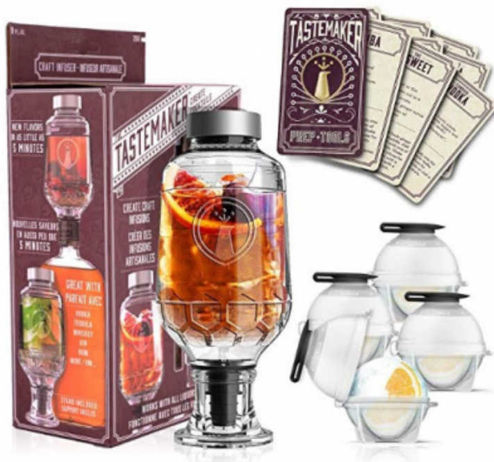
Tastemaker products.

Whether you're hosting a holiday party, or just having some family over, the Tastemaker is a fun gift for experimenting with new cocktail concoctions. This product is quick and easy to use, holds up to nine fluid ounces at a time, and can infuse something in as little as five minutes. You only need a base liquor, fruits and spices of your choice. The set comes with a built-in stainless steel mesh filter, four round ice ball molds and ten exclusive drink recipes. Impress your guests this season with your new found mixology skills!