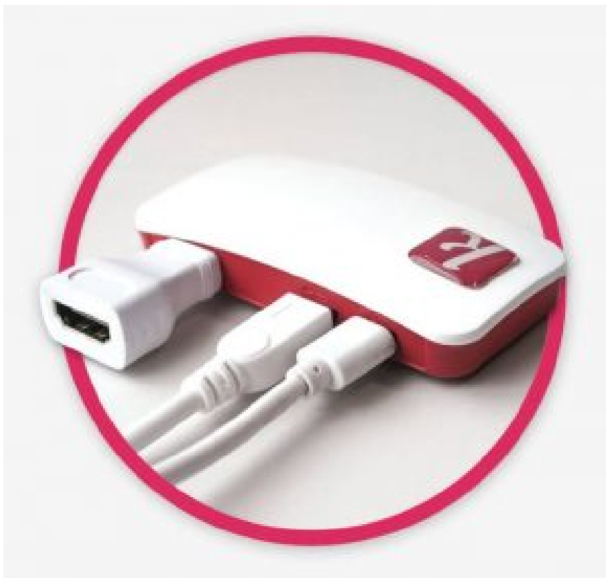
Kwilt Shoebox Mini.

Similar to an external hard drive for your home computer, the Kwilt Shoebox is a storage device for all those family vacation photos you take on your phone. If you lose your phone or just run out of space, you never have to worry about losing artifacts of your memories. Portable and easy to charge, the Kwilt Shoebox has the versatility to attach to a TV or a free mobile app for multiple methods of viewing. With 512 megabytes of storage and the ability to attach to tandem external hard drives, the Shoebox has unlimited space without those extra charges for using the cloud.