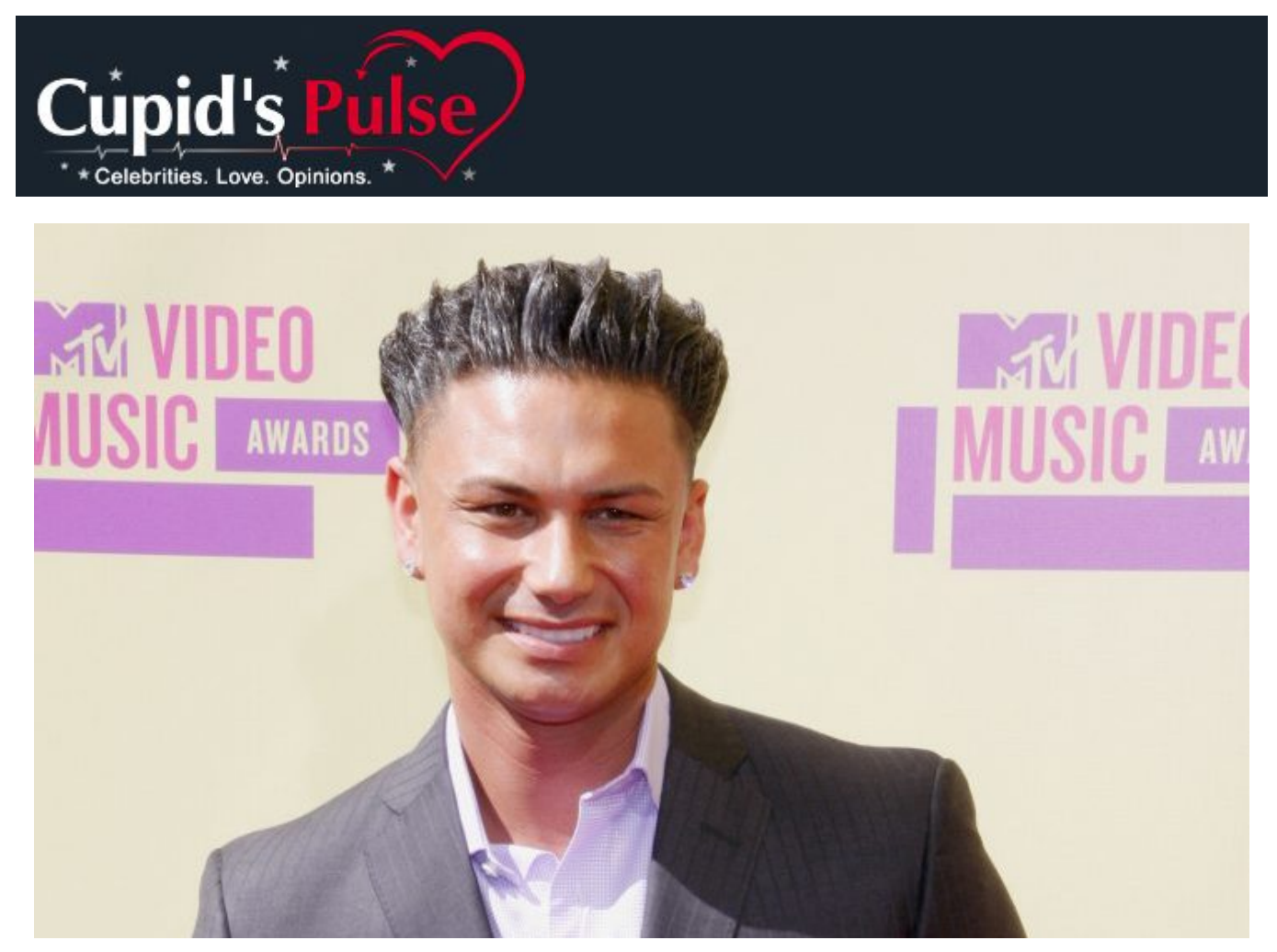
This post is sponsored by AXE.

Whether you're meeting your girlfriend's parents or want to meet up with an old flame, you can be sure to find the right shampoo with Axe. They have something for every guy's needs: