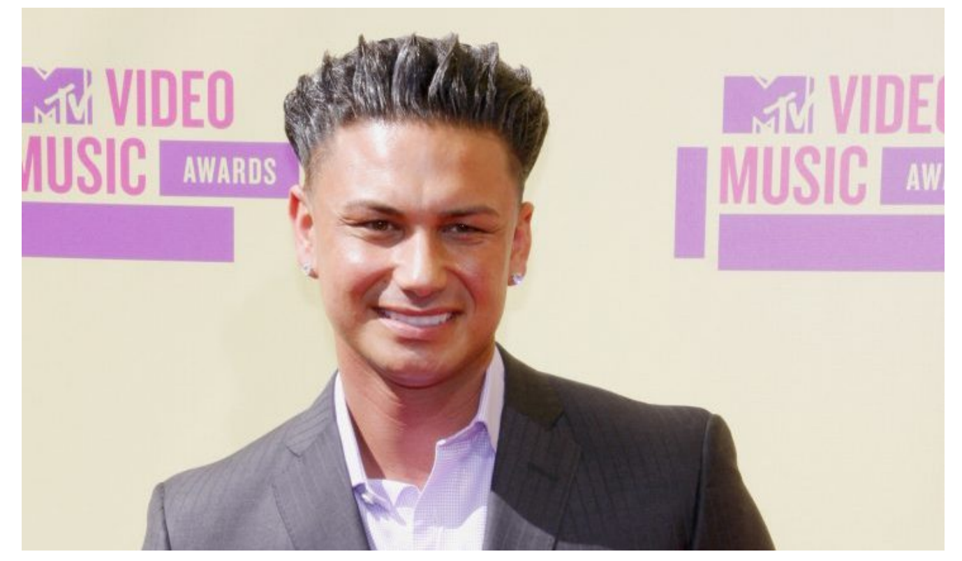
This post is sponsored by Divine Diamonds.

Get some serious sparkle that is fun and affordable with The Ah Ring from Divine Diamonds! Who deserves a fantastic gift more than you?