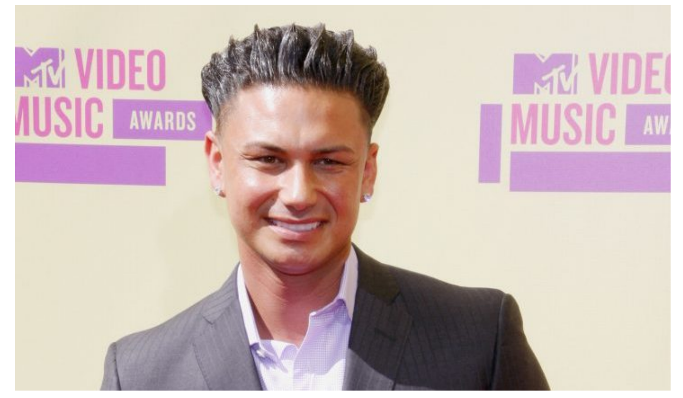
This post is sponsored by Cold Sores Begone.

Check out Cupid's 'must have' product, <u>Cold Sores Begone</u>. It's an herbal topical remedy which instantly aborts the infection, preventing an embarrassing cold sore from surfacing. A few quick dabs to the affected area when the early 'tingle' symptom occurs does the trick. It's a life saver, especially when your appearance is most important.