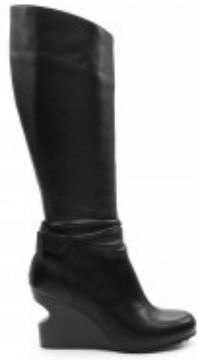
The Hollis boots by Tsubo.

They're not your ordinary heeled boot, either. These wedges give you the perfect amount of height in your daily life, date night, or around the office – without clunking around in a too-thick heel. Plus, the decorative notch on the back heel of each boot adds a unique flair that sets these boots apart from your normal winter wear.