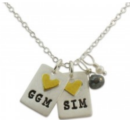
Little Love Necklace.

Lucky for you, Isabelle Grace Jewelry is giving away a Little Love Necklace to one CupidsPulse.com reader! You can personalize it with up to three characters, making it a romantic addition to your next night out on the town.