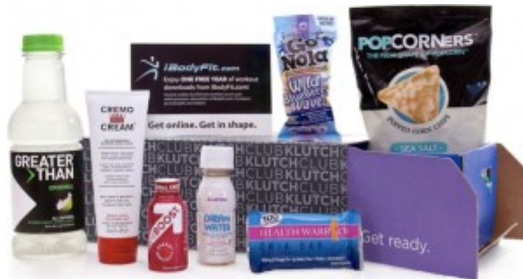
The Men's September KLUTCHClub Box.