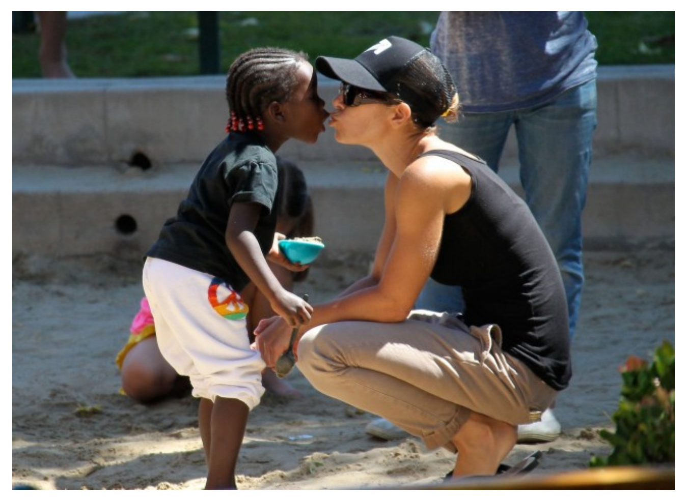
This post is sponsored by The Feltman Brothers and The Ollie World.