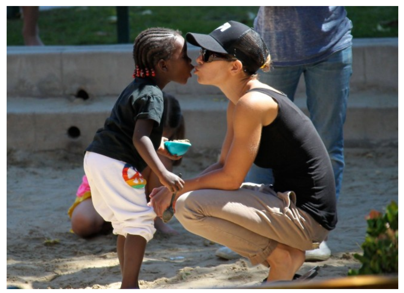
This post is sponsored by "My Baby's Heartbeat Bear"