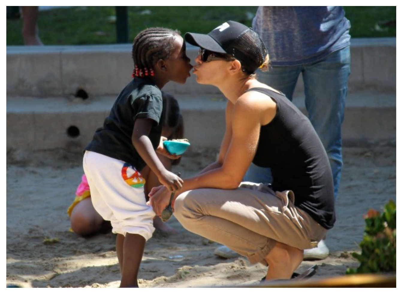
This post is sponsored by Diono.