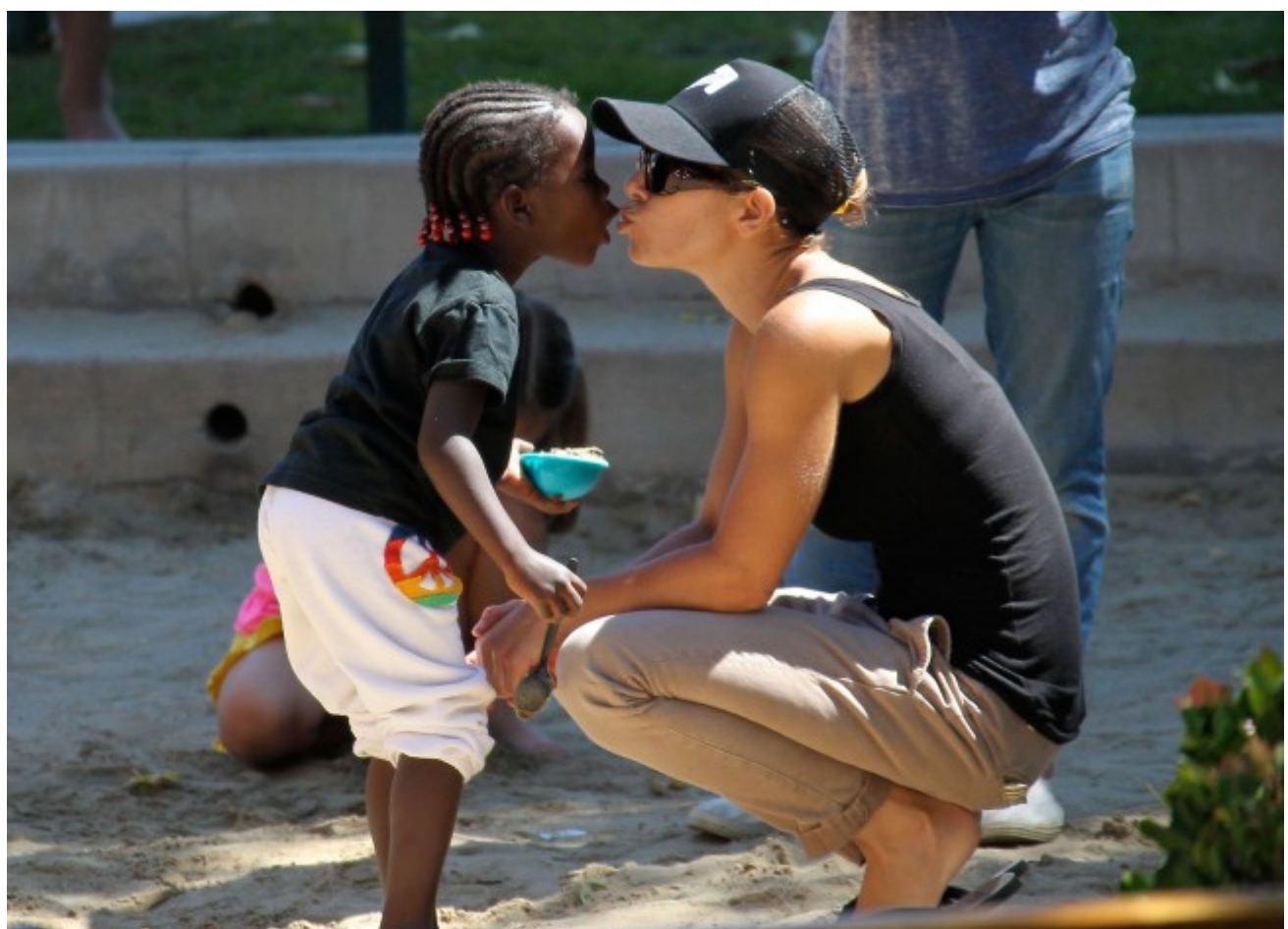
This post is sponsored by BubbleBum, Poli, and Booginhead.