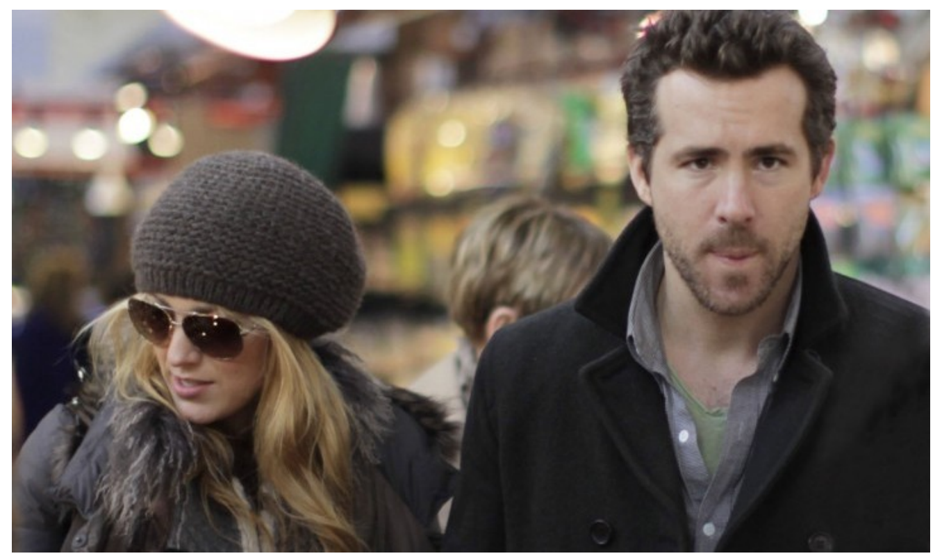
By Yolanda Shoshana

It can be hard keeping up with the love life of celebrities. If you blink, you just might miss a breakup or a week long relationship between two costars. I pulled out my crystal skull to do predictions on some of the celebrities everyone wants to know more about: