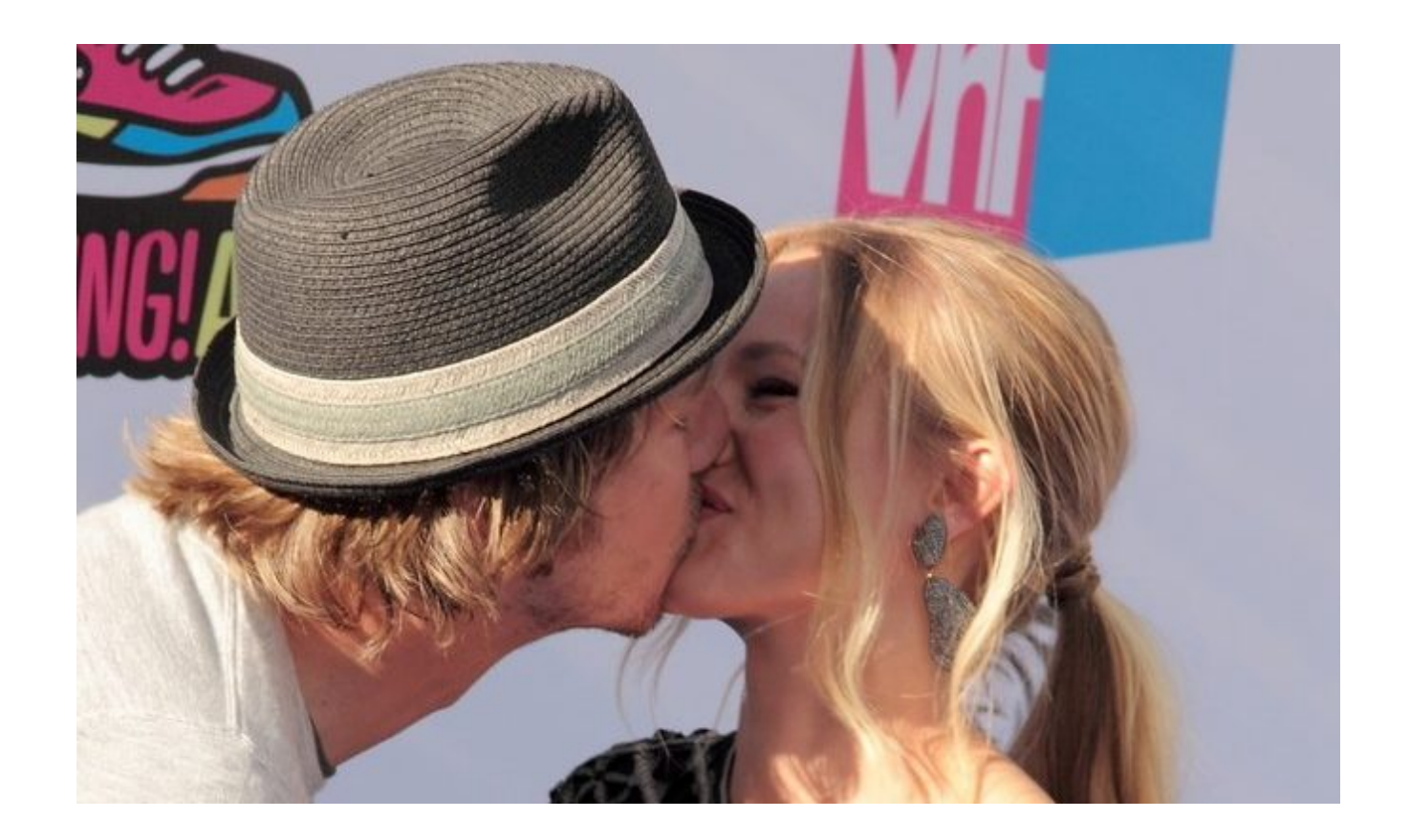
Page 1 of 10