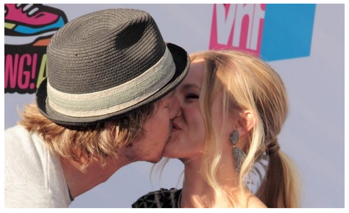
Page 1 of 10