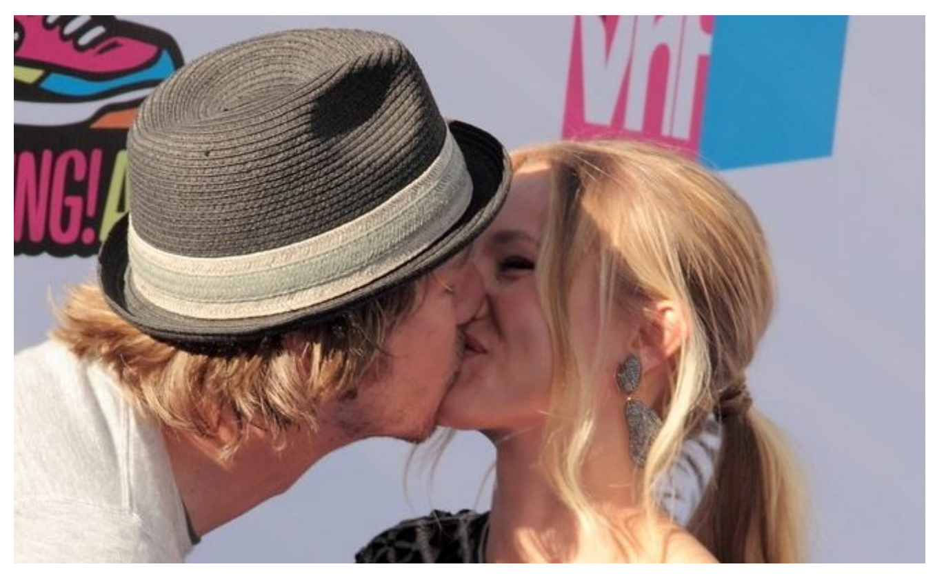
Page 1 of 8