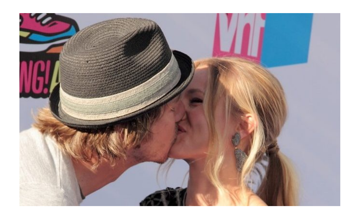
Page 1 of 10