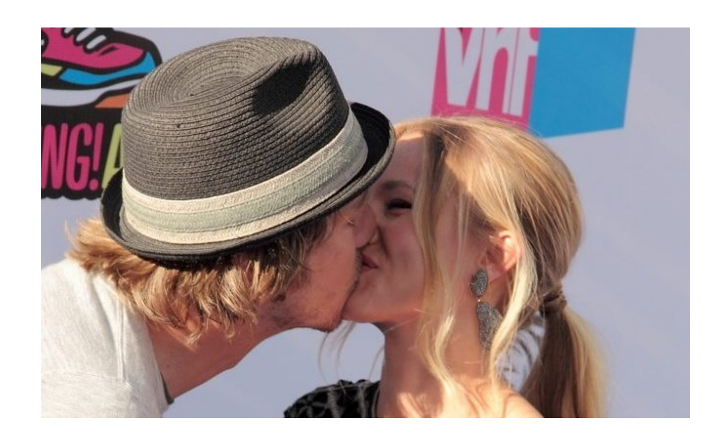
Page 1 of 8