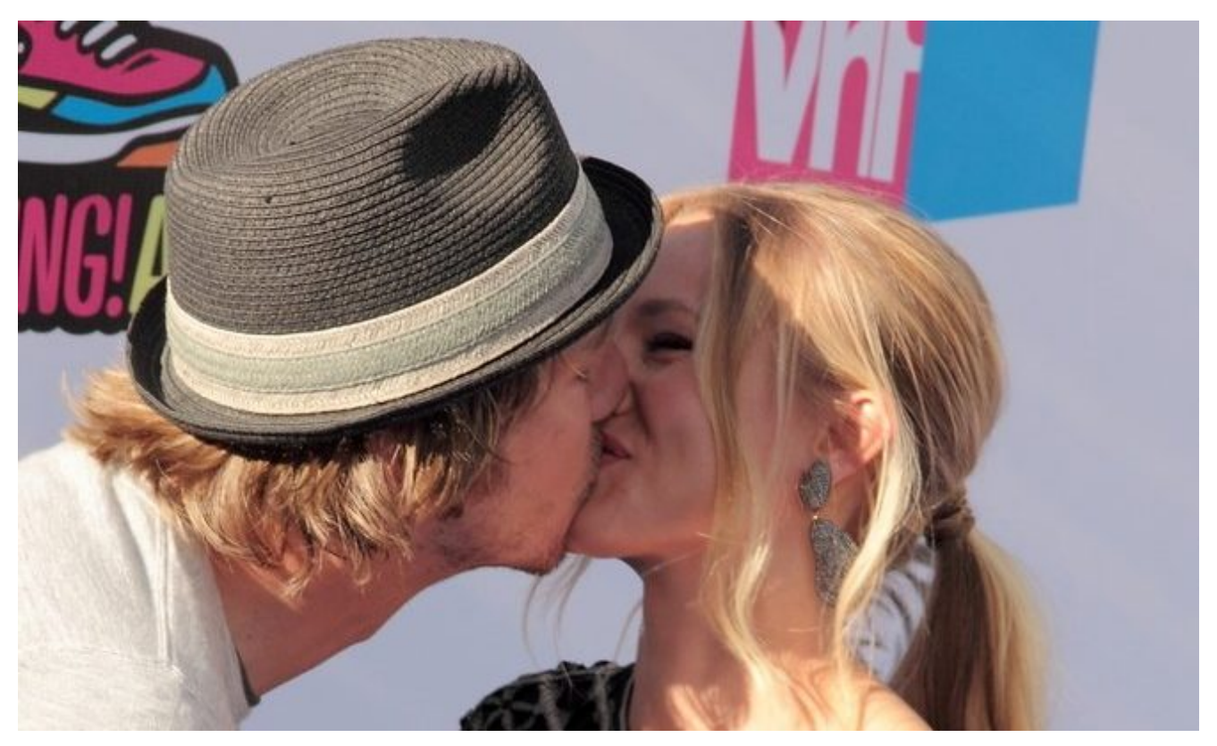
Page 1 of 13