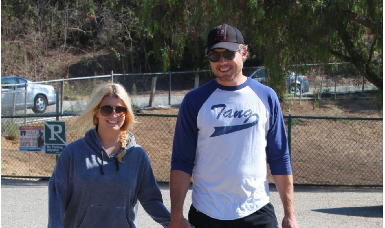
Jessica Simpson and Eric Johnson

Love Lesson 1: Don't be afraid to be yourself.