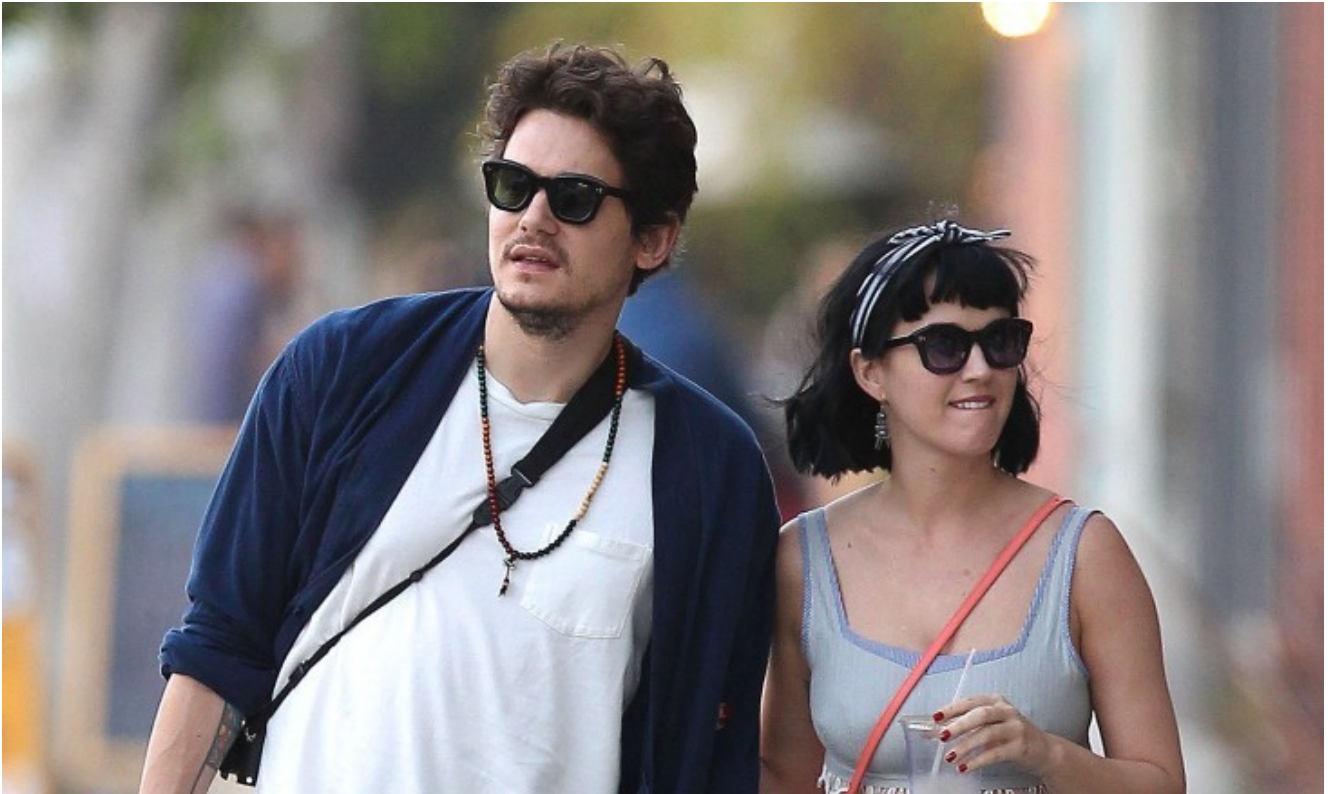
John Mayer and Katy Perry

The singer-songwriter dated Taylor Swift from September 2009 to January 2010. After their celebrity break-up, she penned the song 'Dear John,' which reportedly "humiliated" Mayer. He then began an on-again, off-again relationship and love with the 'Firework' singer. In recent months, there have been rumors of a feud between the two pop stars. Perhaps they're fighting over the soulful crooner?