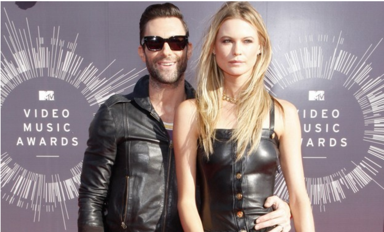
Adam Levine and Behati Prinsloo

This beautiful couple got hitched in July and walked their first red carpet as husband and wife at the MTV Video Music