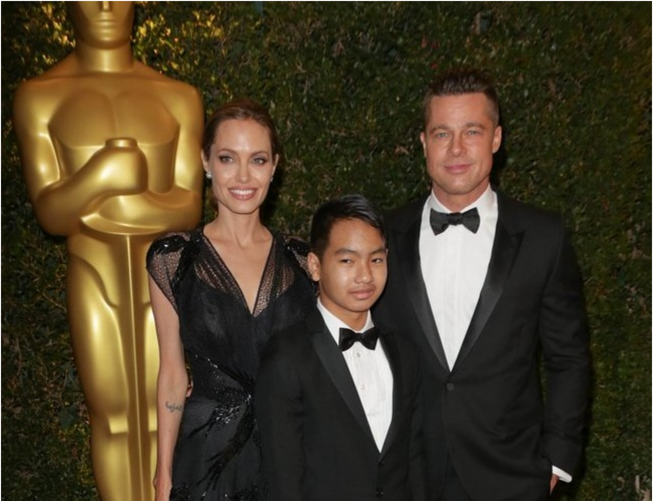
Angelina Jolie and Brad Pitt with son Maddox

The Jolie-Pitt's are perhaps the best known family in Hollywood when it comes to adoptions! Three of their celebrity kids -- Maddox, Zahara, and Pax -- were adopted from Cambodia, Ethiopia, and Vietnam respectively. They also have three biological children: Shiloh, Knox, and Vivienne.