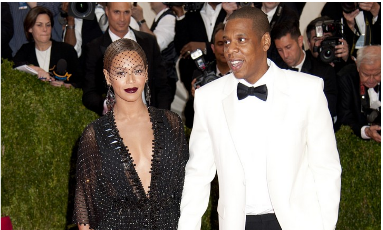
Beyonce and Jay Z

Known as the queen and king of music, this couple is one of