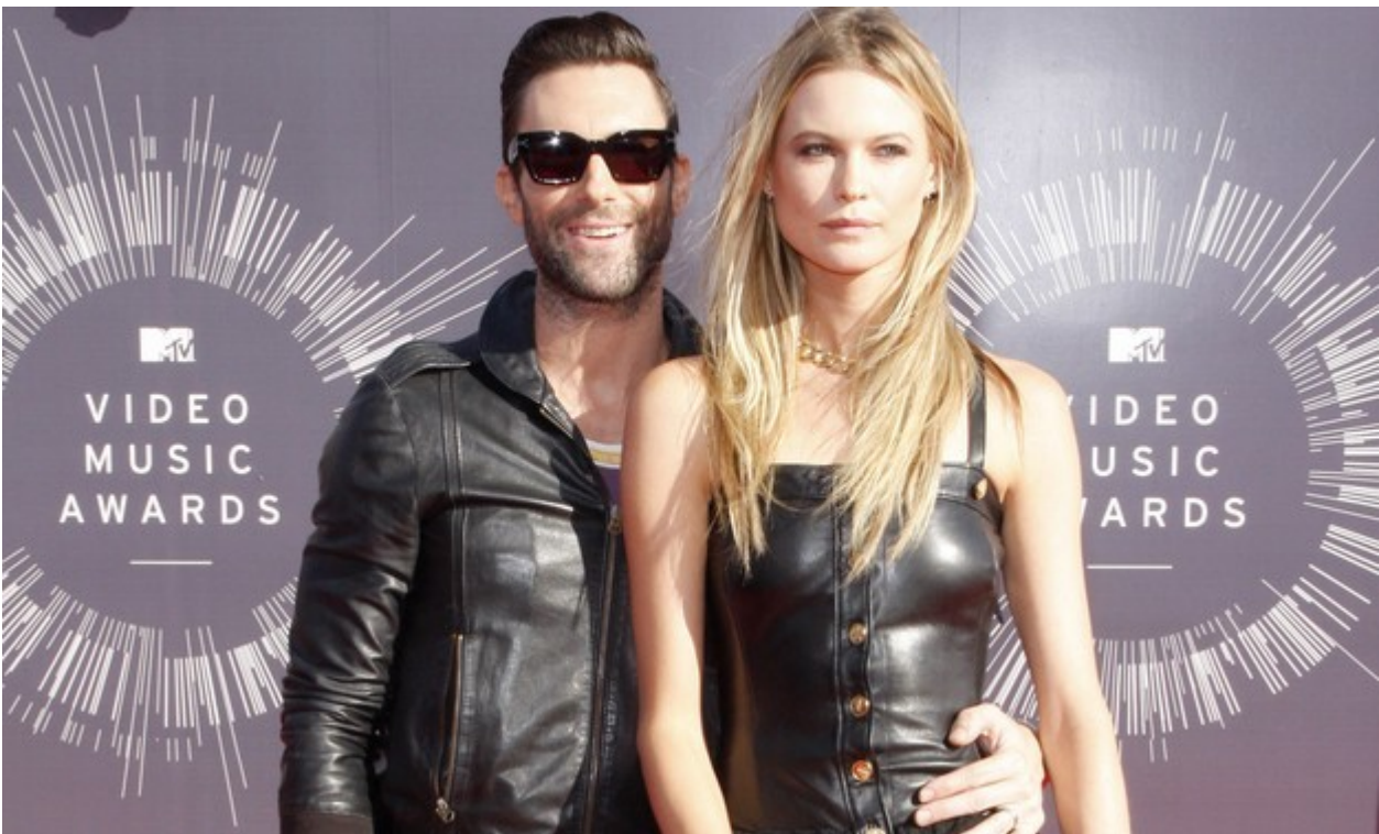
Adam Levine and Behati Prinsloo

This beautiful couple got hitched in July and walked their first red carpet as husband and wife at the MTV Video Music