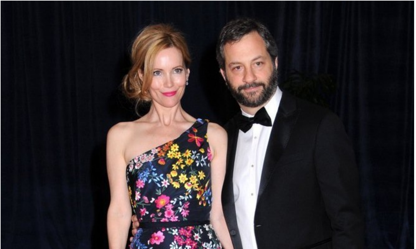
Leslie Mann and Judd Apatow

The hilarious actress and her film producer husband met on the set of 'The Cable Guy' in 1996 and were married a year later. Since then, this celebrity couple has worked together on a number of comedies, including 'The 40 Year Old Virgin' and 'Funny People.'