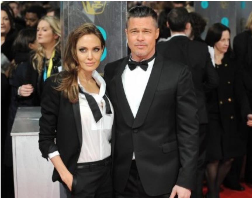
Brad Pitt and Angelina Jolie

This power couple has welcomed six adorable children into their family -- three of whom they adopted -- since they began dating in 2005. In April 2012, they announced their