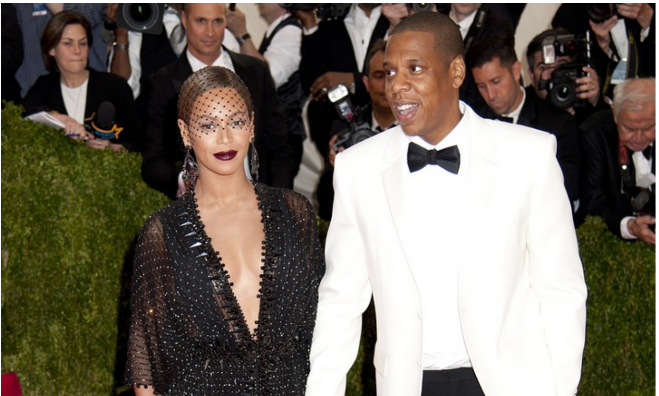
Beyoncé and Jay Z

Known as the queen and king of music, this couple is one of