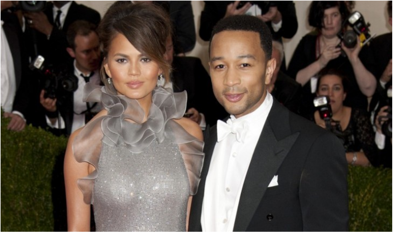
Chrissy Teigen and John Legend

The soulful singer-songwriter and his wife, who has been in the media for her humorous crying face, most recently appeared at the Grammys on Feb. 8. Legend and Common will be performing the Oscar-nominated song 'Glory' from the movie 'Selma.' Fingers crossed that they take home the golden statue!