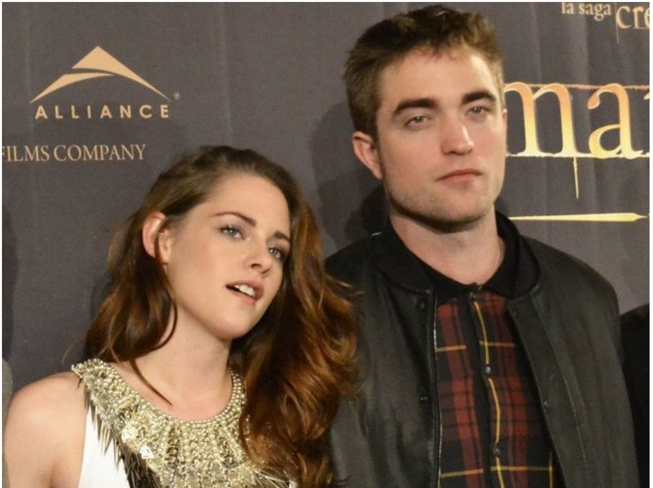
Kristen Stewart and Rob Pattinson

This 'Twilight' couple, now split, was the center of media attention when the actress was caught cheating on longtime boyfriend Pattinson with director Rupert Sanders, who was married at the time and has two children.