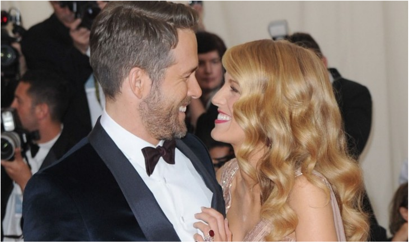
Ryan Reynolds and Blake Lively

This adorable couple met while filming 'Green Lantern,' in which Reynolds played the superhero and Lively was his love interest. They were married on September 2012 and most recently walked the red carpet together at the Cannes Film Festival.