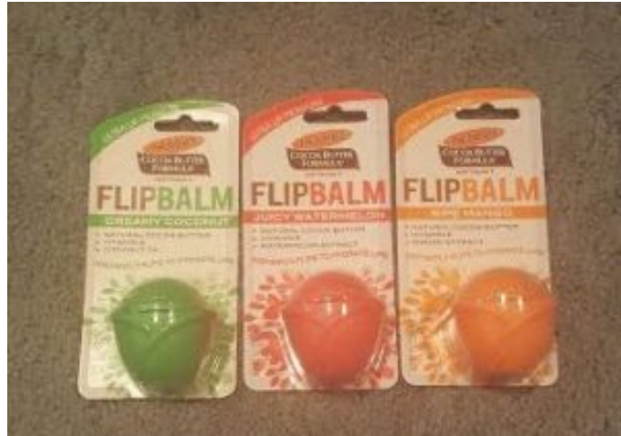
Palmer's Cocoa Butter Formula FlipBalm