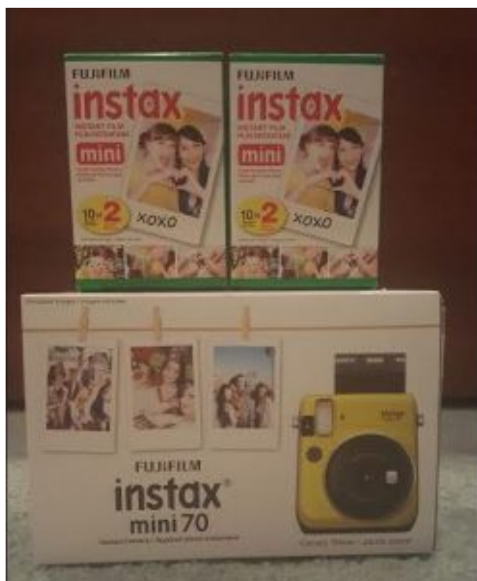
FUJIFILM Instax Mini 70