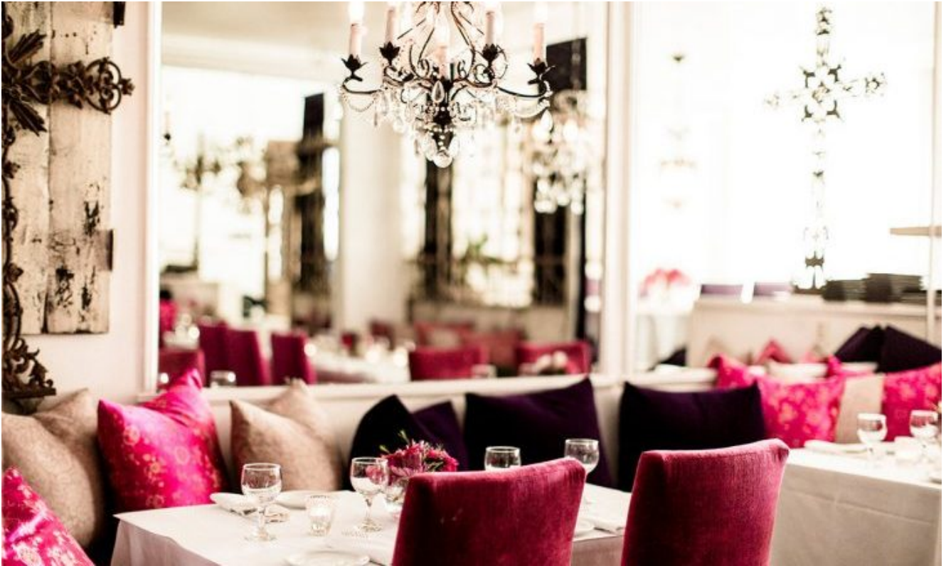
An elegant dining area at SUR

you feel like you have traveled abroad without leaving LA.