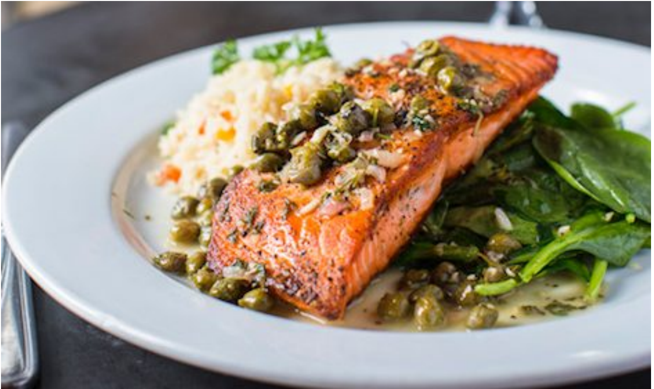
Roasted Salmon Dish