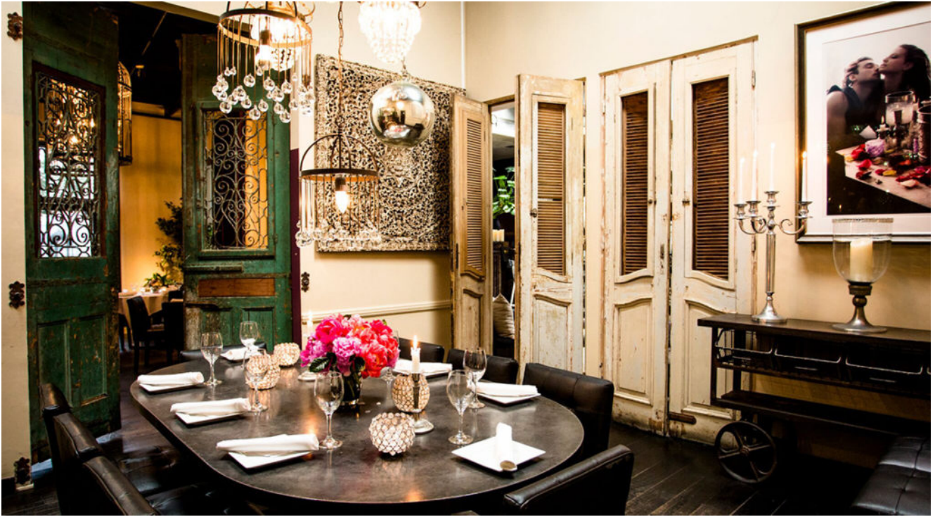
One of the many dining rooms at SUR

Outside of the ambiance, the food is what makes this restaurant stand out. Bizzoco had the opportunity to try out various items from the SUR menu. She started out with the Chicken Steamed Dumplings and Fried Goat Cheese appetizers, which were both delicious.