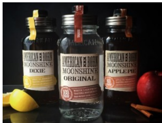
American Born Moonshine: Dixie, Original, and Apple Pie flavors.

Signature Sole Socks are designed to fit everyone with sizes running from small to large for both males and females. These versatile socks come in a range of colors, including pink, orange, and even leopard and zebra print. Depending on the style, the socks will cost you between $25 and $35. You'll be giving more than just one gift when you purchase a pair of Signature Sole Socks: A portion of each sale goes towards a sock donation to children in the hospital. This low-priced gift is sure to make everyone's holiday season a lot more cozy!