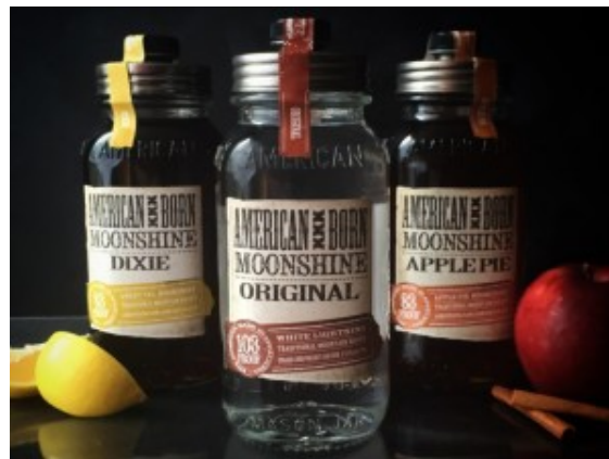
American Born Moonshine: Dixie, Original, and Apple Pie flavors.

Signature Sole Socks are designed to fit everyone with sizes running from small to large for both males and females. These versatile socks come in a range of colors, including pink, orange, and even leopard and zebra print. Depending on the style, the socks will cost you between $25 and $35. You'll be giving more than just one gift when you purchase a pair of Signature Sole Socks: A portion of each sale goes towards a sock donation to children in the hospital. This low-priced gift is sure to make everyone's holiday season a lot more cozy!