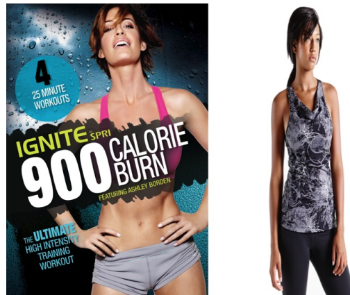
900 Calorie Burn DVD and the Petal Back Racer Tank from Gaiam.

Our favorite drink for the holiday season is the Ginger Snap, which is two ounces of American Born Moonshine in Apple Pie mixed with four ounces of ginger ale. It's the perfect treat to warm you up after a chilly day spent playing in the snow with your loved ones! That special guy in your life will love adding this unique liquor to his bar selection.