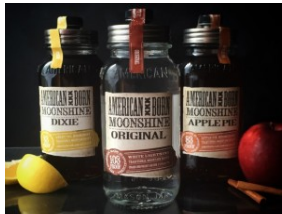
American Born Moonshine: Dixie, Original, and Apple Pie flavors.

Signature Sole Socks are designed to fit everyone with sizes running from small to large for both males and females. These versatile socks come in a range of colors, including pink, orange, and even leopard and zebra print. Depending on the style, the socks will cost you between $25 and $35. You'll be giving more than just one gift when you purchase a pair of Signature Sole Socks: A portion of each sale goes towards a sock donation to children in the hospital. This low-priced gift is sure to make everyone's holiday season a lot more cozy!