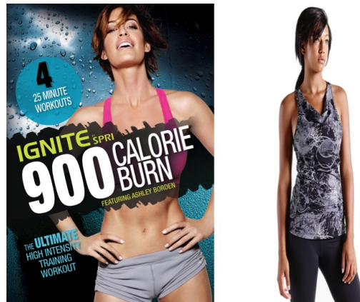
900 Calorie Burn DVD and the Petal Back Racer Tank from Gaiam.

Our favorite drink for the holiday season is the Ginger Snap, which is two ounces of American Born Moonshine in Apple Pie mixed with four ounces of ginger ale. It's the perfect treat to warm you up after a chilly day spent playing in the snow with your loved ones! That special guy in your life will love adding this unique liquor to his bar selection.