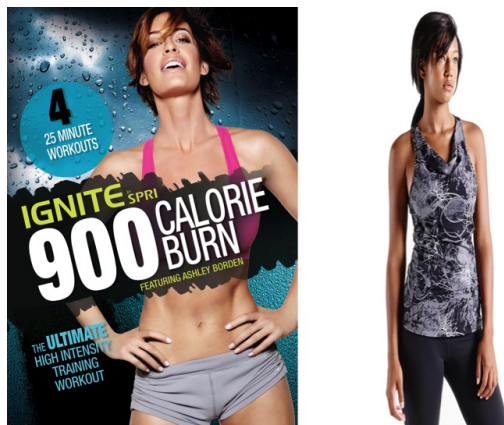
900 Calorie Burn DVD and the Petal Back Racer Tank from Gaia.

Our favorite drink for the holiday season is the Ginger Snap, which is two ounces of American Born Moonshine in Apple Pie mixed with four ounces of ginger ale. It's the perfect treat to warm you up after a chilly day spent playing in the snow with your loved ones! That special guy in your life will love adding this unique liquor to his bar selection.