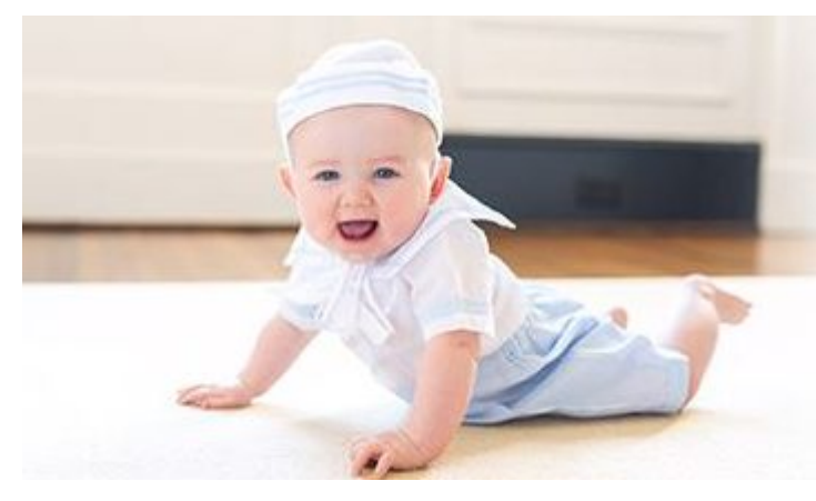
By Marissa Donovan

Do you plan on seeing a movie for your next night out with your partner? Whether you plan on going to a theater or a friend's house to watch a film, we have super cute movie-inspired shoes to impress your date and movie loving friends! This is one fashion trend that will never go out of style!