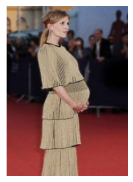
Clemence Poesy.

Actress and model Clemence Poesy looks calm and serene as she shows off her baby bump on the red carpet in this beautiful tasseled and tiered dress. The gold color and its waterfall of fun fringed layers make this dress stand out, even though otherwise it remains tastefully simple.