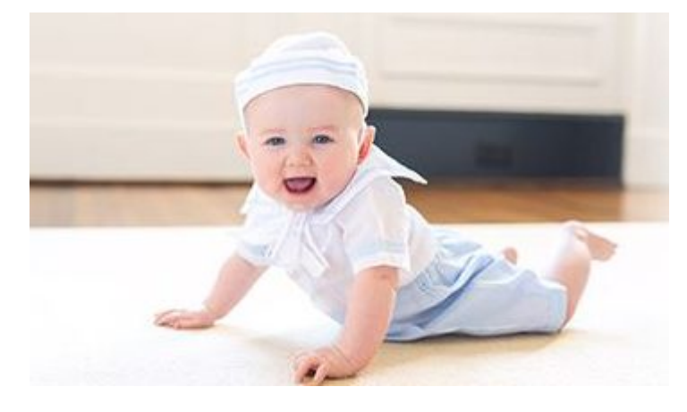
By Noelle Downey

While there's plenty of glamorous ways that celebrities shake up their style, a new trend on the move is turning celebrity fashion into fun with a terrific new twist: tassels. That's right, the newest trend is tassels, and all your favorite stars are jumping on the bandwagon. Whether adding a bit of a funky twist to an otherwise conservative dress or going full fringe to make sure they stand out on any red carpet, these ladies all seem to know a little extra flair never hurt anyone.