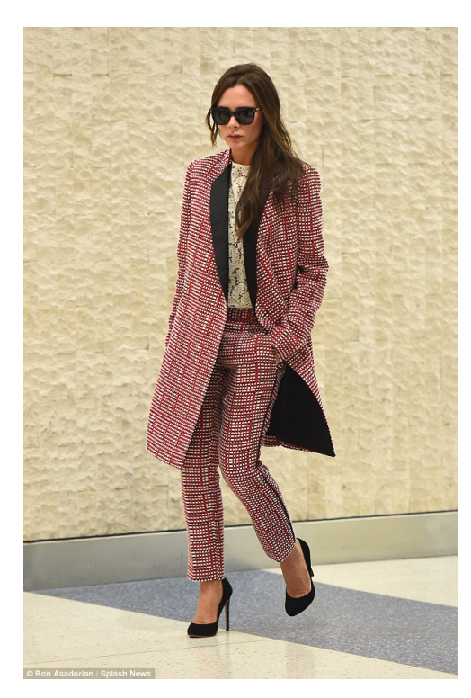
Victoria Beckham rocks a matching set.

Related Link: <u>Celebrity Looks: 3 Easy Ways To Dress Like a</u> Celebrity