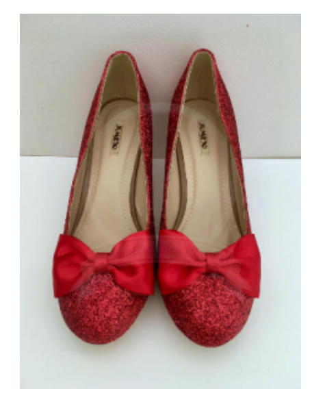
Red Glitter Heels Platforms by Customised Bling Thing.

Ruby High Heel Sippers from The Wizard of Oz: You don't need to click your heels together to have a great movie night! Wear these flashy red shoes with a red skirt or dress. These heels will give you an extra lift and naturally give you a red carpet walk on your way to your movie theater seat.