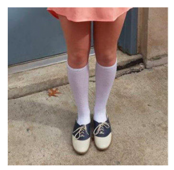
Suzy Bishop Sunday School Shoes by Time Creates Memories.

Related Link: Dating Advice: First Date Fashion Do's And Don'ts