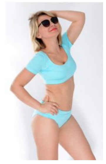
Crop Top Bikini in Aqua from Eulalee Swim.

This surfer girl look is cute for the beach or the pool!