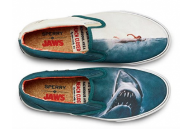
Jaw Flats by Sperry.

Shark Sperry Flats from Jaws: Make sure not to get any popcorn butter stains on these jaw dropping shoes! Wear these thrilling flats with a slim cut skinny jean and beach waves.