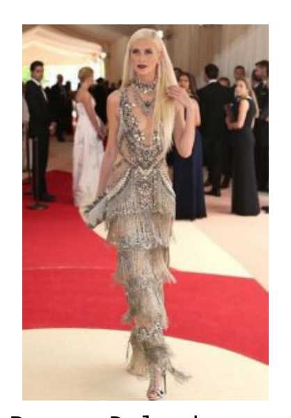
Poppy Delevingne. Photo: Instagram

Poppy Delevingne stuns in this iridescent dress that takes tassels to a whole new level. With its gorgeous silver sheen, layers of fringe, and sparkling jewel accents, this is definitely a dress to turn heads, and if her confident strut in this picture is any indication, she seems she knows it, too!