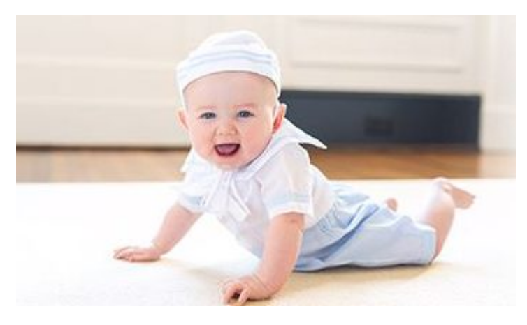
By <u>Melissa Lee</u>

In the fashion world, trends always seem to recycle. Those bell-bottom jeans your mom used to rock in the '70s have resurfaced, and 1980s inspired graphic tee-shirts are always in style. But somehow, all the childhood outfits you wore in the '90s are also super trendy — that's right, the '90s are back! Between your old hair scrunchies, overalls, and chokers, we are definitely supportive of this fashion trend.