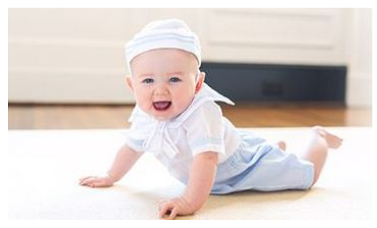
By <u>Melissa Lee</u>

It seems like celebrities always look amazing head-to-toe, even on the days where they're just running errands and grabbing coffee. If we're being realistic, this is most likely due to the fact that they're rich and able to afford all the best designer pieces — especially shoes! If you're in the market for some celebrity style shoes but aren't ready to drop major cash, Cupid may be able to help you out.