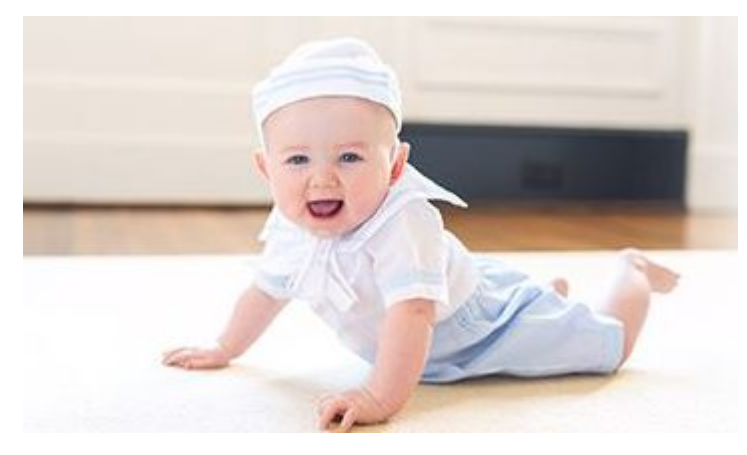
By <u>Marissa Donovan</u>

A new bikini trend is happening, and it's the crop top bikini! A crop top bikini can be off-the-shoulder or have full-shoulder tops. It's a new swim wear trend that's perfect for your next vacation or poolside <u>date night</u>. The best thing about this <u>fashion trend</u> is how easy it is to match with everyday clothing and other beach apparel.