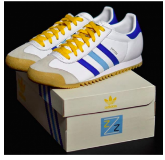
Adidas Zissou Shoes from Adidas

Adidas Zissou Sneakers from The Life Aquatic with Steve Zisso: These sneakers are a creation from a Wes Anderson movie! The shoes are selling for a limited time, but you might be able to buy a pair with a little research online. These movie inspired shoes will go great will sweats or jeans.