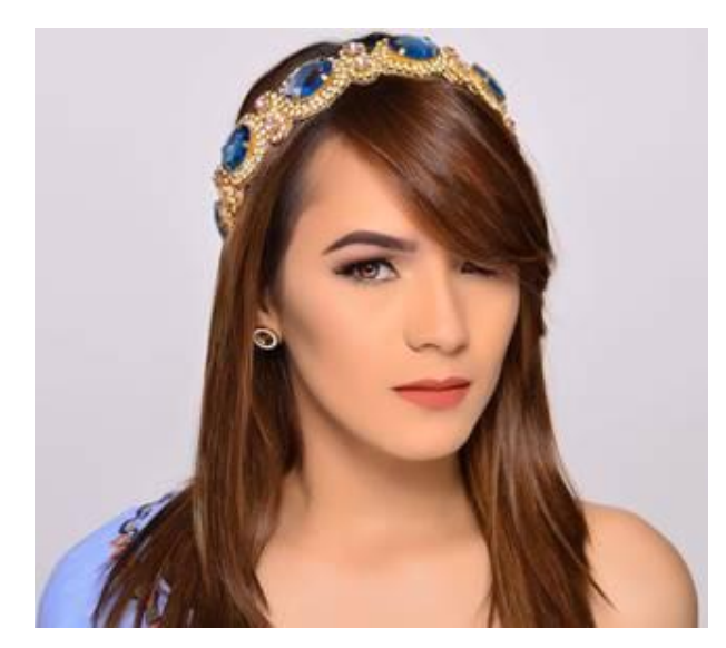
PASHA: Jewelry for Your Hair

Head over to PASHA's website if you're interested in purchasing from either line of accessories. However, PASHA also has retail stores all over the globe, including London, New York, the Caribbean, Dubai, Panama and more.