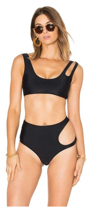
Cut out high waisted bathing suit.

out bathing suits are super on trend. Small cut outs in your high waisted bikini can give you a slightly sexier edge while still being able to cover up certain parts of your body. Instead of opting for a regular bikini, try out one of these edgier swimsuits.